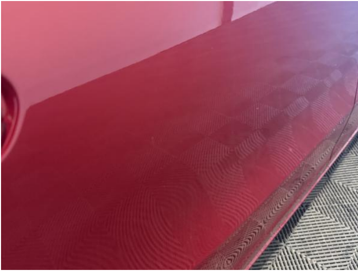
15: Door osr Chipped 1 To 5