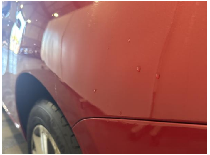
10: Qtr Panel nsr Dented With Paint Damage