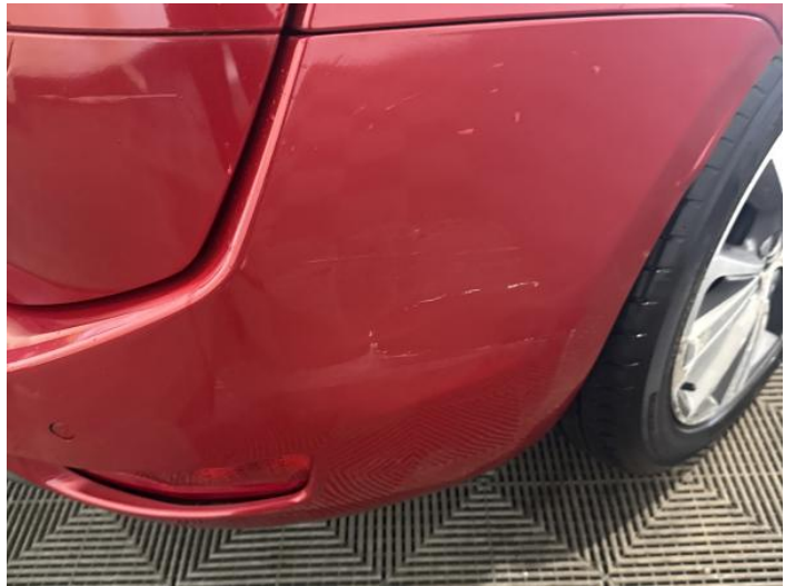
12: Bumper Rear Scratched Over 100mm Thru Paint