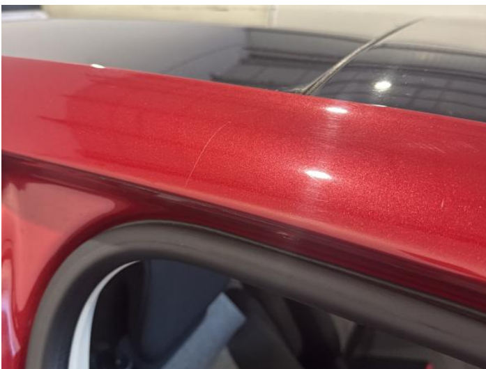
19: A Post os Scratched Over 25mm Thru Paint