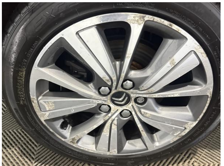
14: Wheel osr Scratched Over 50mm