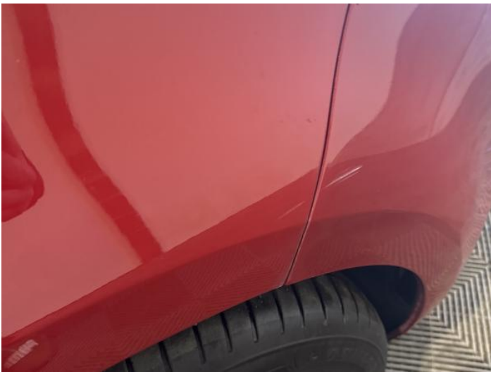
17: Wing osf Scratched UpTo 25mm Thru Paint