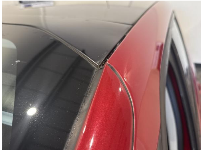
4: Roof Dented Over 30mm