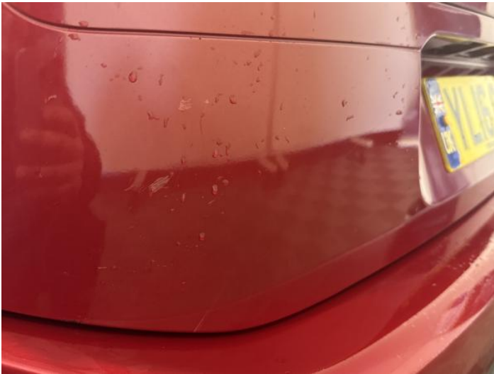
11: Tailgate Scratched Over 25mm Thru Paint