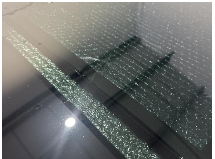
20: Glass Roof Scratched Over 30mm