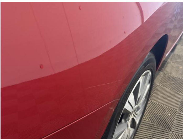
13: Qtr Panel osr Scratched Over 25mm Thru Paint