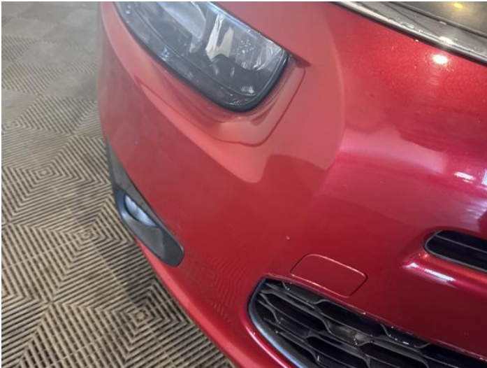
3: Bumper Front Scratched 25 to 100mm Thru Paint