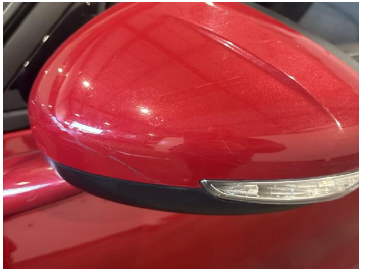
6: Door Mirror Assy nsf Scratched (Painted) UpTo 25mm Thru Paint