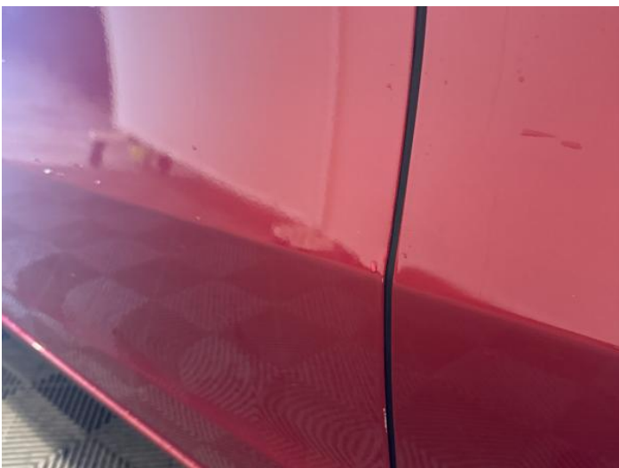
7: Door nsf Chipped Edge Chip