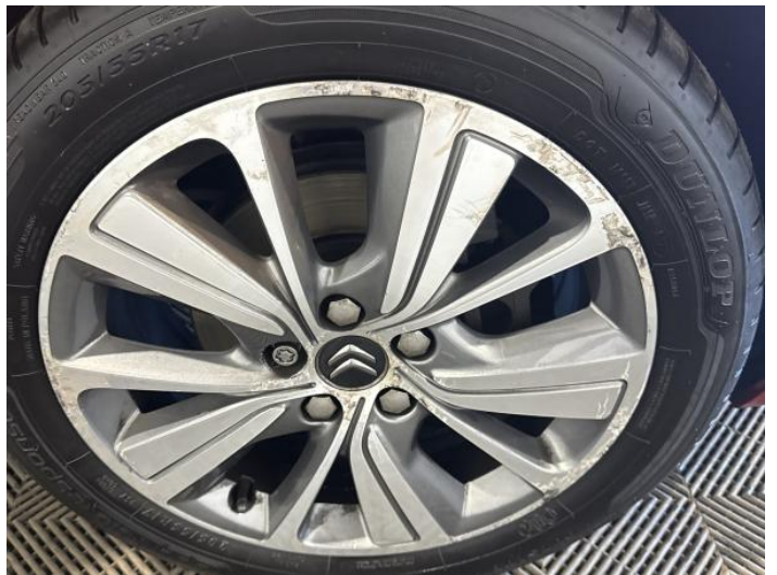
18: Wheel osf Scratched Over 50mm