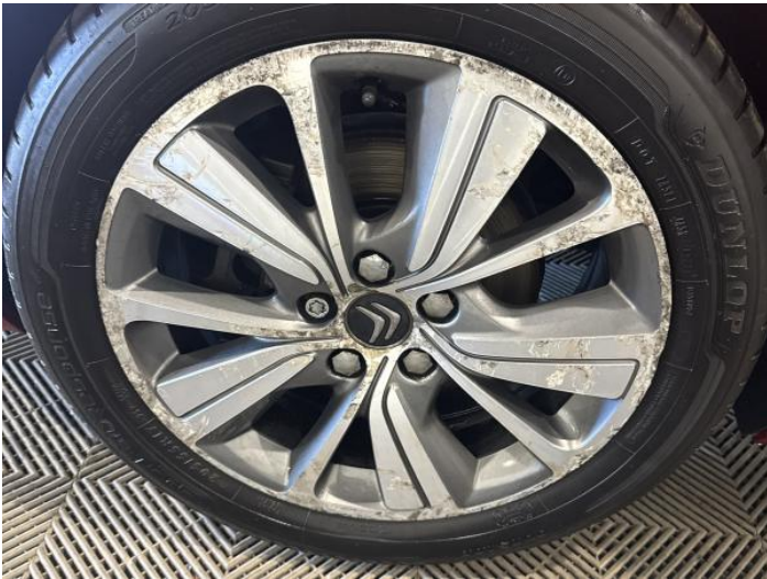
5: Wheel nsf Scratched Over 50mm