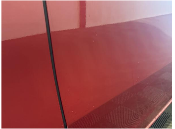
16: Door osf Chipped Edge Chip