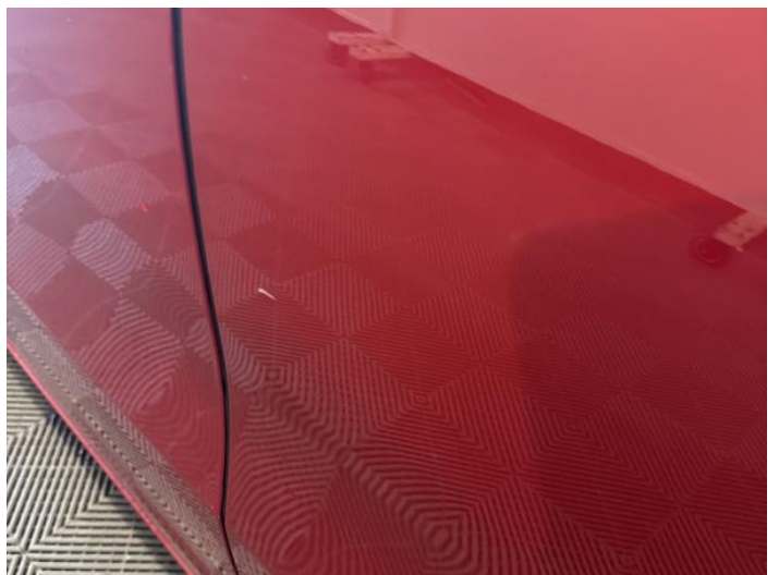
8: Door nsr Scratched UpTo 25mm Thru Paint