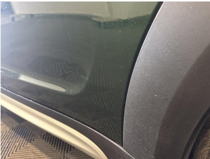
5: Door nsr Scratched UpTo 25mm Thru Paint