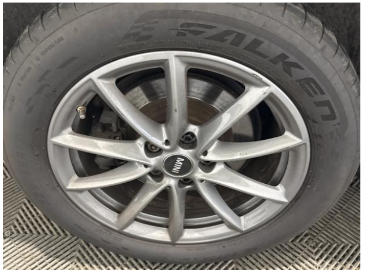
6: Wheel osr Scratched Up To 50mm