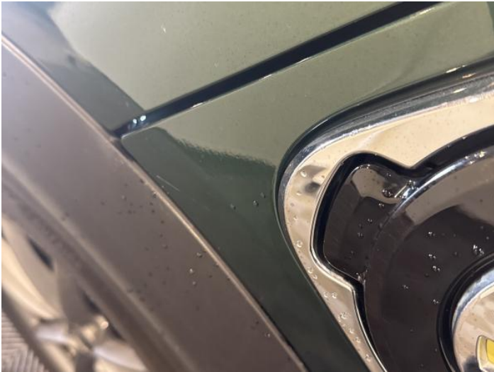
3: Wing nsf Scratched UpTo 25mm Thru Paint