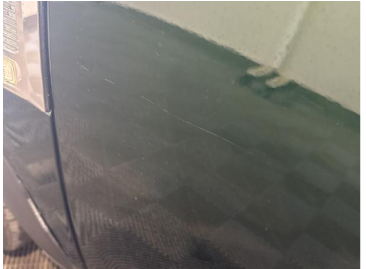
4: Door nsf Scratched Over 25mm Thru Paint