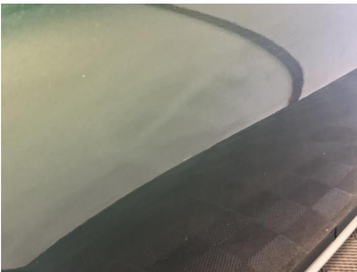
7: Door osr Scratched UpTo 25mm Thru Paint