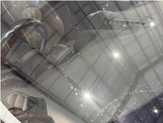
9: Screen Front Chipped UpTo 10mm