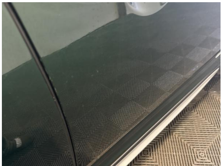
8: Door osf Chipped 1 To 5