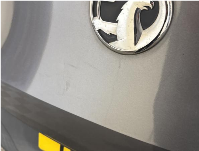
15: Tailgate Scratched Over 25mm Thru Paint