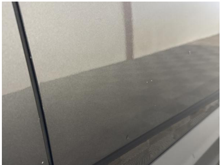
12: Door osf Dented Between 10mm + 30mm