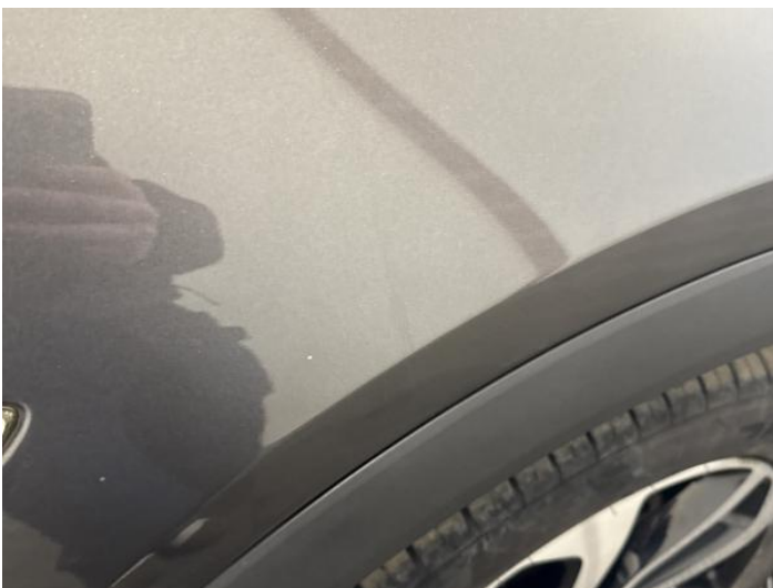
13: Wing osf Chipped 1 To 5