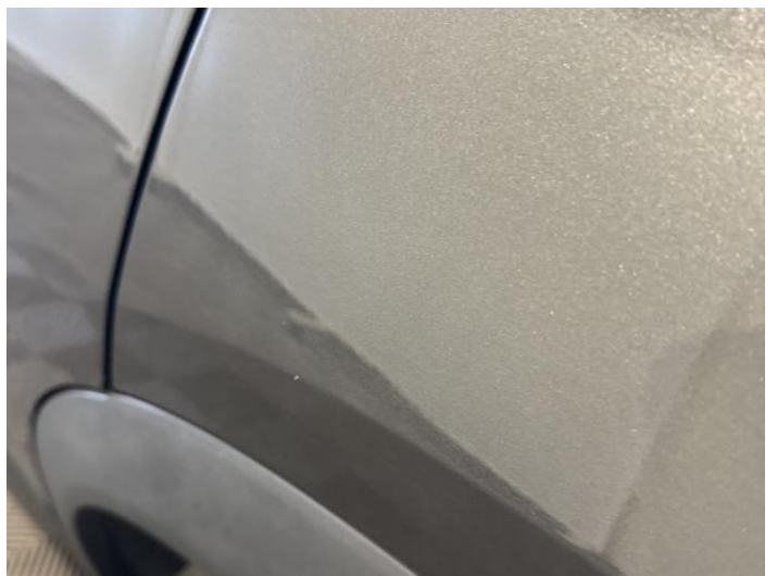
8: Qtr Panel nsr Chipped 1 To 5