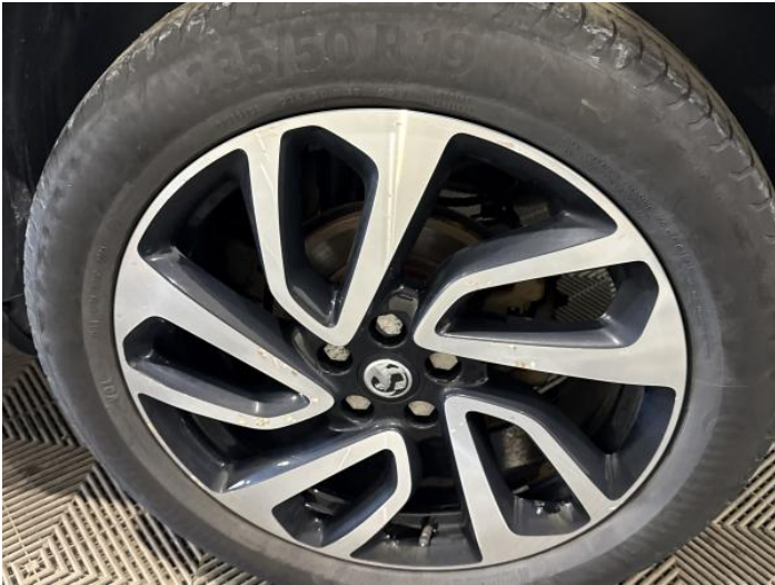
9: Wheel nsr Scratched Over 50mm