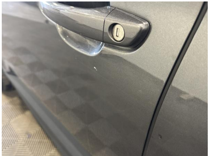
6: Door nsf Chipped 1 To 5