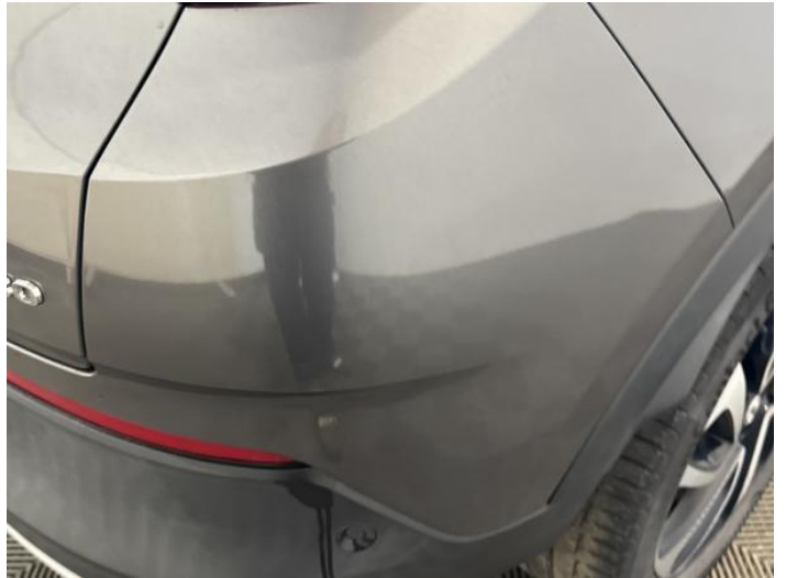
10: Bumper Rear Scratched 25 to 100mm Thru Paint