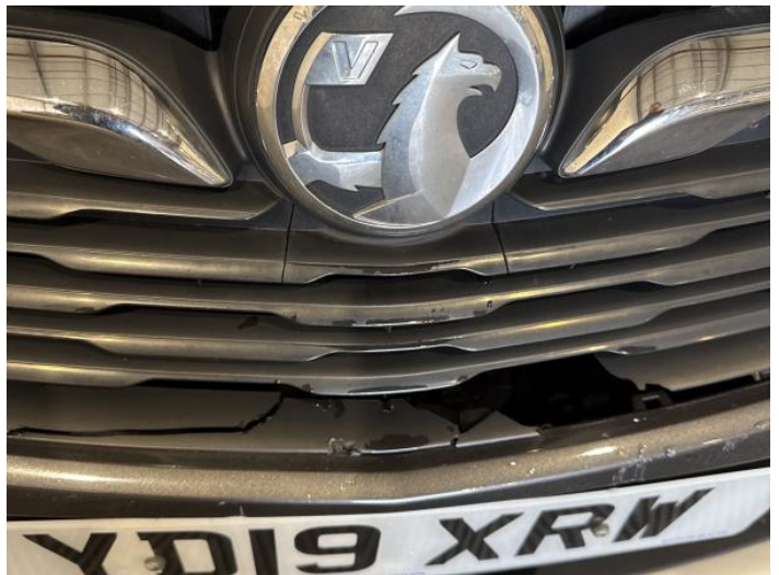
2: Bumper Front Grill Broken Replace