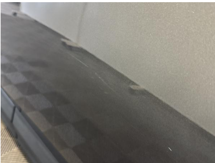
7: Door nsr Scratched Over 25mm Thru Paint