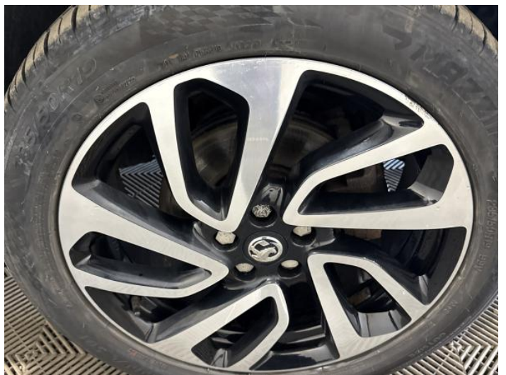
14: Wheel osf Scratched Over 50mm