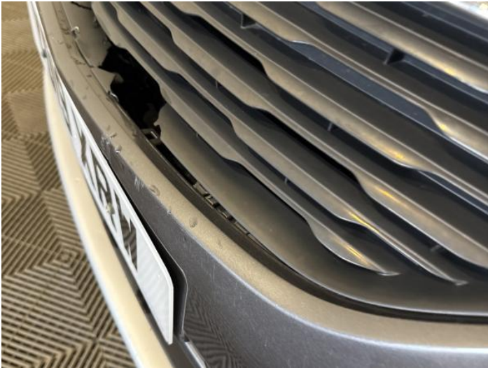
3: Bumper Front Scratched 25 to 100mm Thru Paint