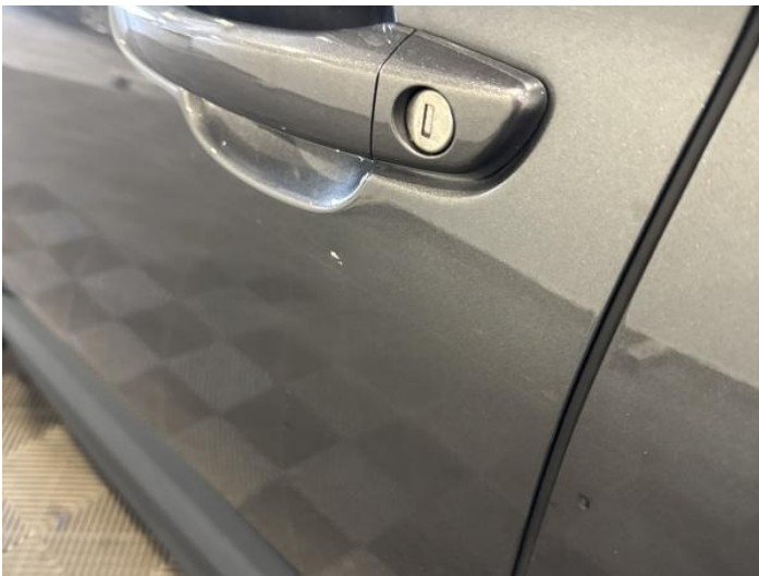
5: Door nsf Dented Between 10mm + 30mm