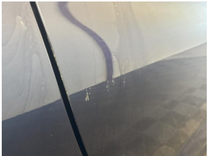
12: Door osf Scratched Over 25mm Thru Paint