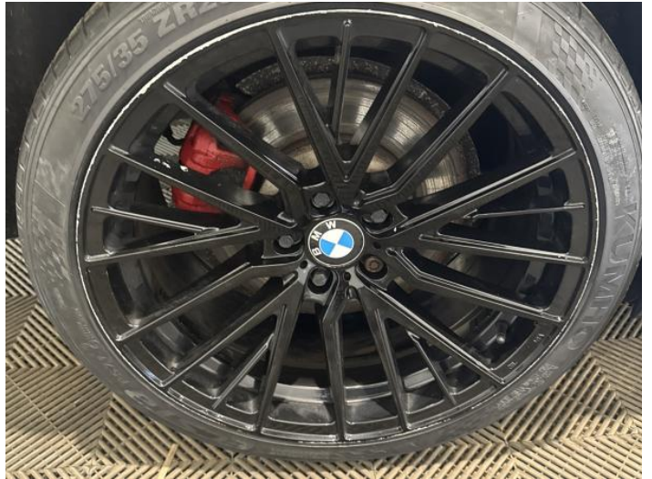
10: Wheel osr Scratched Over 50mm