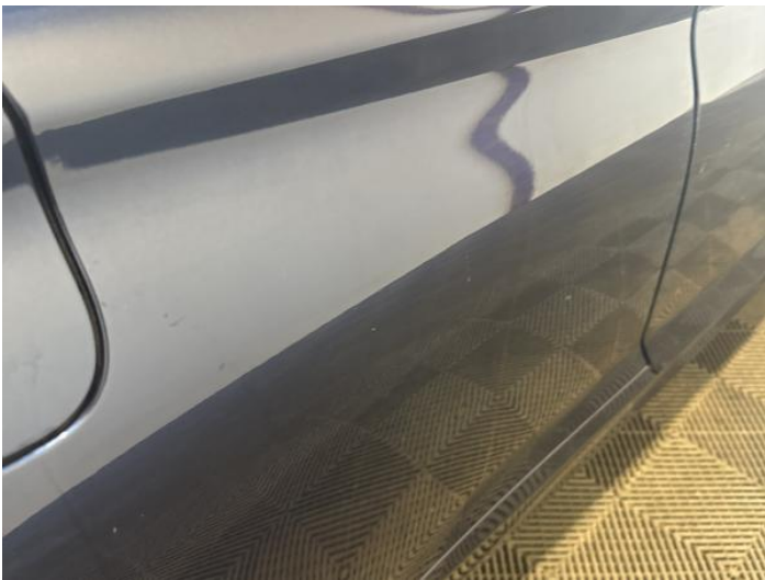
11: Qtr Panel osr Dented Over 30mm