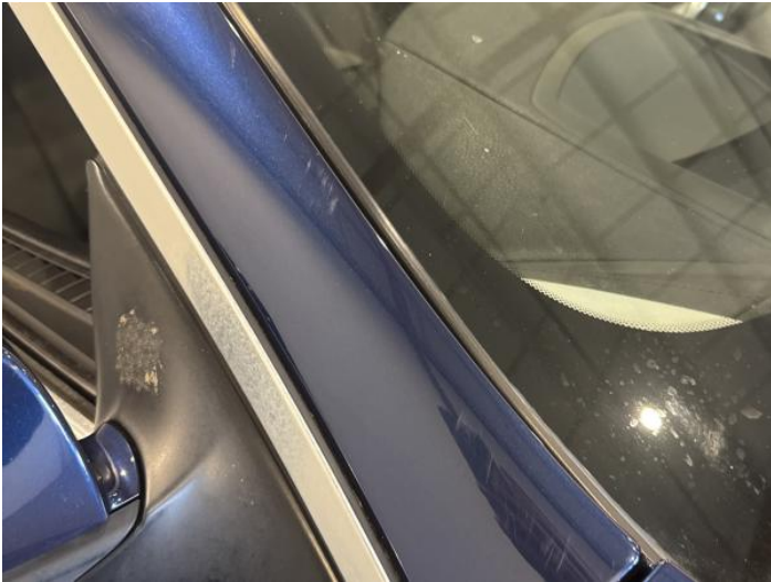
15: A Post os Scratched Over 25mm Thru Paint