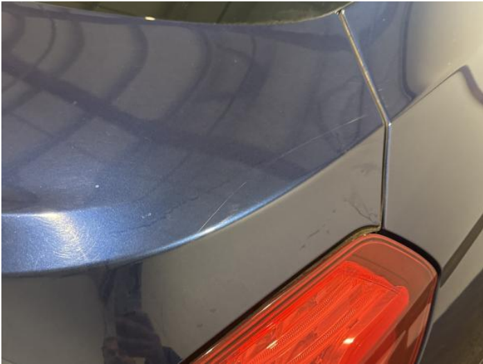
9: Boot Lid Scratched Over 25mm Thru Paint