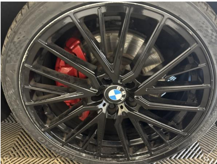
17: Wheel osf Scratched Over 50mm