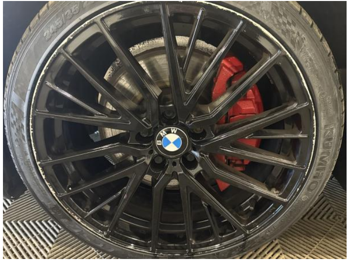
4: Wheel nsf Dented UpTo 30mm (Alloy)