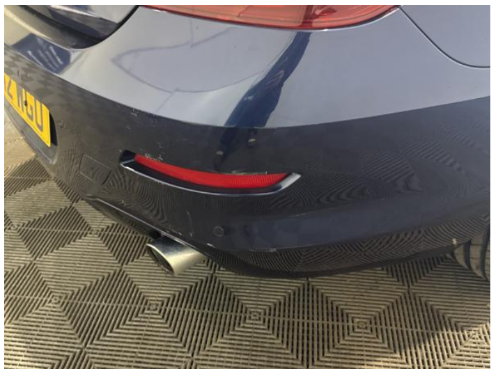
8: Bumper Rear Scratched Over 100mm Thru Paint