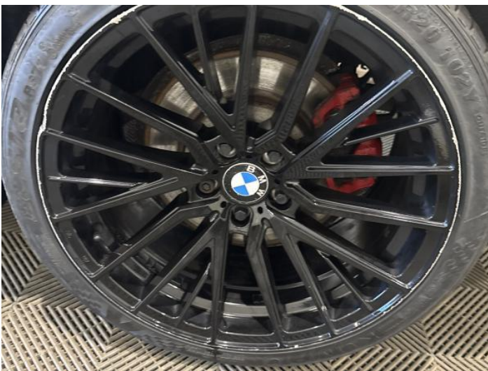
7: Wheel nsr Dented UpTo 30mm (Alloy)