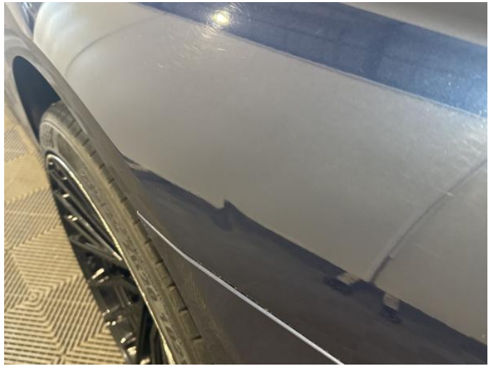
6: Qtr Panel nsr Dented Over 30mm