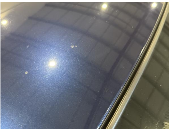
13: Roof Chipped 1 To 5