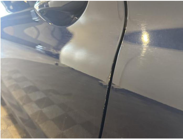
5: Door nsf Chipped Edge Chip