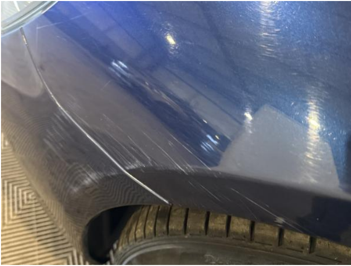
3: Wing nsf Scratched Over 25mm Thru Paint