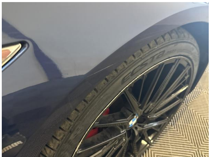
14: Wing osf Scratched Over 25mm Thru Paint