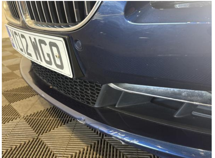
2: Bumper Front Dented With Paint Damage