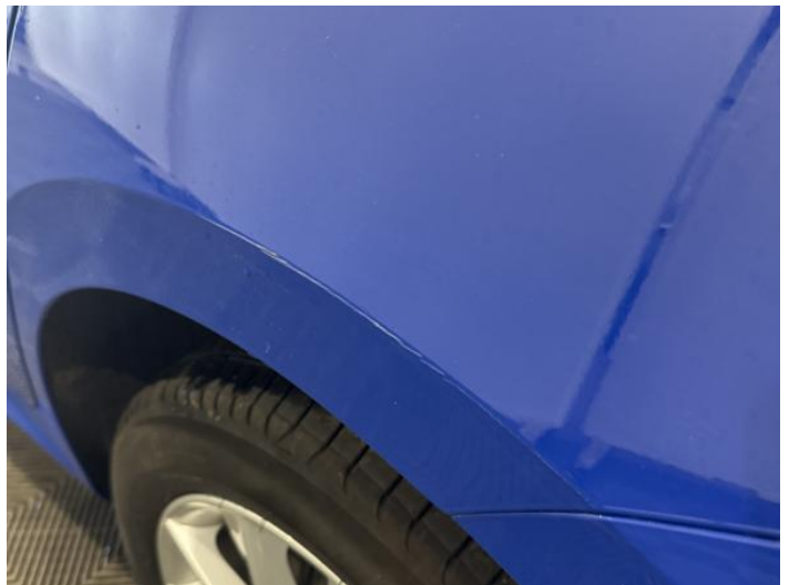
2: Qtr Panel nsr Scratched Over 25mm Thru Paint