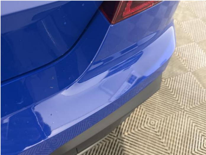
3: Bumper Rear Chipped 1 To 5