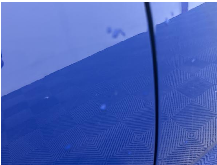
5: Door osr Chipped 1 To 5