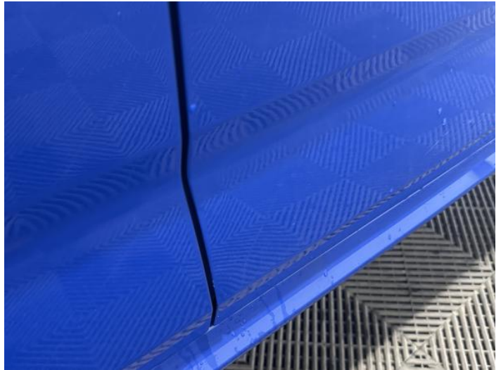
4: Door osf Chipped Edge Chip