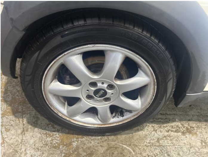
5: Wheel osr Corroded Light