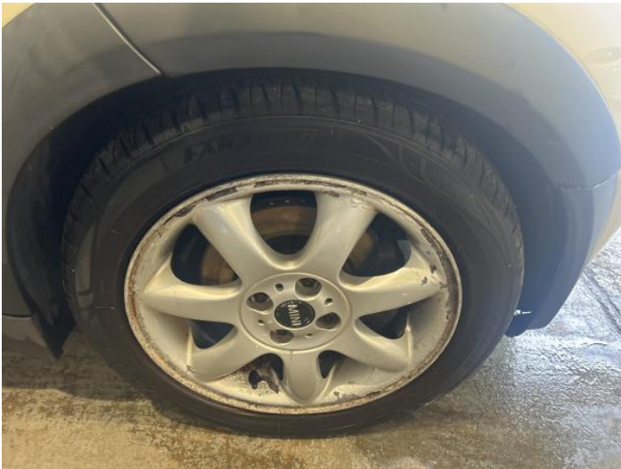
1: Wheel of Corroded Light