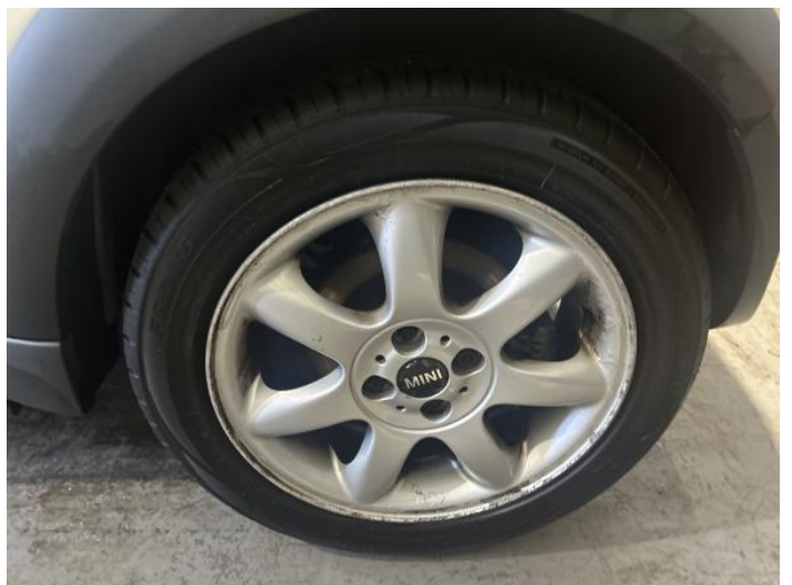
8: Wheel nsr Corroded Light