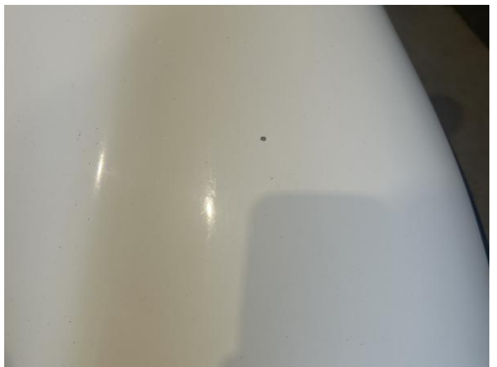
14: Bonnet Chipped 1 To 5