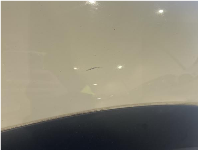
15: Bonnet Scratched UpTo 25mm Thru Paint