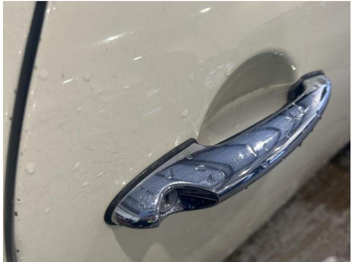
4: Door osf Scratched Over 25mm Not Thru Paint