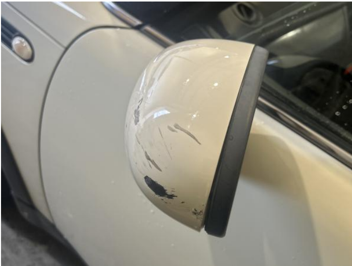
11: Door Mirror Assy nsf Scratched (Painted) Over 25mm Thru Paint