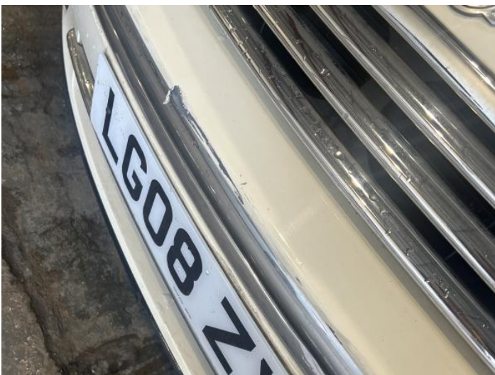
13: Bumper Front Scratched Over 100mm Thru Paint