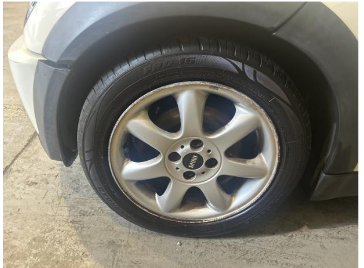
12: Wheel nsf Scratched Over 50mm