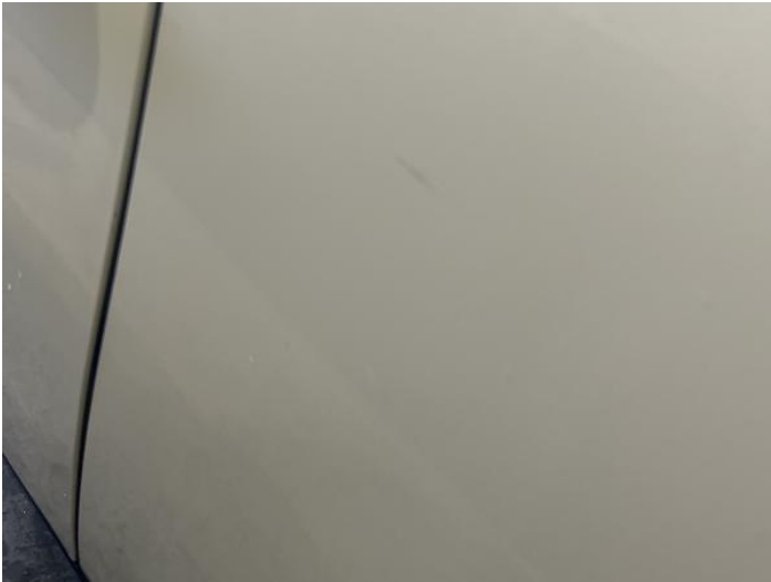
9: Qtr Panel nsf Scratched UpTo 25mm Not Thru Paint