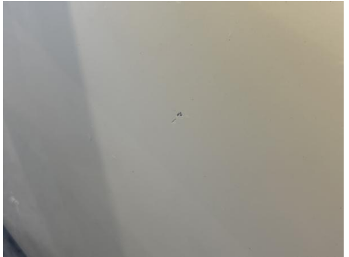
10: Door nsf Chipped 1 To 5