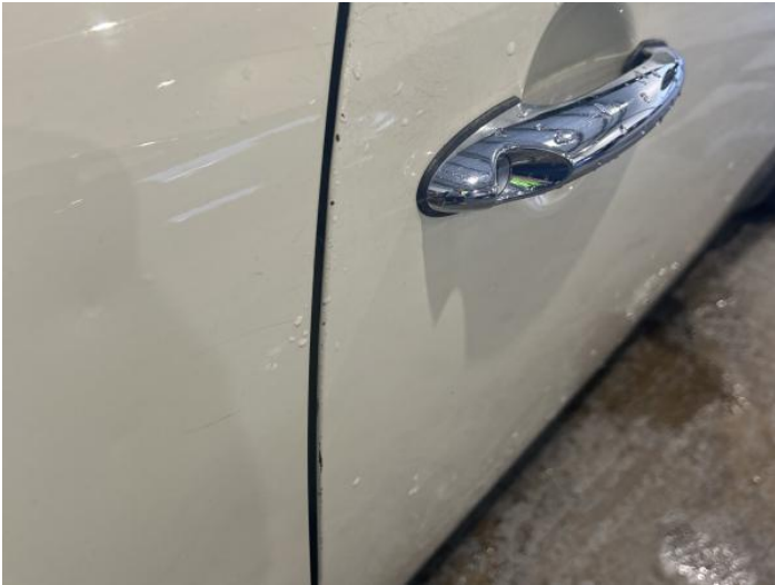
3: Door osf Chipped Edge Chip