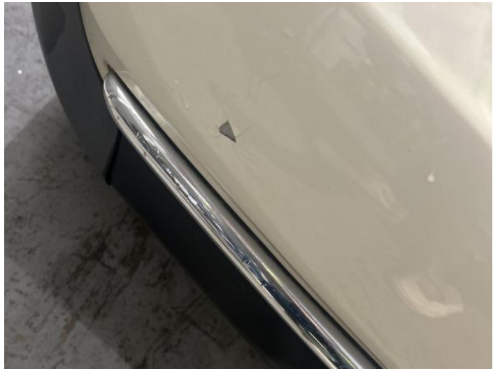
6: Bumper Rear Poor Previous Repair Paint Flake