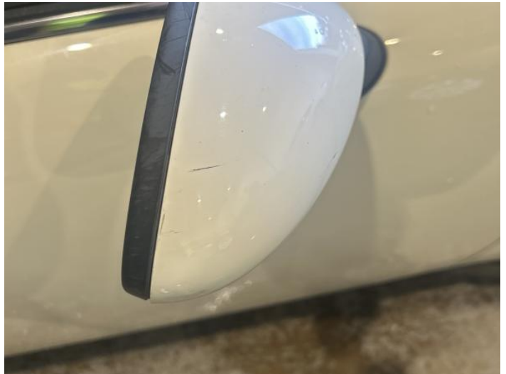
2: Door Mirror Assy of Scratched (Painted) Up To 25mm Thru Paint