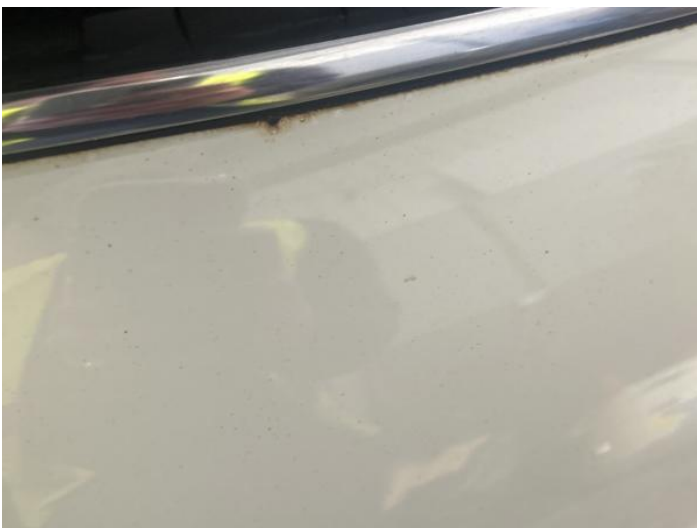
7: Tailgate Rusted UpTo 5mm