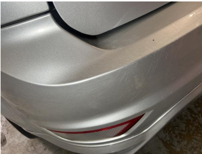
5: Bumper Rear Poor Previous Repair Poor Paint