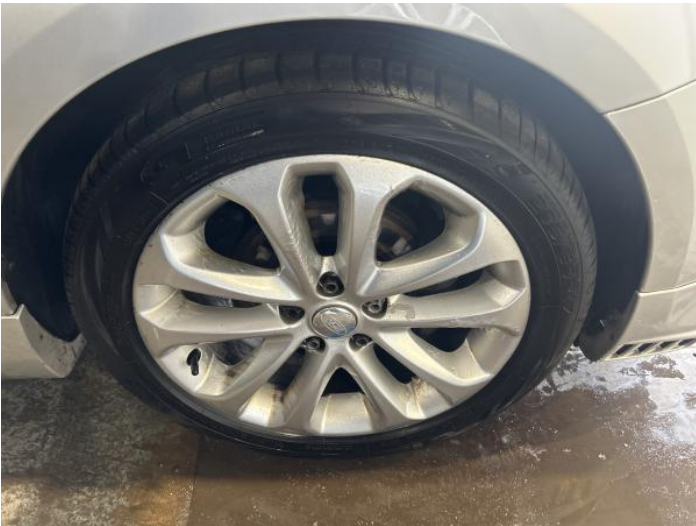
1: Wheel osf Corroded Light