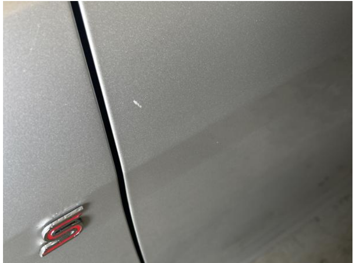
4: Door nsf Chipped 1 To 5