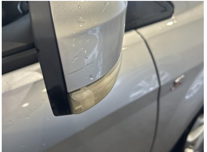
2: Door Mirror Assy osf Scratched (Painted) Over 25mm Not Thru Paint