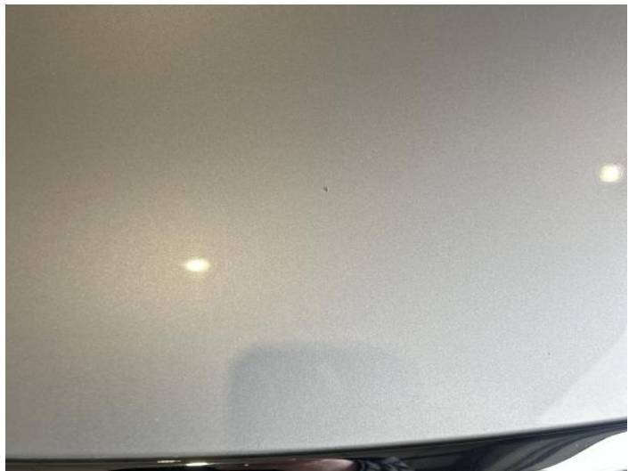
6: Bonnet Chipped 1 To 5