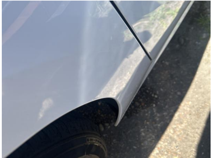
4: Qtr Panel osr Dented Between 10mm + 30mm