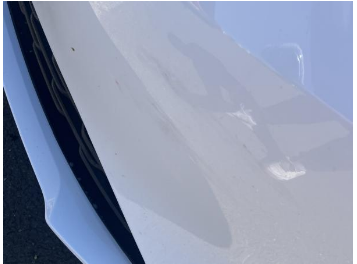
10: Bumper Front Scratched 25 to 100mm Thru Paint