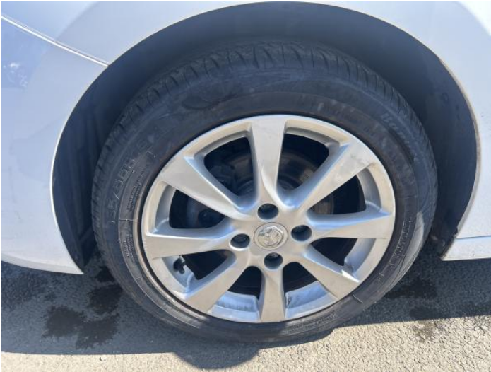
9: Wheel nsf Scratched Over 50mm