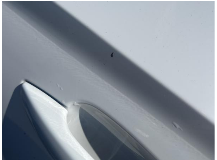
6: Door nsr Chipped 1 To 5