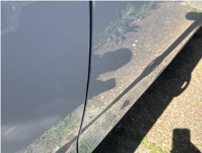
3: Door osf Chipped Edge Chip