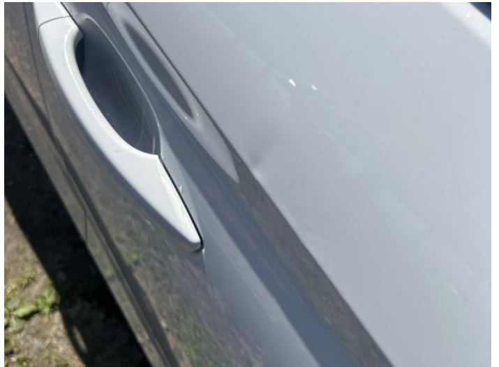
2: Door osf Dented Between 10mm + 30mm