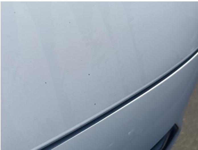
11: Bonnet Chipped 1 To 5