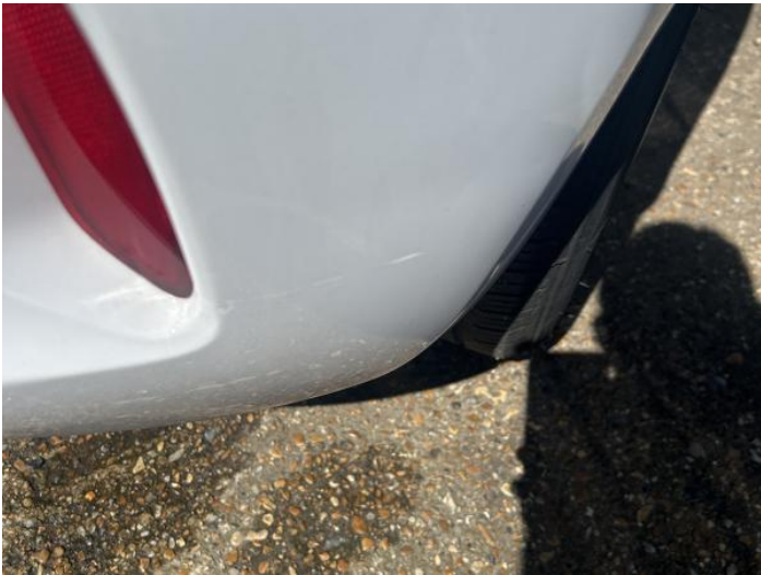
5: Bumper Rear Scratched 25 to 100mm Thru Paint