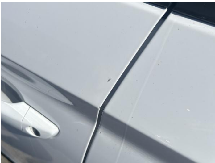
7: Door nsf Chipped 1 To 5