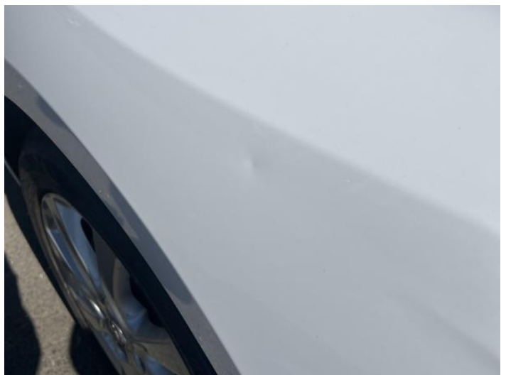
8: Wing nsf Dented 2 Or Less Up To 10mm