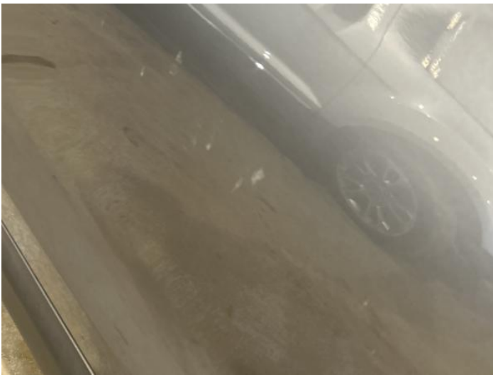
11: Door nsf Chipped Multiple Chips