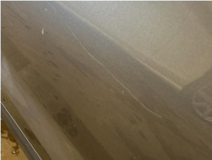
3: Door osf Scratched Over 25mm Thru Paint