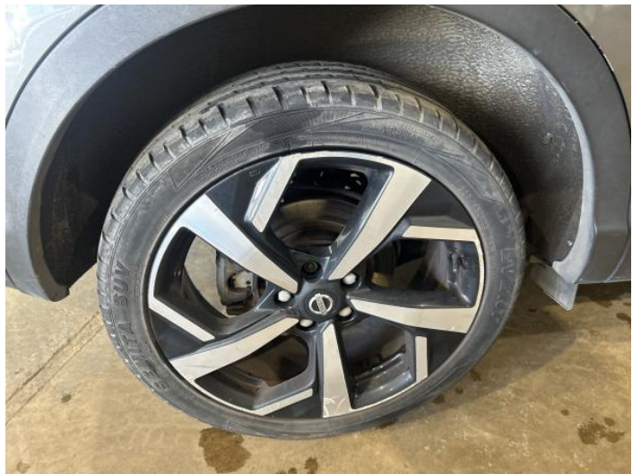
6: Wheel osr Scratched Over 50mm