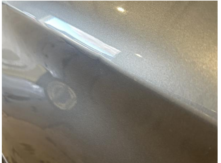
4: Door osr Dented 2 Or Less Up To 10mm