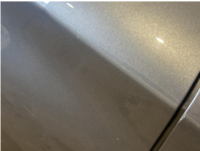
5: Door osr Chipped 1 To 5