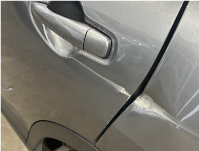
9: Door nsr Dented With Paint Damage