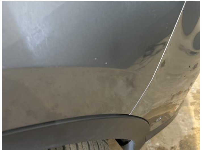
2: Wing osf Chipped 1 To 5