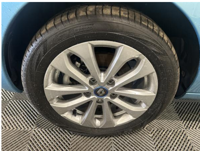
1: Wheel nsf Scratched Over 50mm