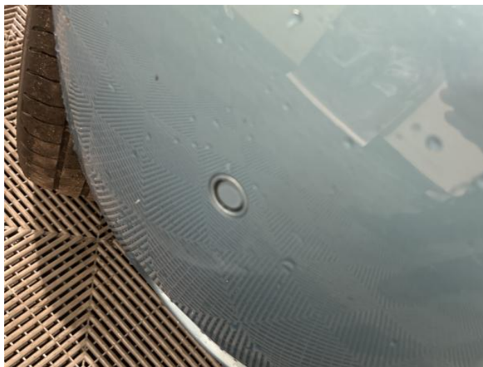
2: Bumper Rear Scratched Over 25mm Not Thru Paint