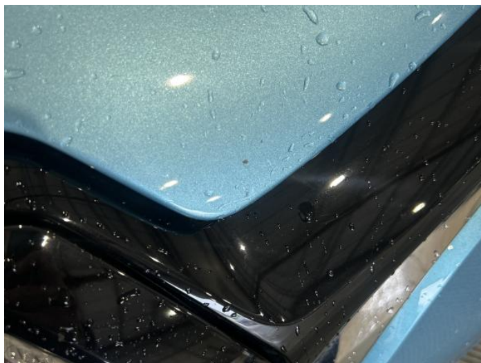
3: Bumper Front Scratched 25 to 100mm Thru Paint