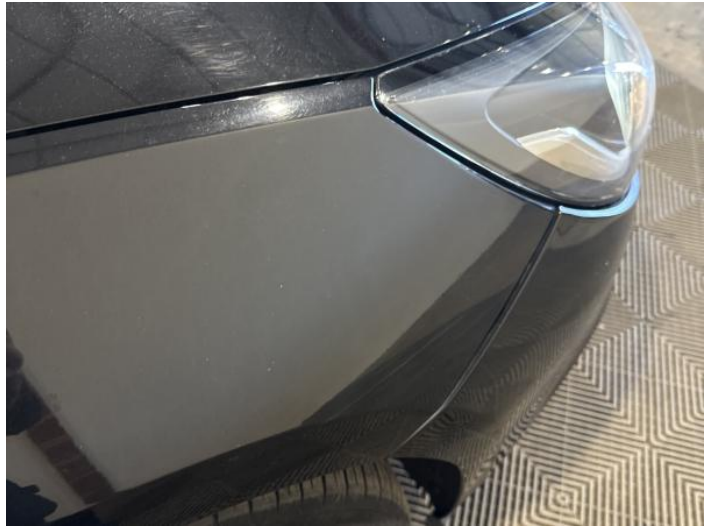
16: Wing ofsf Chipped 1 To 5