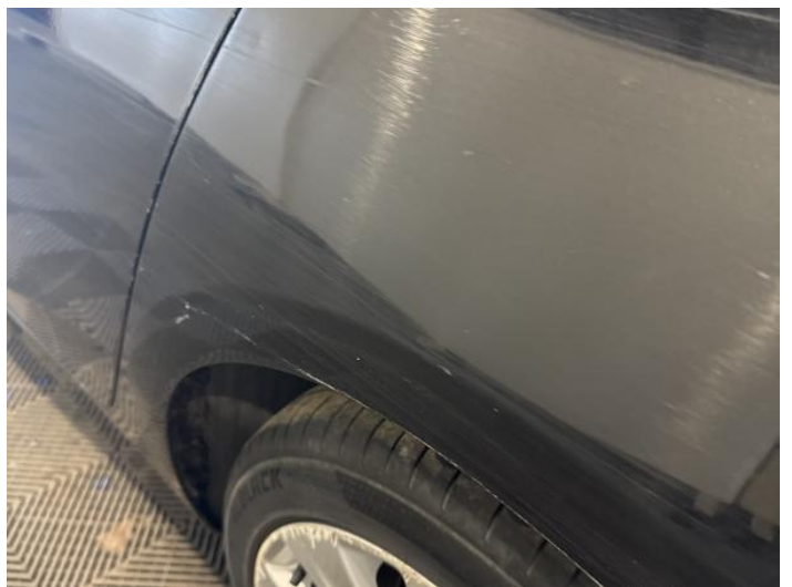
8: Qtr Panel nsr Dented With Paint Damage