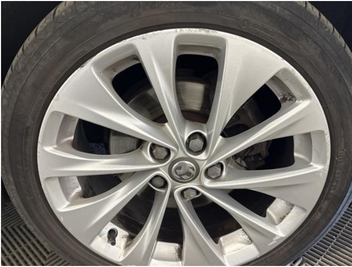
15: Wheel ofsf Scratched Over 50mm