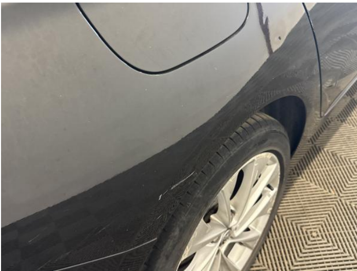
11: Qtr Panel osr Dented With Paint Damage