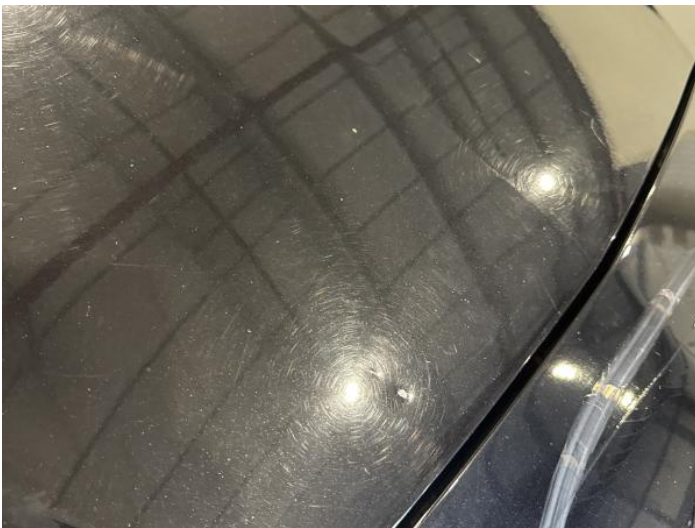
1: Bonnet Dented With Paint Damage