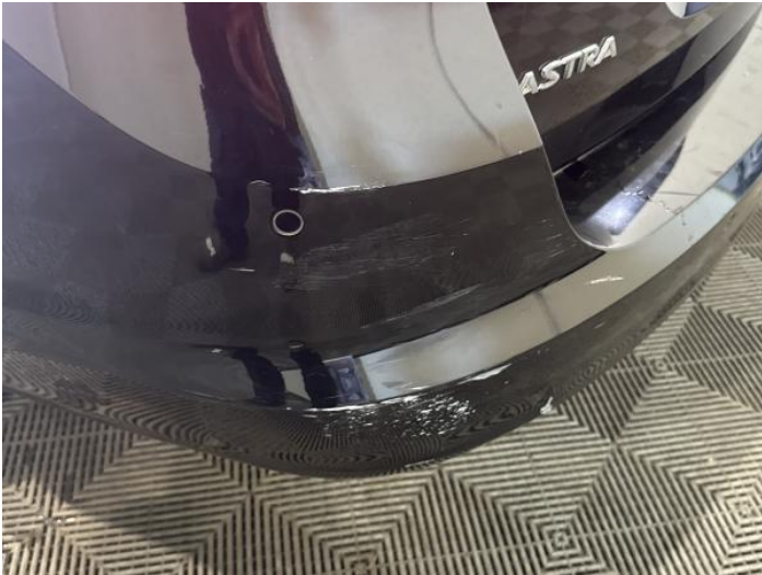
9: Bumper Rear Scratched Over 100mm Thru Paint