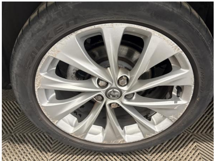
12: Wheel osr Scratched Over 50mm