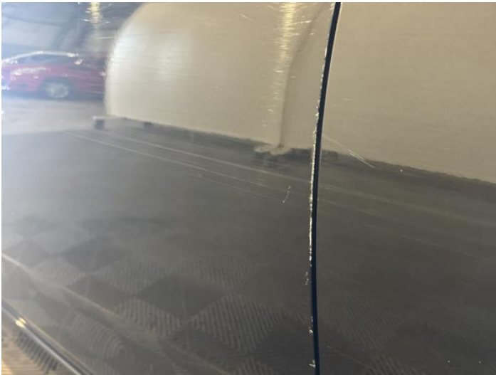
5: Door nsf Chipped Edge Chip