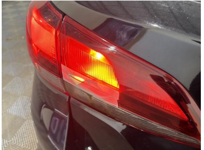
10: Lamp nsr Broken Replace