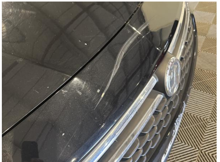
2: Bumper Front Dented With Paint Damage