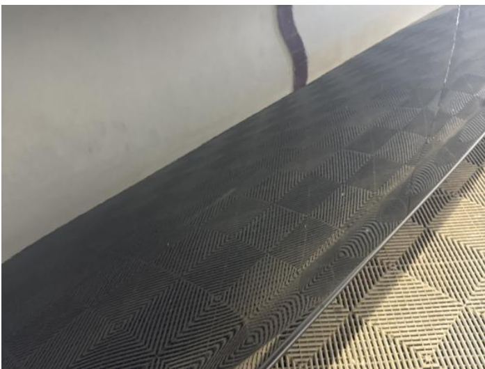
13: Door osr Scratched Over 25mm Thru Paint