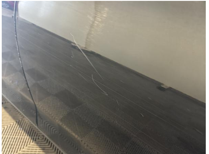
6: Door nsr Scratched Over 25mm Thru Paint