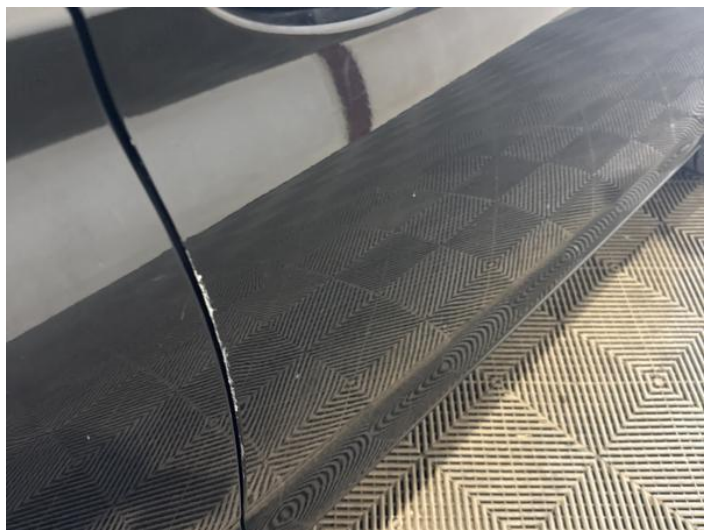
14: Door osf Dented With Paint Damage