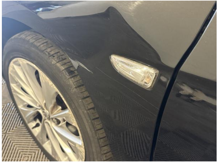
4: Wing nsf Dented With Paint Damage