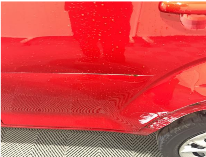
5: Door nsr Dented With Paint Damage