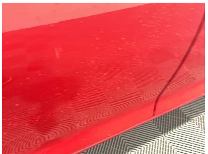
8: Door osr Scratched UpTo 25mm Thru Paint