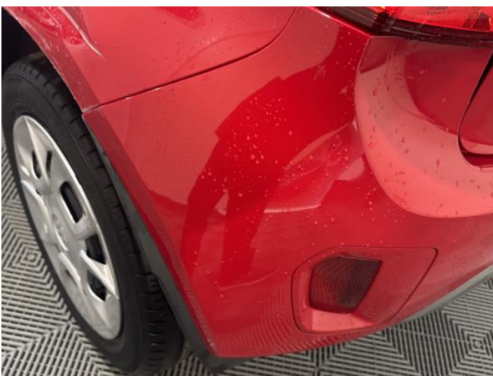
7: Bumper Rear Scratched Over 100mm Thru Paint