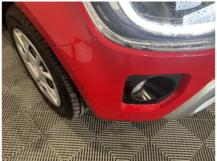
2: Bumper Front Cracked UpTo 25mm