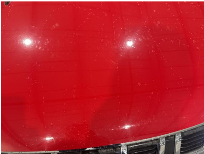
1: Bonnet Scratched Over 25mm Not Thru Paint