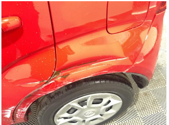
6: Qtr Panel nsr Dented Over 30% Of Panel