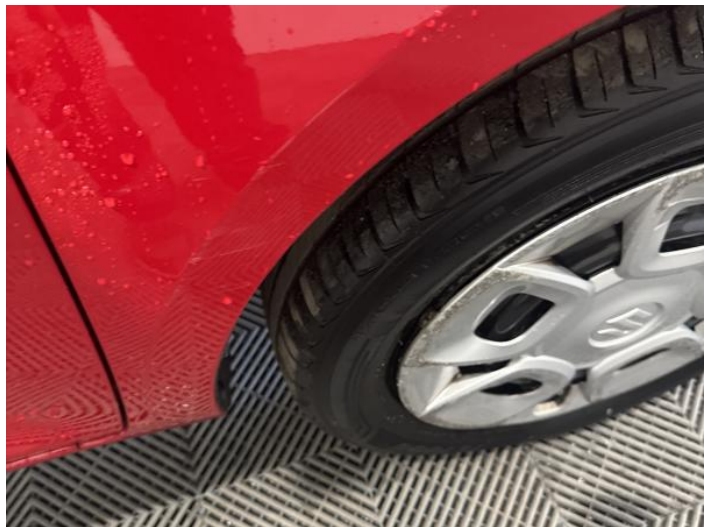
9: Door osf Scratched Over 25mm Not Thru Paint