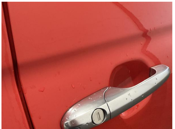
8: Door osf Scratched Up To 25mm Thru Paint