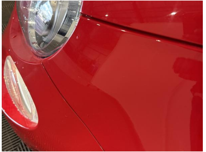
4: Wing nsf Chipped 1 To 5