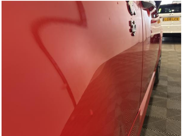
6: Qtr Panel osr Dented Over 30mm