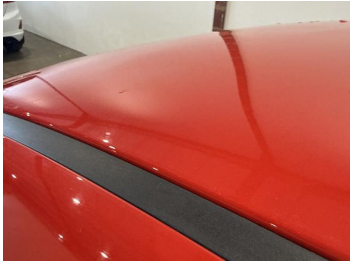
9: Wing osf Chipped 1 To 5