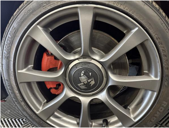
3: Wheel nsf Scratched Up To 50mm