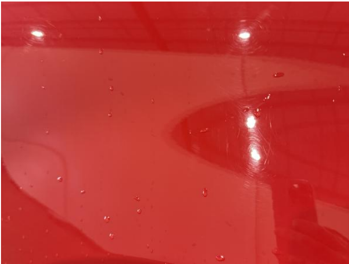
5: Qtr Panel nsr Chipped 1 To 5