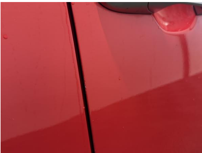
7: Door osf Chipped Edge Chip