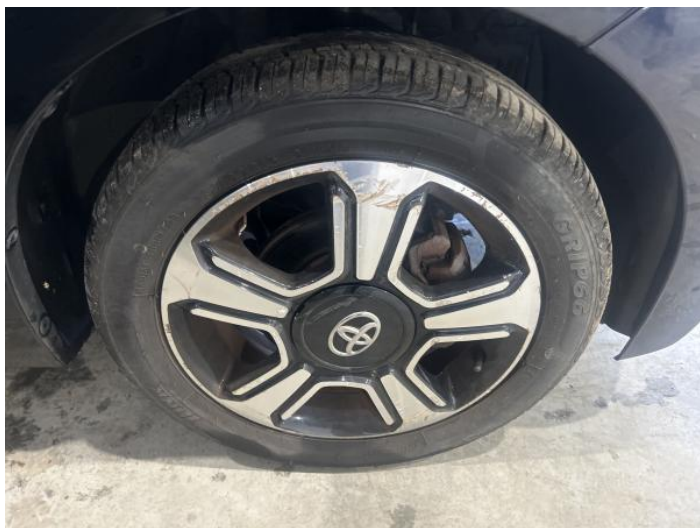
1: Wheel osf Scratched Over 50mm