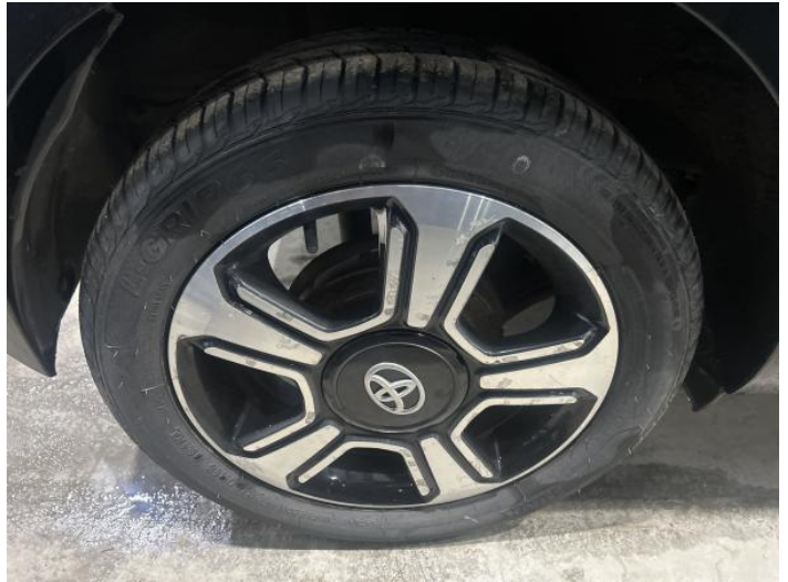
4: Wheel osr Scratched Over 50mm