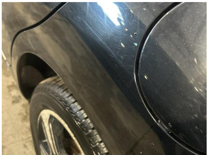
8: Qtr Panel nsr Scratched Over 25mm Not Thru Paint