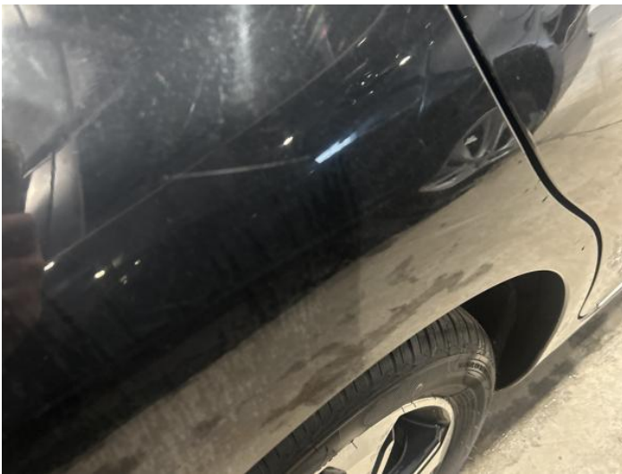
5: Qtr Panel osr Scratched Over 25mm Not Thru Paint