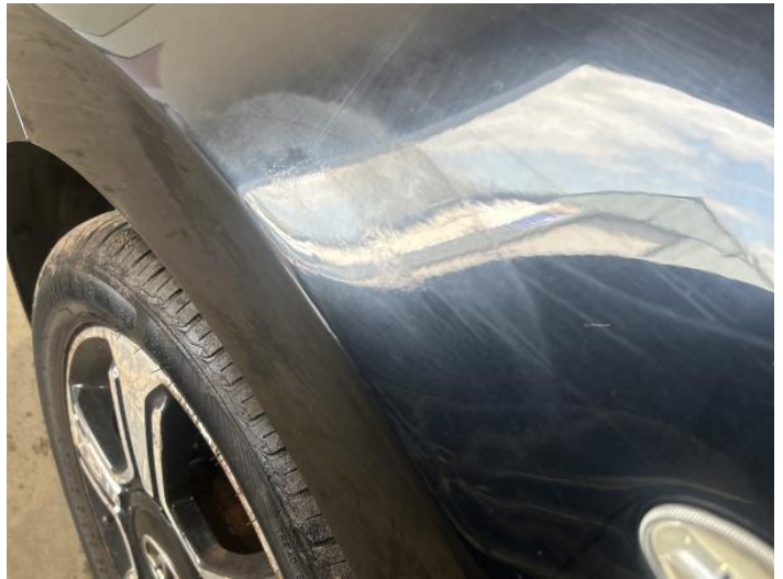
12: Wing nsf Poor Previous Repair Poor Paint