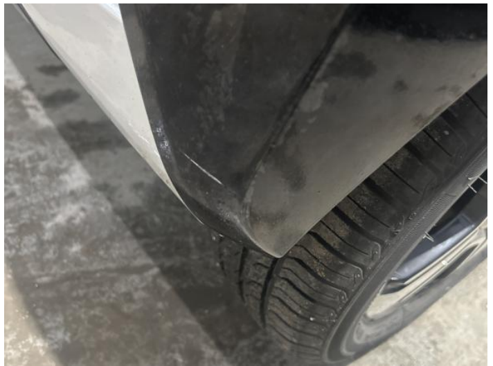
6: Bumper Rear Scratched Up To 25mm Thru Paint