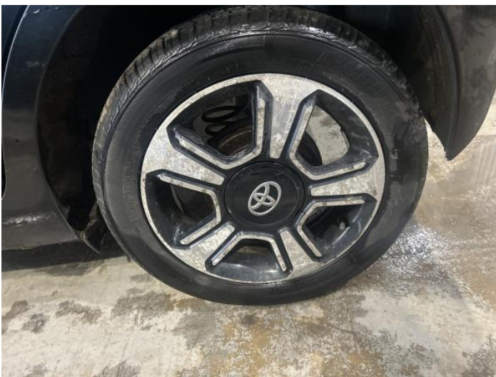
7: Wheel nsr Corroded Light