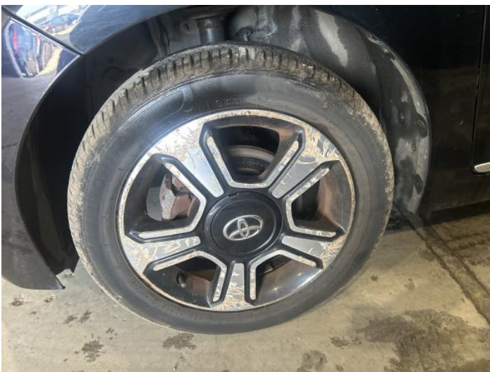
13: Wheel nsf Scratched Over 50mm