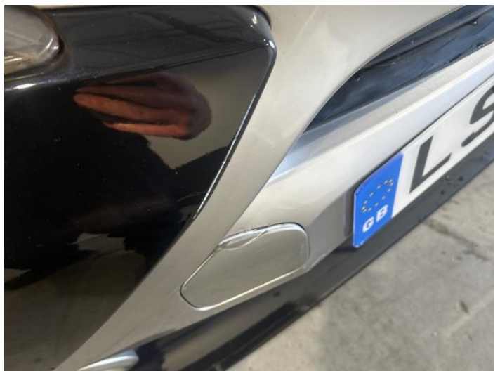
14: Bumper Front Scratched 25 to 100mm Thru Paint