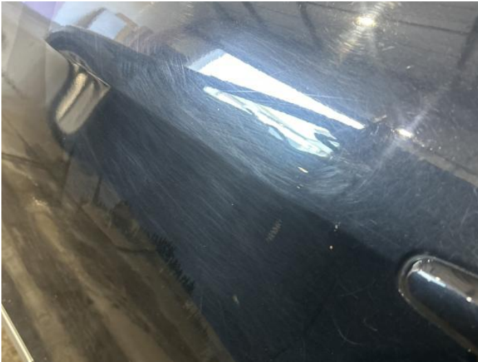
9: Door nsr Scratched Over 25mm Not Thru Paint