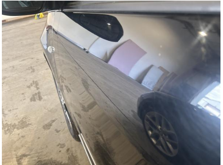
10: Door nsf Dented Over 2 UpTo 10mm