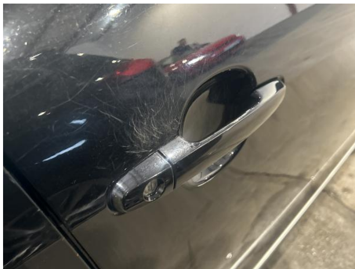
2: Door osf Scratched Over 25mm Not Thru Paint