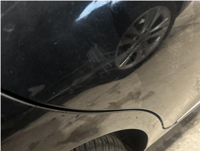
3: Door osr Scratched Over 25mm Thru Paint