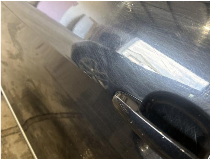
11: Door nsf Scratched Over 25mm Not Thru Paint