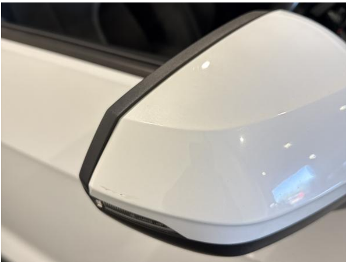
5: Door Mirror Assy osf Scratched (Painted) UpTo 25mm Thru Paint