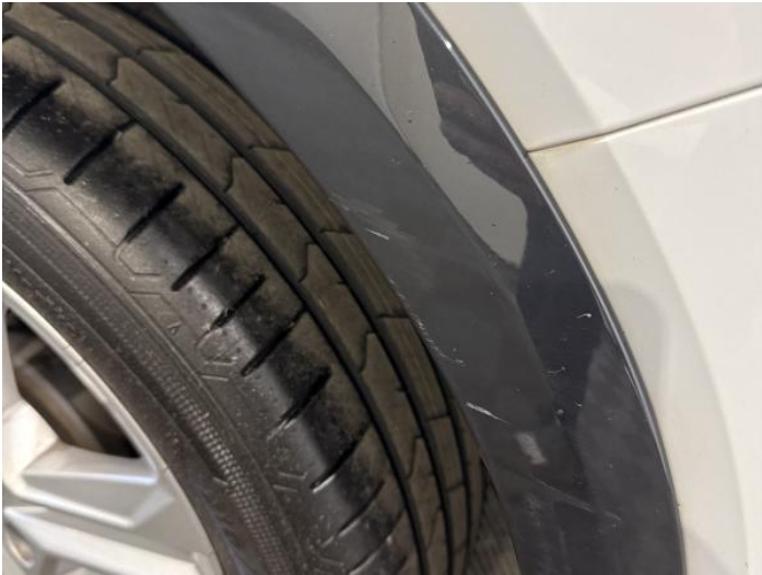
3: Qtr Panel Arch Extension ns Scratched (Painted) Over 25mm Thru Paint