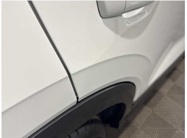
4: Door osr Chipped Edge Chip