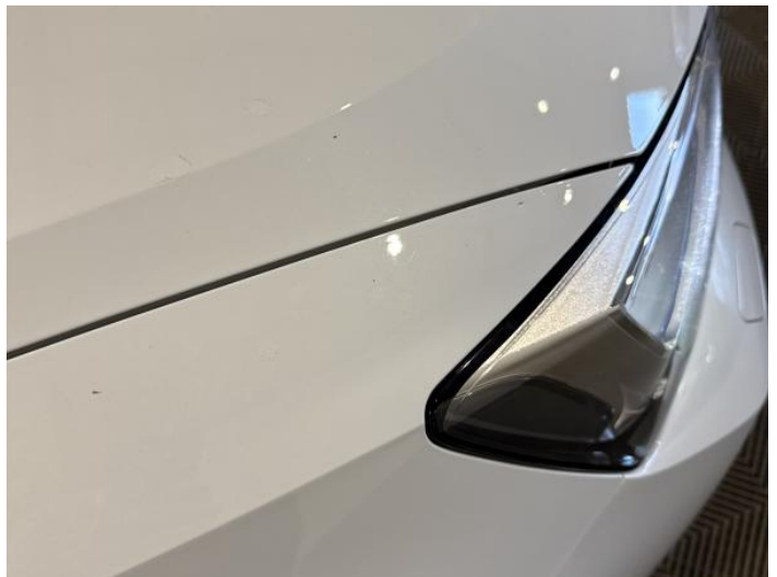
6: Wing osf Chipped 1 To 5