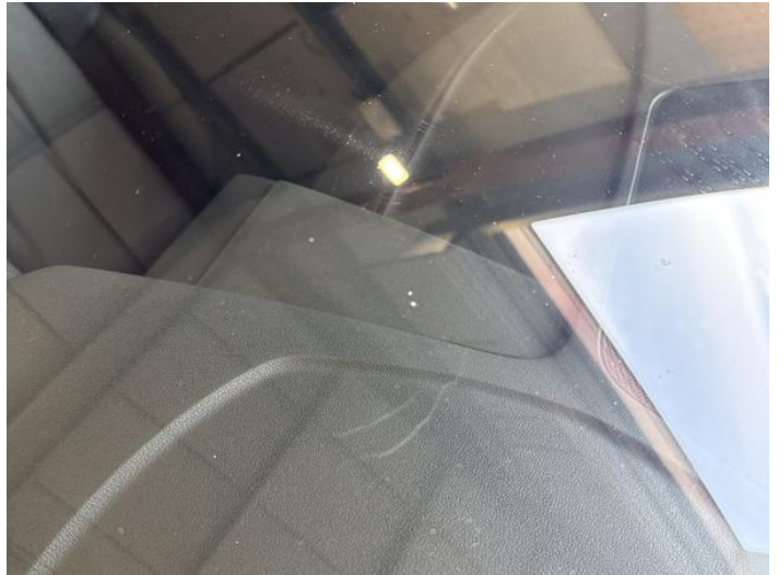
10: Screen Front Chipped UpTo 10mm