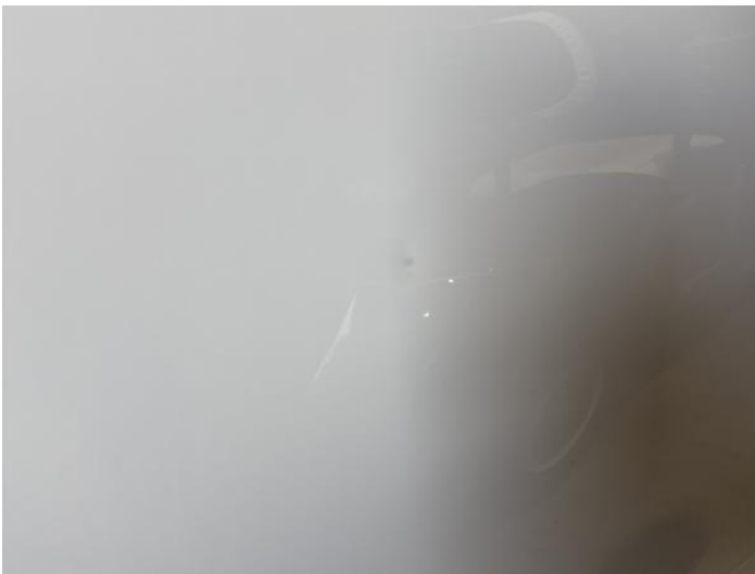
5: Door nsr Dented Between 10mm + 30mm