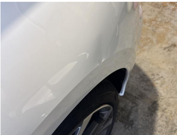
7: Qtr Panel nsr Dented Over 30mm