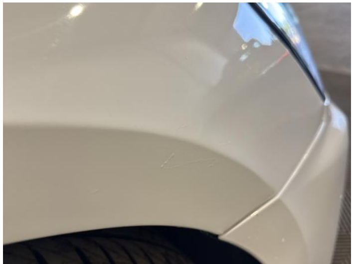
12: Wing osf Dented Between 10mm + 30mm