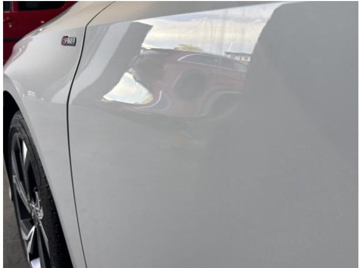
4: Door nsf Dented Between 10mm + 30mm