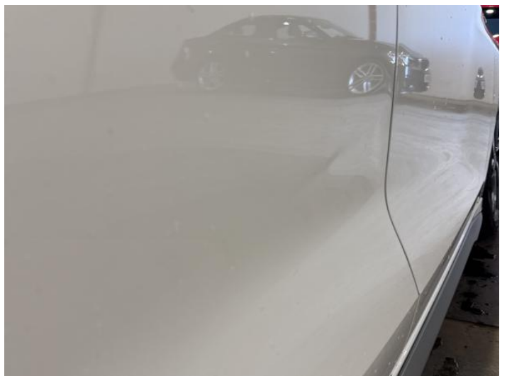
8: Door osr Dented Over 30mm