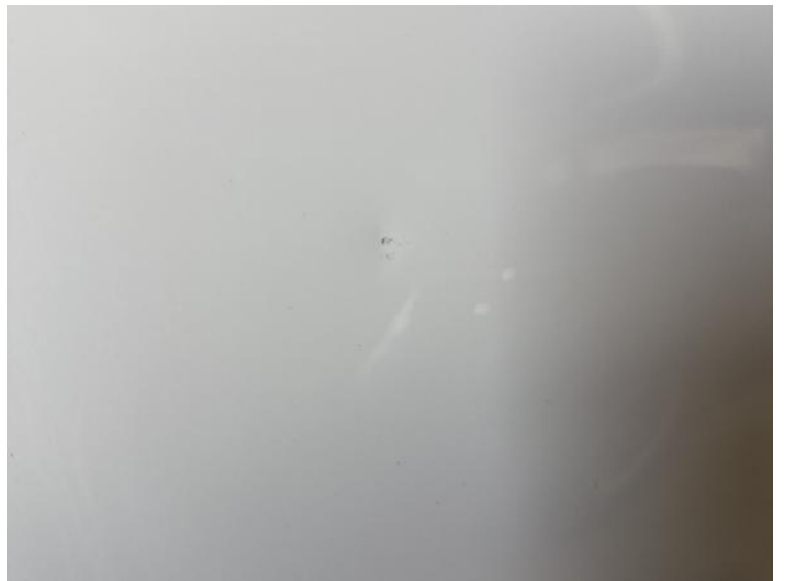
6: Door nsr Chipped 1 To 5