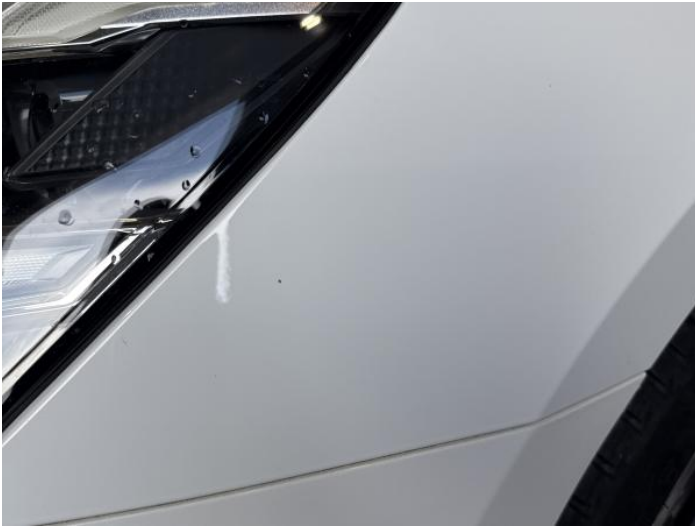
3: Wing nsf Chipped 1 To 5