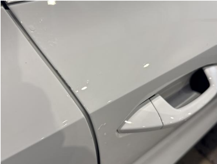
9: Door osf Chipped Edge Chip