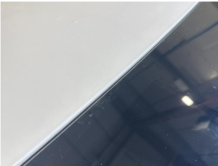
11: Roof Chipped Edge Chip