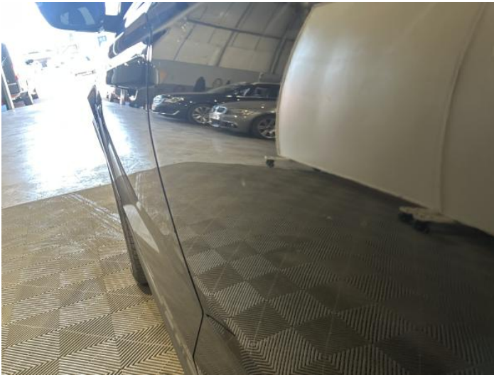
11: Door nsr Dented 2 Or Less UpTo 10mm