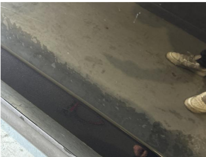
7: Door nsf Chipped 1 To 5