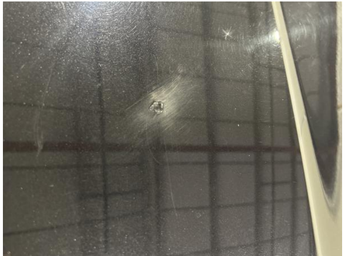
12: Bonnet Chipped 1 To 5