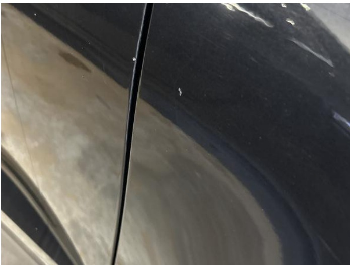
1: Wing osf Chipped 1 To 5