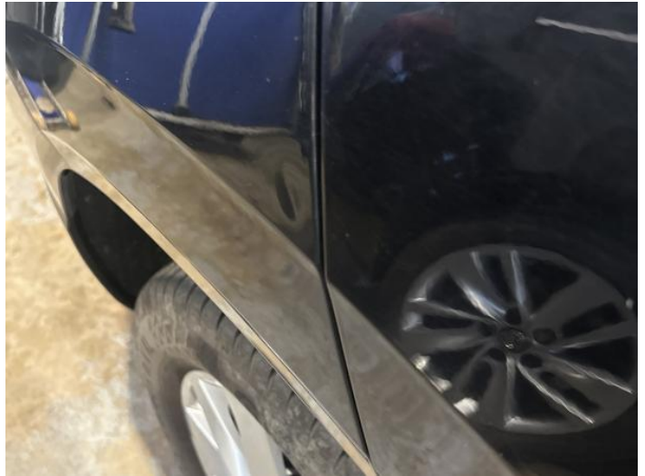
10: Qtr Panel osr Dented Between 10mm + 30mm