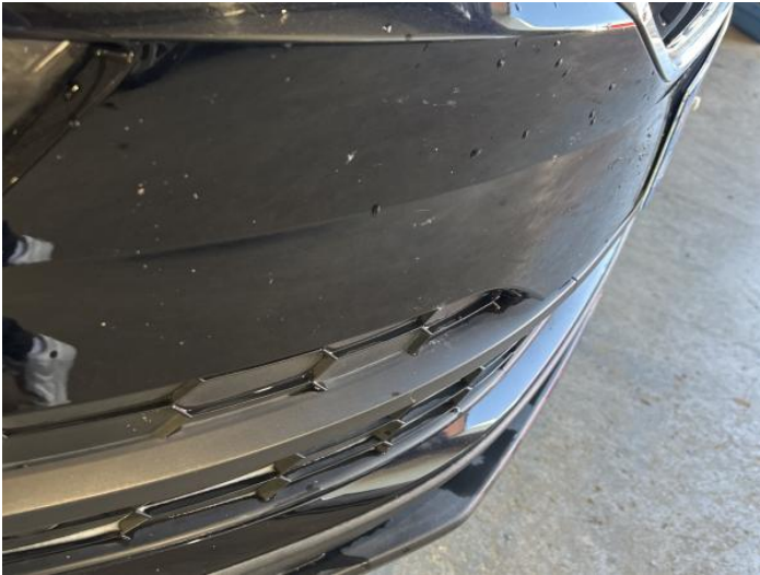
9: Bumper Front Chipped Multiple Chips