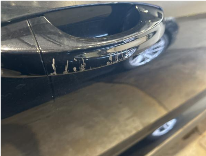
3: Other N/A N/A