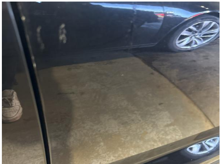
2: Door osf Scratched UpTo 25mm Thru Paint