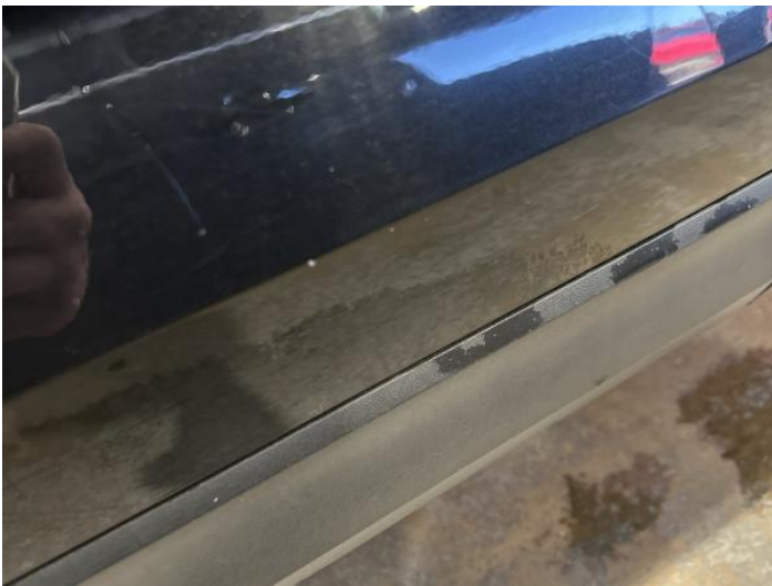
5: Door osr Chipped 1 To 5