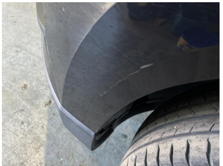
8: Bumper Front Scratched 25 to 100mm Thru Paint