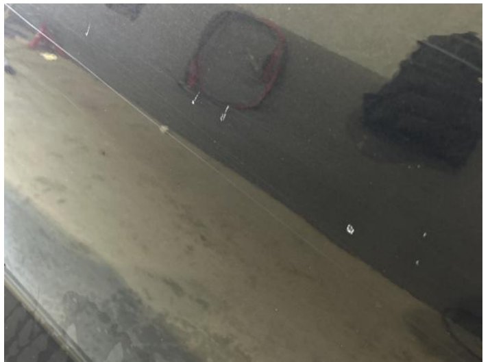
6: Door nsr Chipped 1 To 5