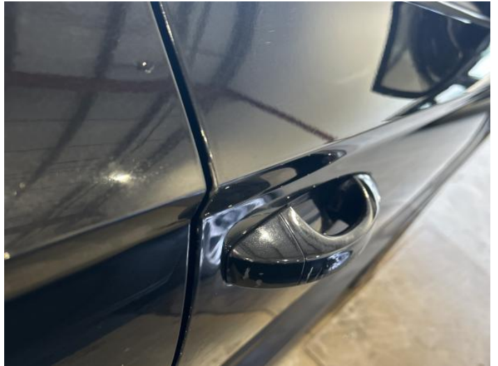
4: Door osf Chipped Edge Chip