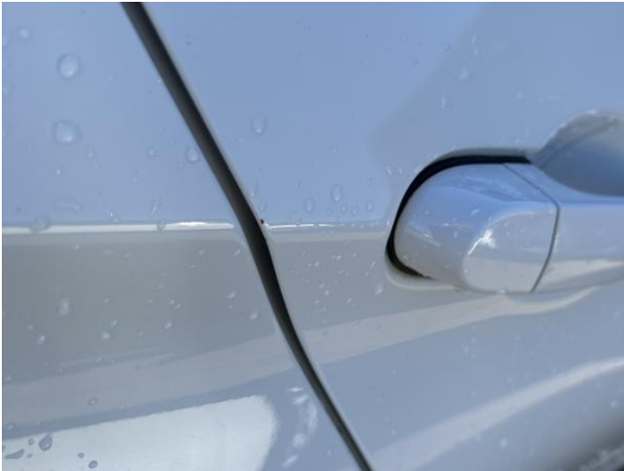
3: Door osr Chipped Edge Chip