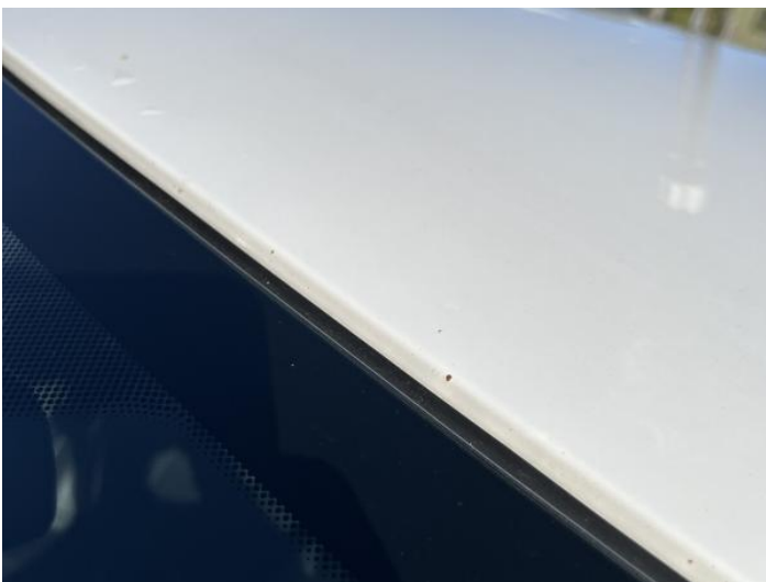
7: Roof Chipped 1 To 5