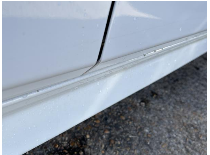
2: Door osf Chipped Edge Chip