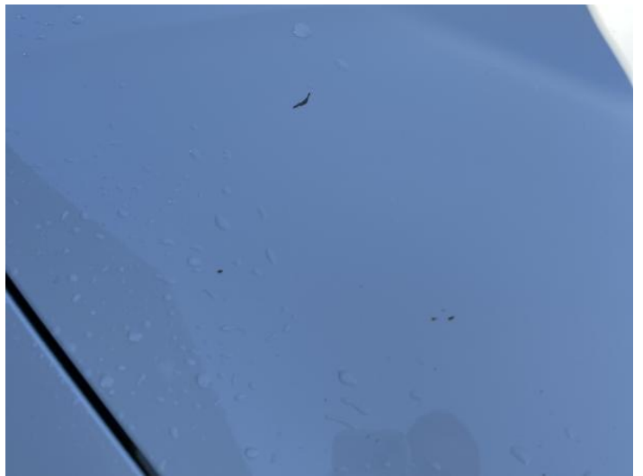
6: Bonnet Chipped Multiple Chips