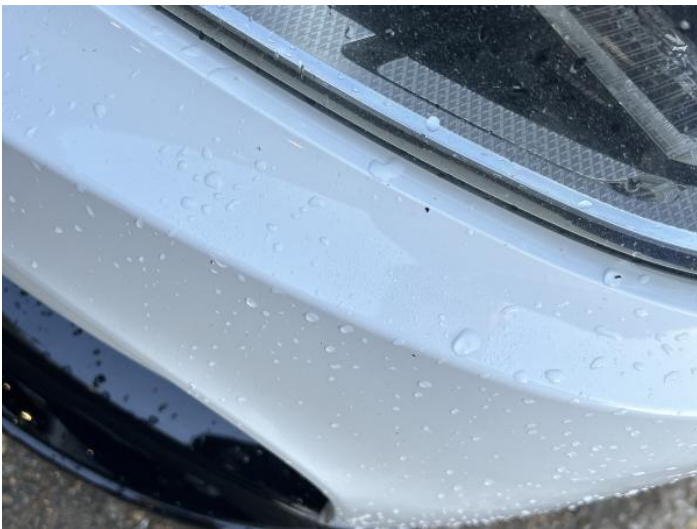
5: Bumper Front Chipped Multiple Chips