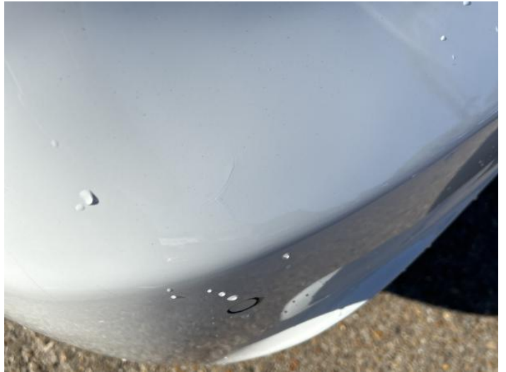
4: Bumper Rear Poor Previous Repair Poor Paint