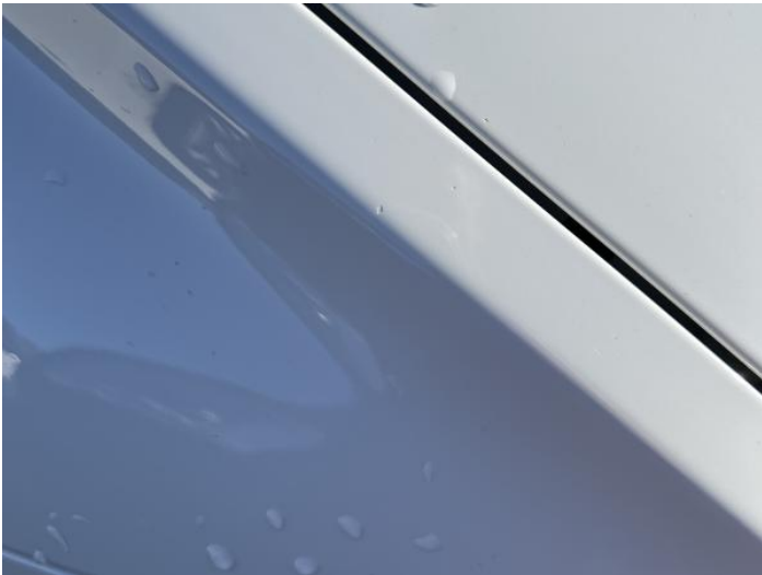
1: Wing osf Chipped 1 To 5