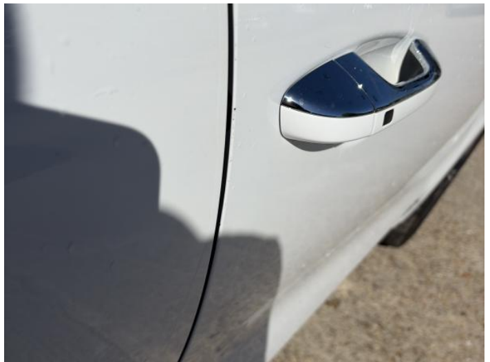
2: Door osf Chipped Edge Chip