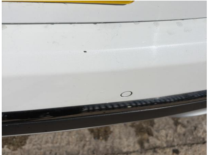
4: Bumper Rear Chipped 1 To 5