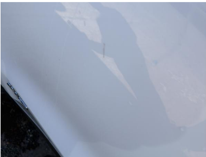
7: Door nsf Scratched UpTo 25mm Thru Paint