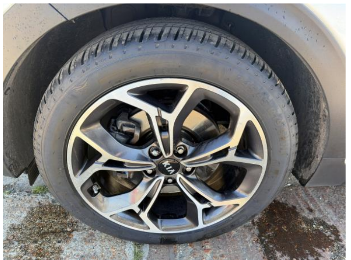
8: Wheel nsf Corroded Light