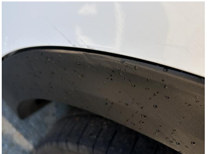
6: Door nsr Chipped 1 To 5