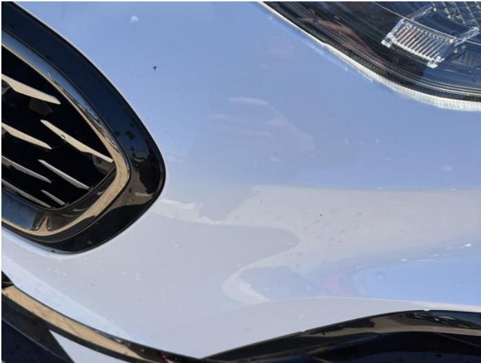
9: Bumper Front Chipped Multiple Chips