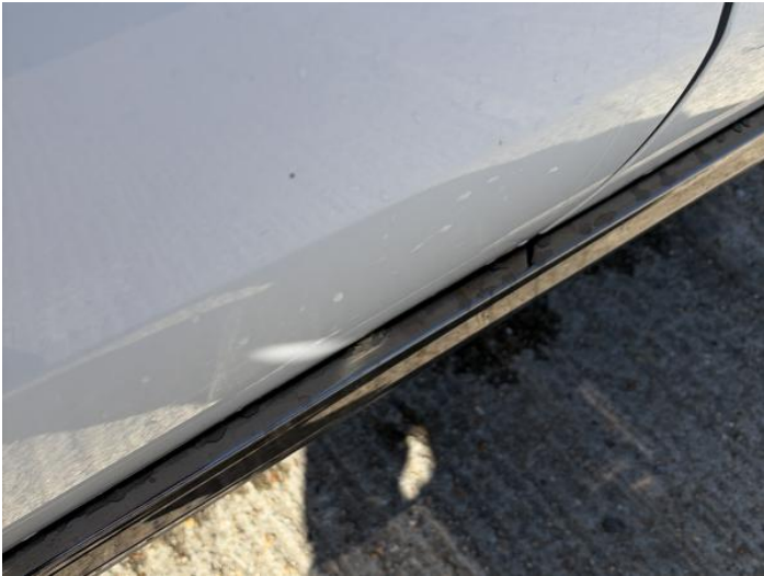
3: Door osr Chipped 1 To 5