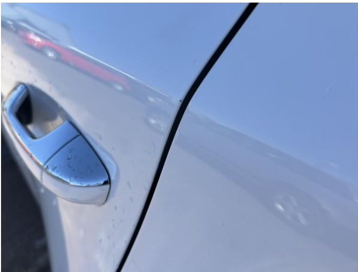
5: Door nsr Chipped Edge Chip