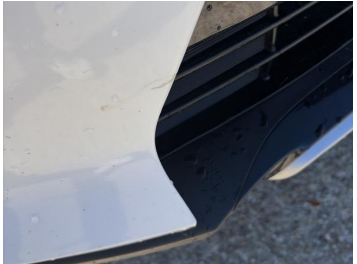
10: Bumper Front Scratched UpTo 25mm Thru Paint