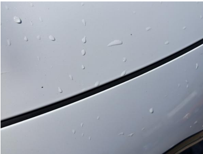
11: Bonnet Chipped 1 To 5