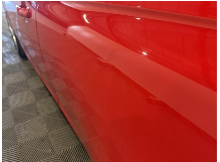
6: Qtr Panel nsr Dented With Paint Damage