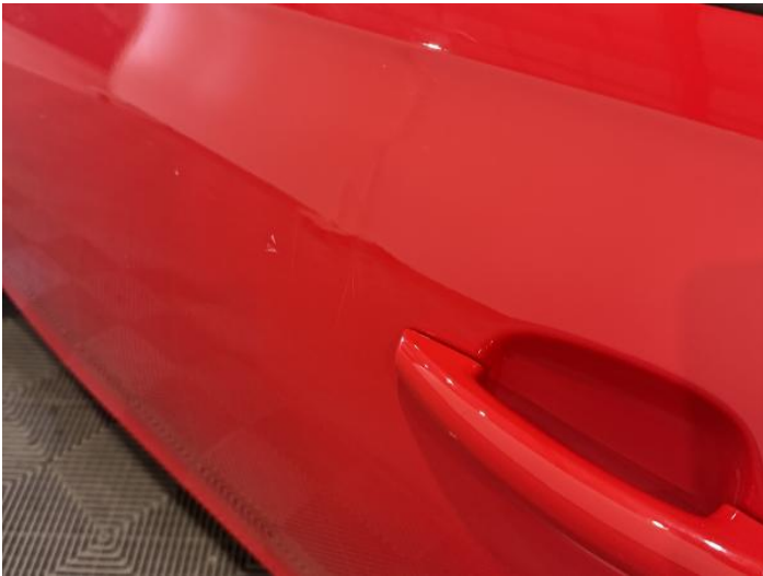
5: Door nsf Dented With Paint Damage