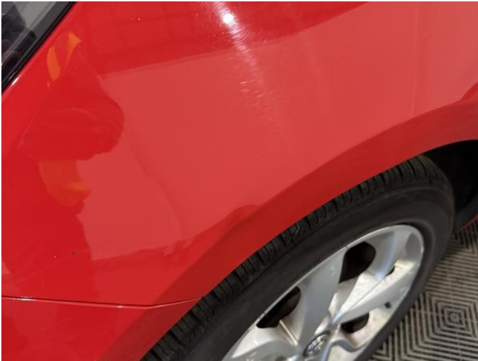
3: Wing nsf Dented Over 30mm