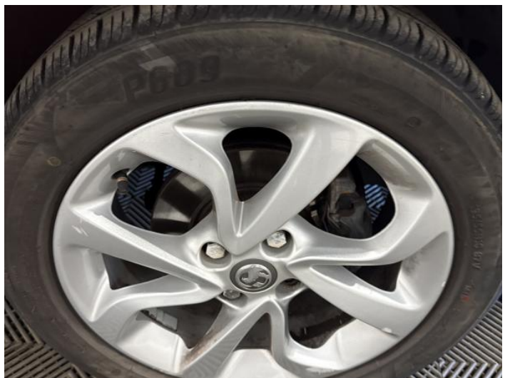
14: Wheel osf Scratched Over 50mm