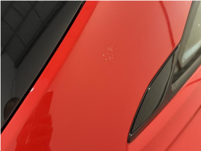
9: Qtr Panel osf Scratched Over 25mm Thru Paint