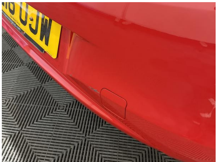
8: Bumper Rear Scratched 25 to 100mm Thru Paint