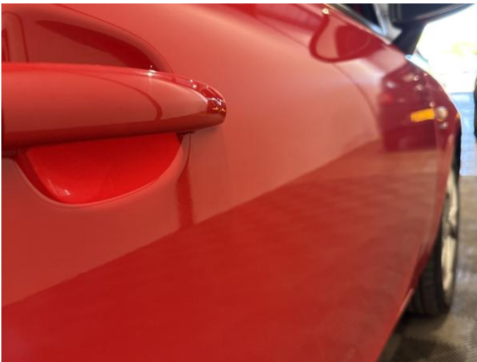
11: Door osf Dented Over 30mm