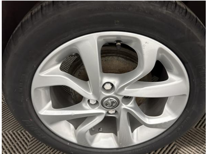
10: Wheel osf Scratched Up To 50mm