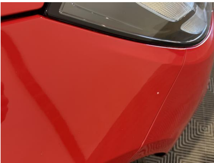
13: Wing osf Chipped 1 To 5