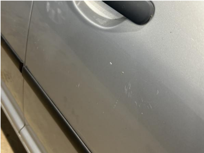
3: Door osf Chipped Multiple Chips