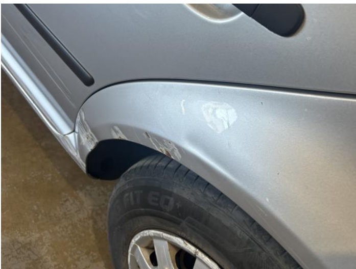
7: Qtr Panel nsr Dented With Paint Damage