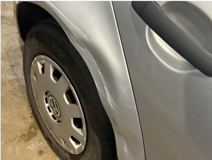
5: Qtr Panel osr Dented With Paint Damage