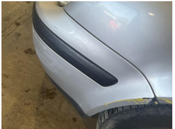
12: Bumper Front Scratched Over 100mm Thru Paint