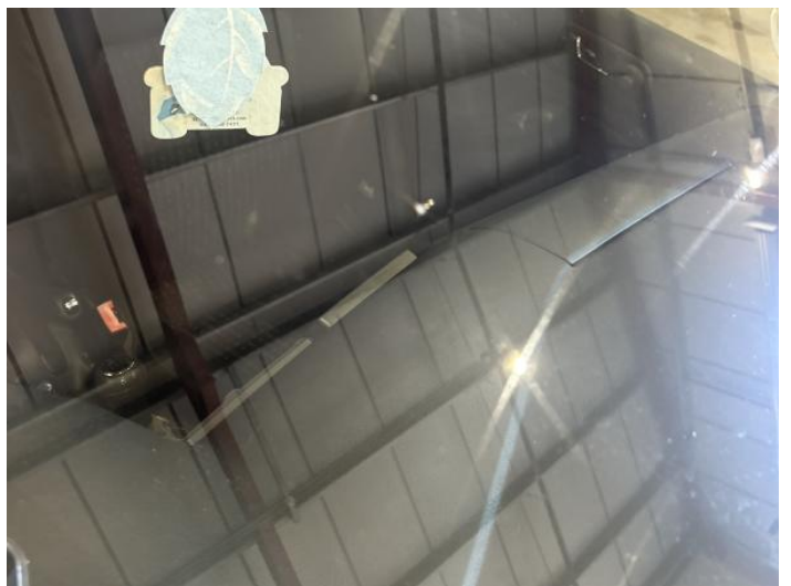
14: Screen Front Chipped UpTo 10mm