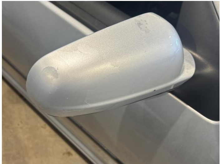
2: Door Mirror Assy osf Scratched (Painted) Over 25mm Thru Paint