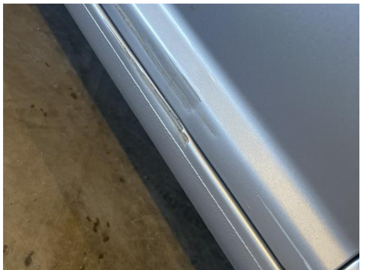
8: Sill ns Dented With Paint Damage