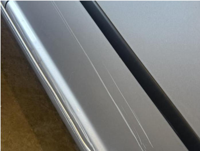
9: Door nsr Dented With Paint Damage