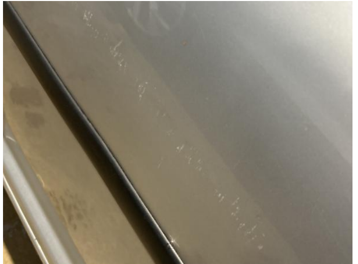
4: Door osr Chipped Multiple Chips