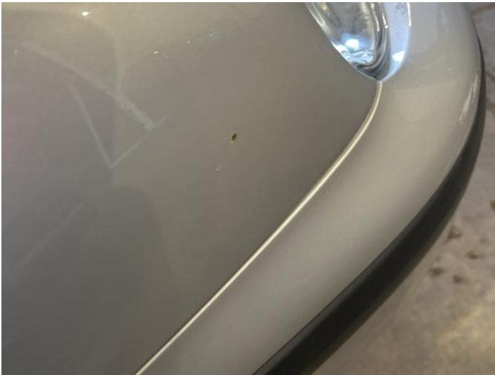
1: Wing osf Chipped 1 To 5