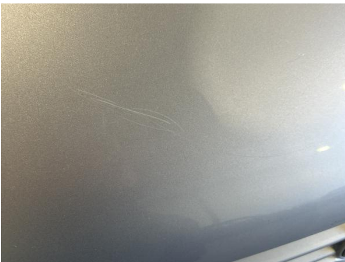
13: Bonnet Scratched Over 25mm Thru Paint