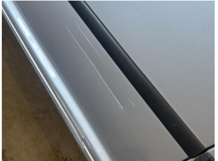
10: Door nsf Dented With Paint Damage