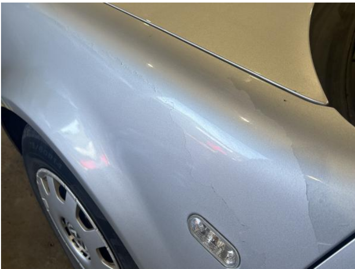
11: Wing nsf Poor Previous Repair Paint Flake