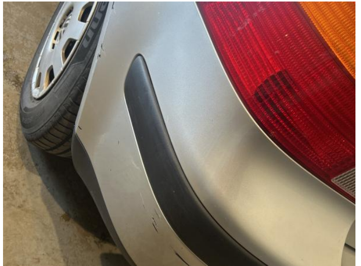
6: Bumper Rear Scratched Over 100mm Thru Paint