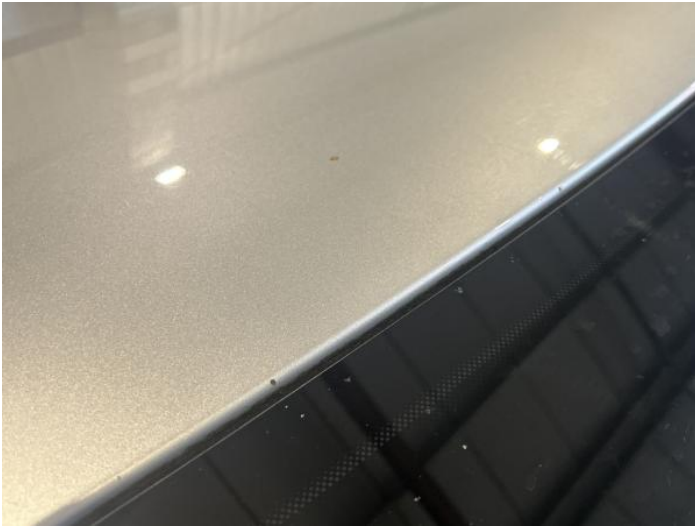
15: Roof Chipped 1 To 5