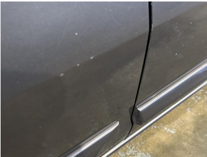
5: Door osr Chipped 1 To 5