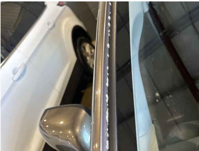
17: A Post os Chipped Edge Chip