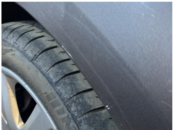
14: Wing nsf Chipped 1 To 5