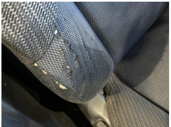
20: Seat Back Cover osf Torn Over 3mm