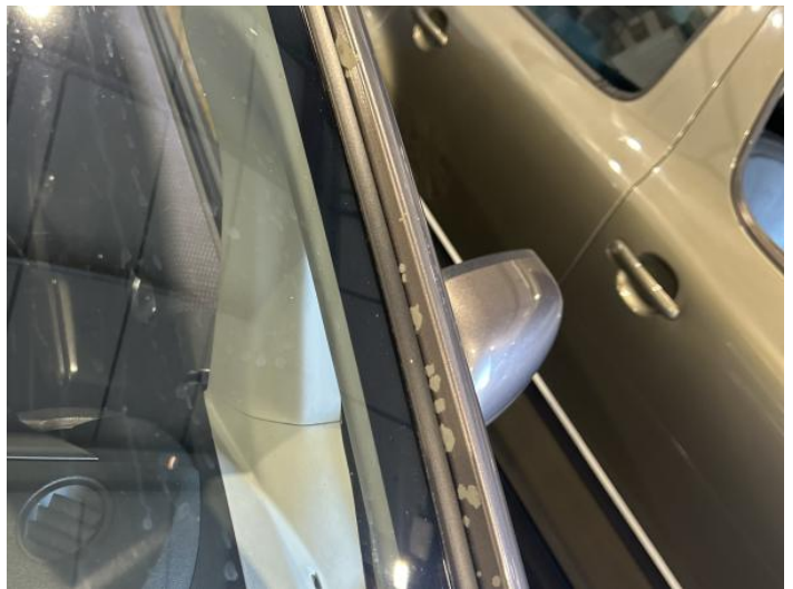
18: A Post ns Chipped Edge Chip