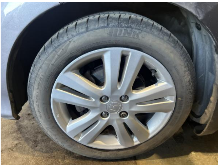
13: Wheel nsf Scratched Over 50mm