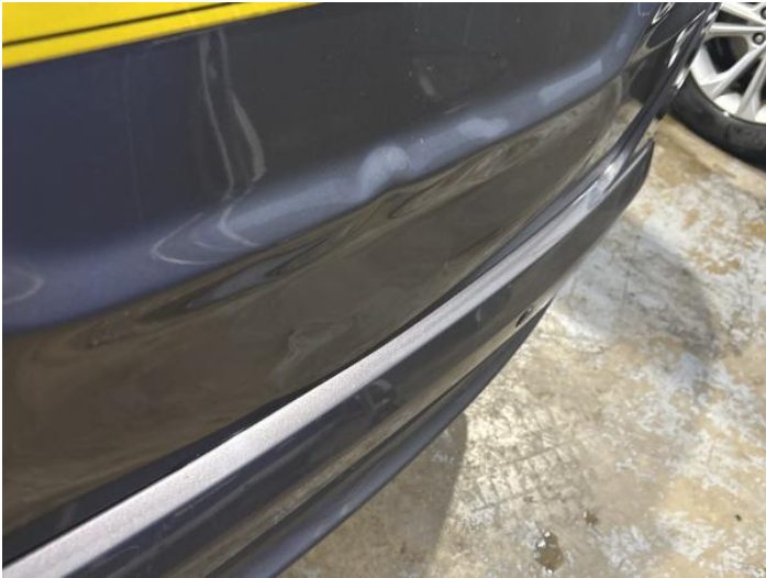
9: Tailgate Dented With Paint Damage