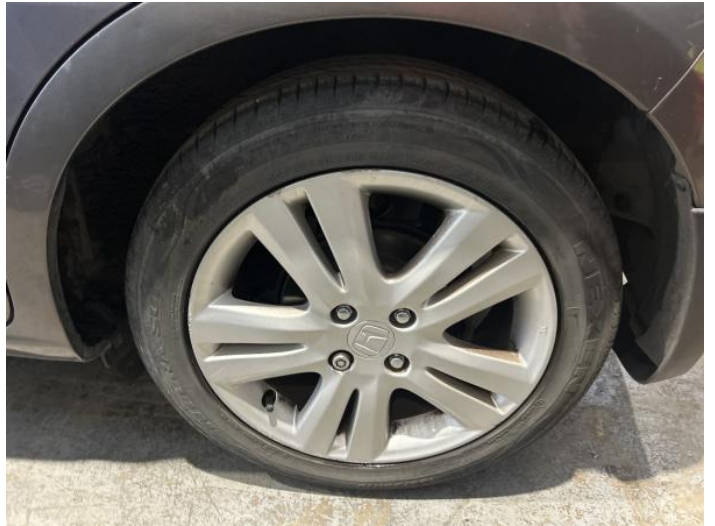
10: Wheel nsr Scratched Over 50mm