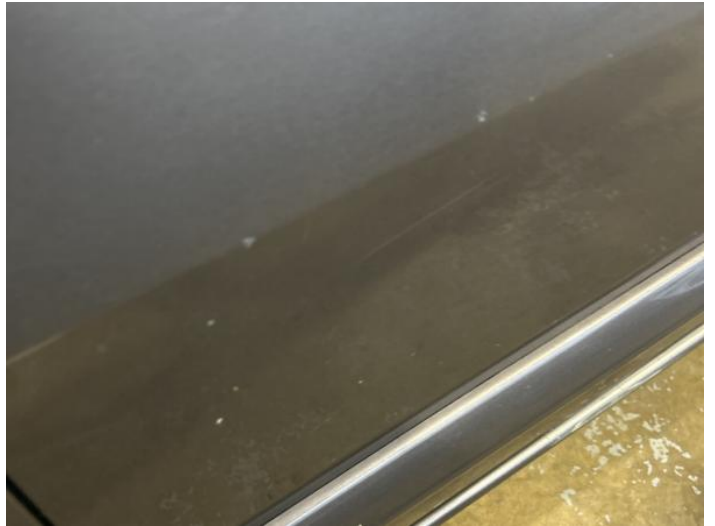
4: Door osf Chipped Multiple Chips