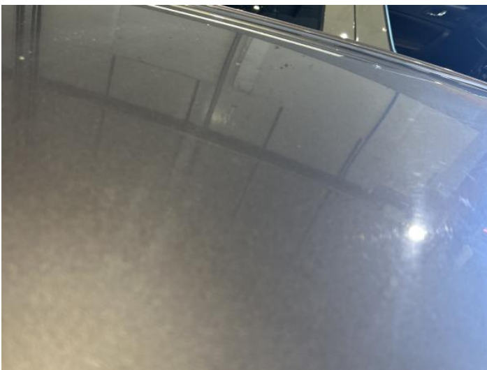
19: Roof Dented Between 10mm + 30mm