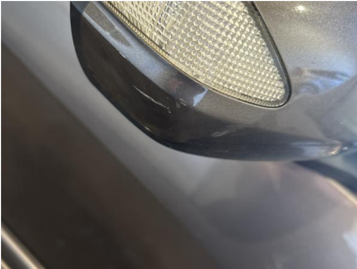
3: Door Mirror Assy osf Scratched (Painted) UpTo 25mm Thru Paint