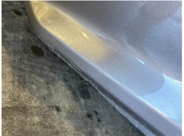
16: Bumper Front Scratched Over 100mm Thru Paint