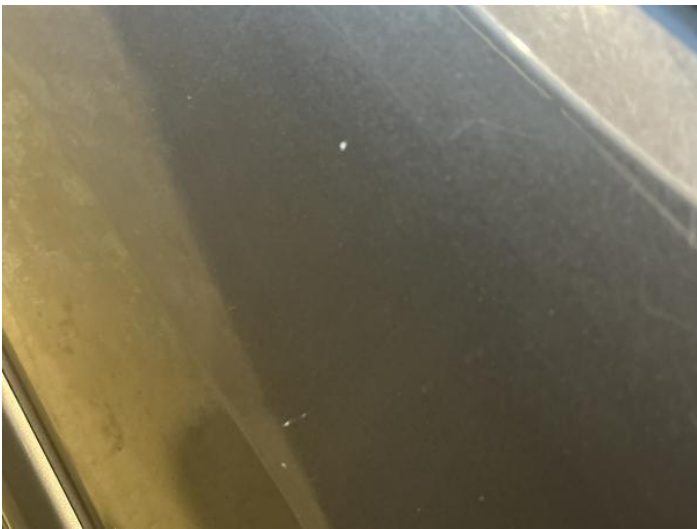
11: Door nsf Chipped 1 To 5