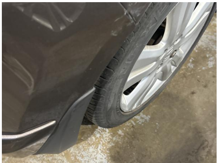
8: Bumper Rear Scratched Over 100mm Thru Paint