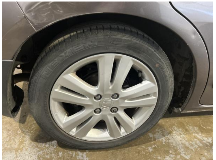
6: Wheel osr Scratched Over 50mm