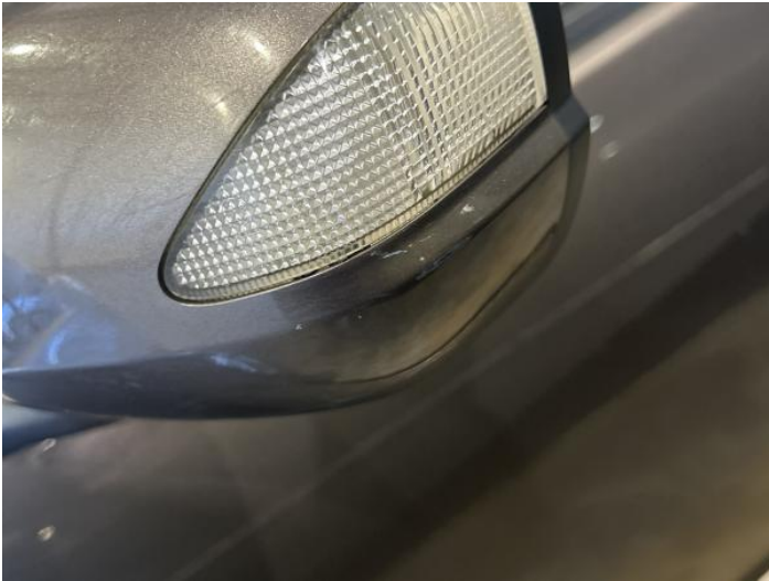
15: Door Mirror Assy nsf Scratched (Painted) UpTo 25mm Thru Paint