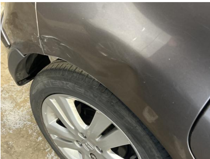
7: Qtr Panel osr Dented With Paint Damage