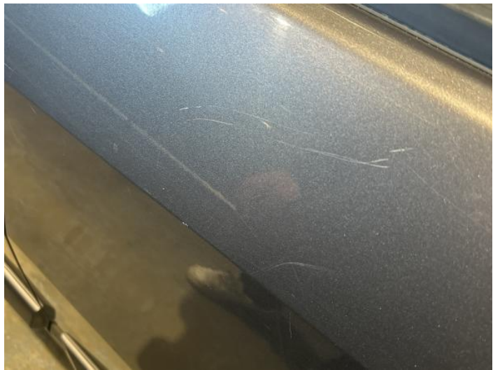
12: Door nsr Scratched Over 25mm Thru Paint