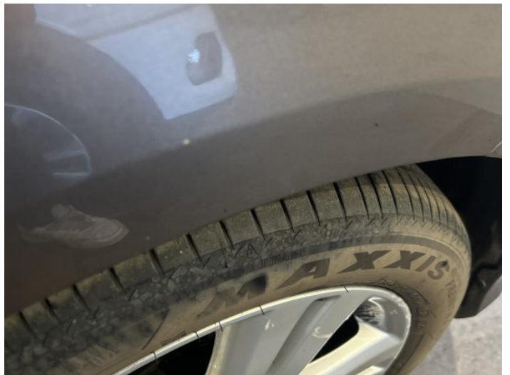
2: Wing osf Chipped 1 To 5