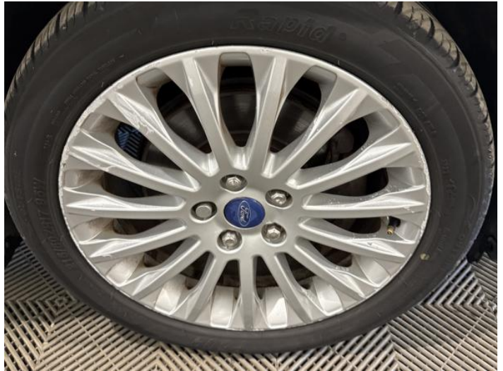
16: Wheel osf Scratched Over 50mm