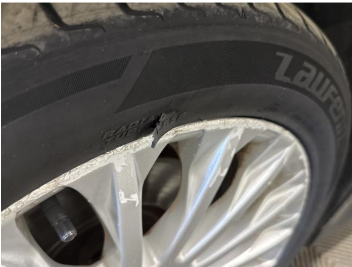
17: Tyre nsf Damaged Replace