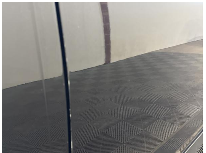
14: Door osf Chipped Edge Chip