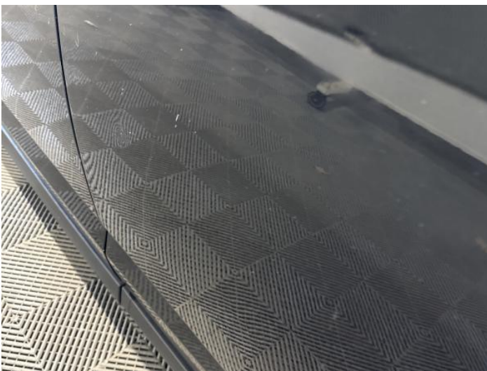
7: Door nsr Scratched Over 25mm Thru Paint