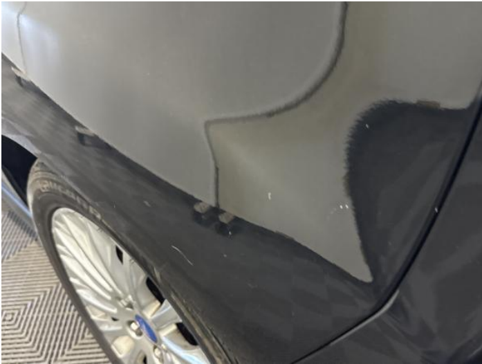
9: Qtr Panel nsr Dented With Paint Damage