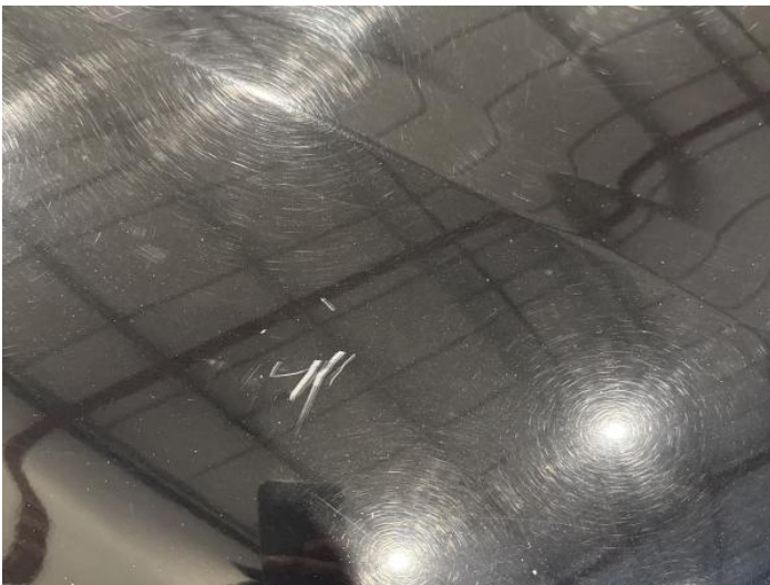
1: Bonnet Scratched Over 25mm Thru Paint