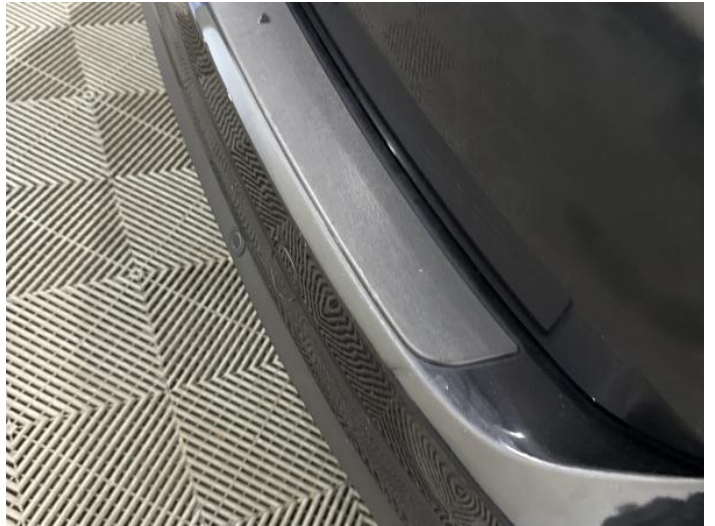
10: Bumper Rear Scratched 25 to 100mm Thru Paint