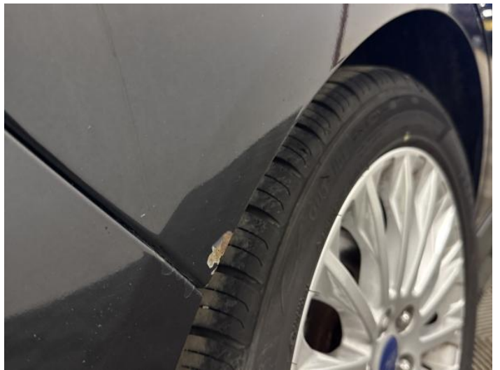
12: Qtr Panel osr Scratched Rusted