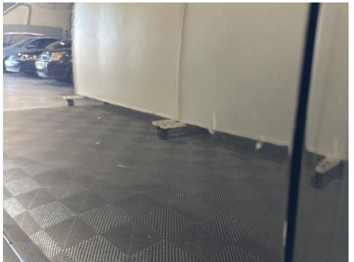
6: Door nsf Scratched Up To 25mm Thru Paint