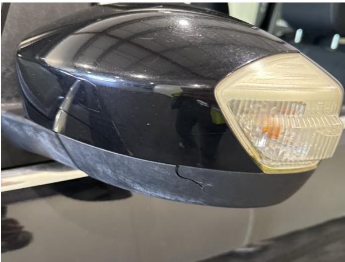
5: Door Mirror Assy nsf Broken Replace