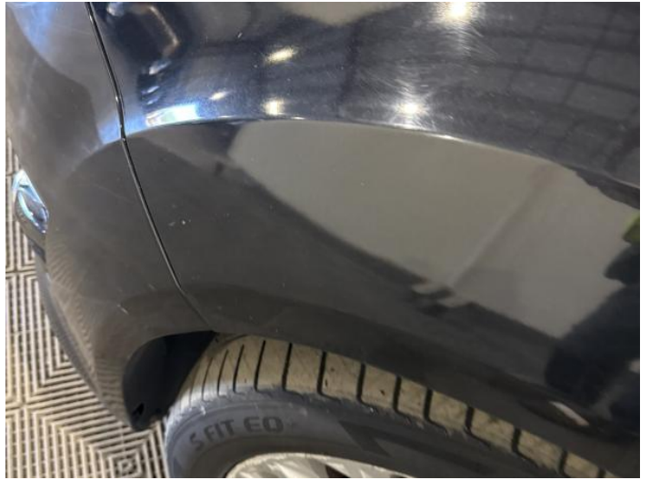
4: Wing nsf Scratched Over 25mm Thru Paint