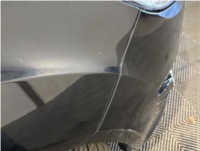
15: Wing osf Chipped 1 To 5