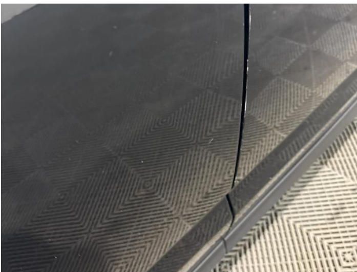
13: Door osr Scratched Up To 25mm Thru Paint