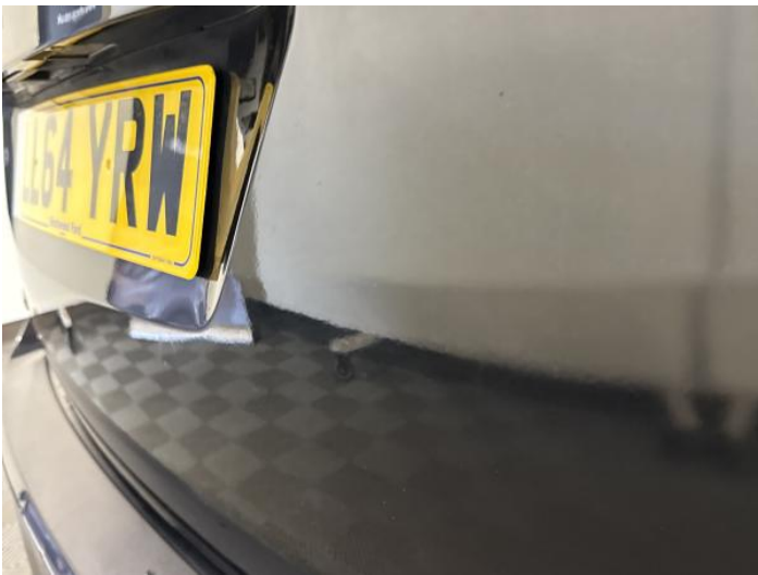
11: Tailgate Poor Previous Repair Poor Paint