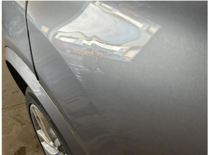
4: Door osr Dented Over 30mm