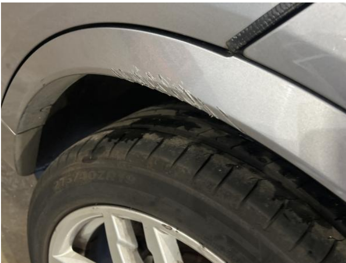
11: Qtr Panel Moulding ns Scratched (Painted) Over 25mm Thru Paint