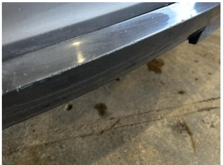
8: Bumper Rear Moulding Scratched (Painted) Over 25mm Thru Paint