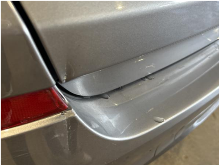
9: Tailgate Dented With Paint Damage