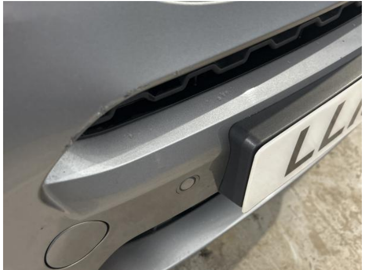
16: Bumper Front Scratched 25 to 100mm Thru Paint