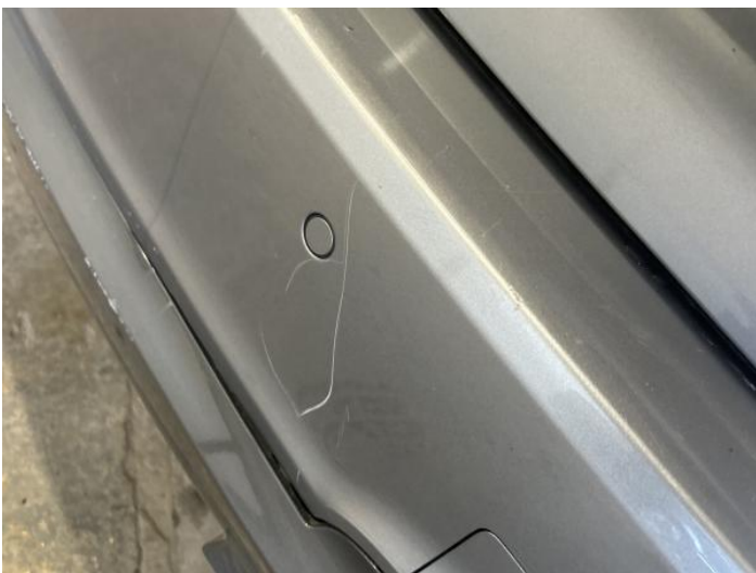
7: Bumper Rear Scratched Over 100mm Thru Paint