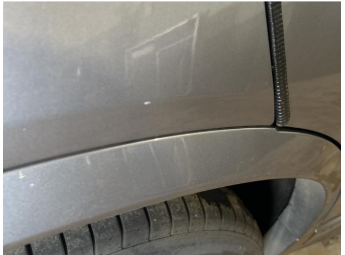
6: Qtr Panel osr Chipped 1 To 5