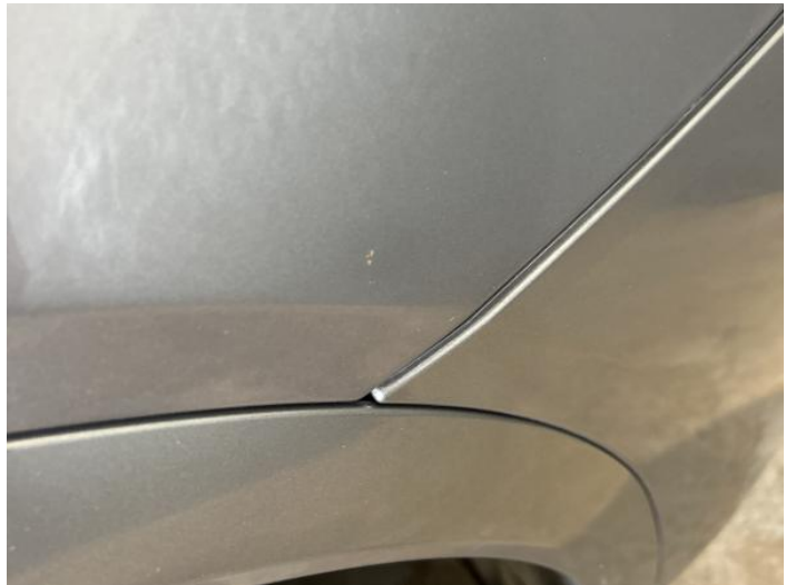
2: Wing osf Chipped 1 To 5