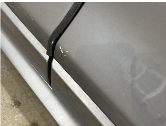
13: Door nsr Chipped 1 To 5