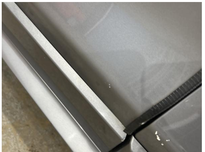
14: Door nsf Chipped 1 To 5