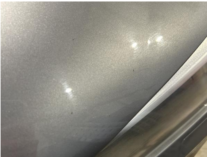
17: Bonnet Chipped 1 To 5