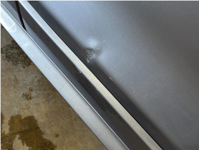
3: Door osf Dented With Paint Damage