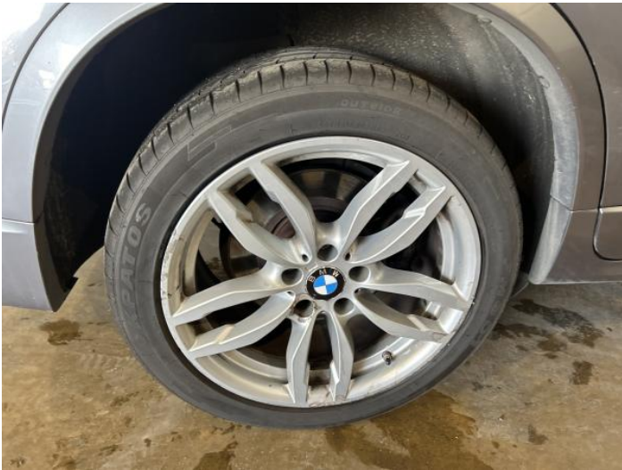
5: Wheel osr Scratched Over 50mm