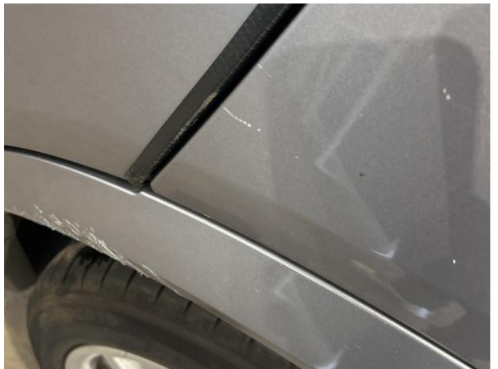
12: Qtr Panel nsr Scratched UpTo 25mm Thru Paint