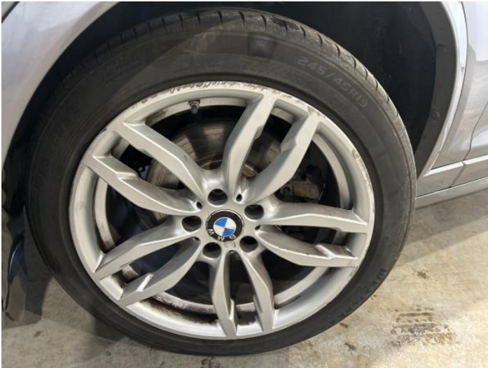
15: Wheel nsf Scratched Over 50mm