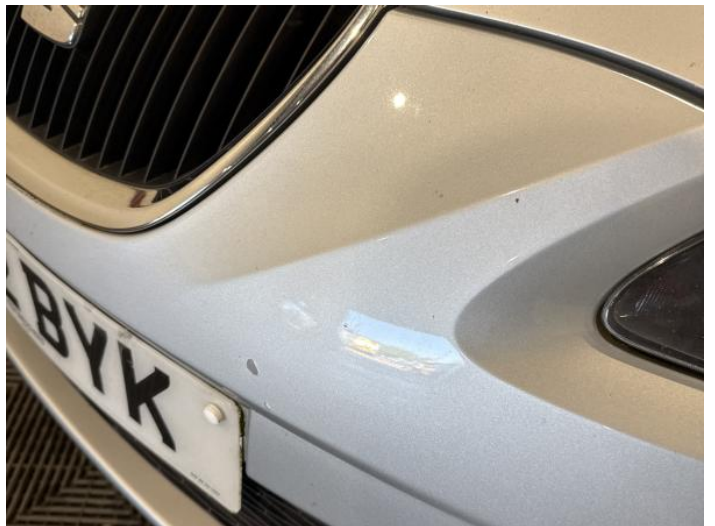
2: Bumper Front Poor Previous Repair Paint Flake