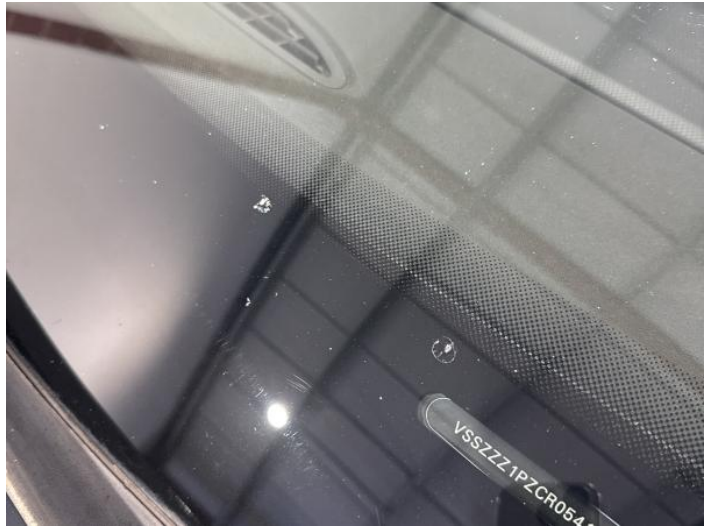
4: Screen Front Cracked Replace