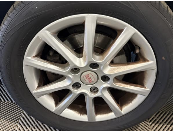
5: Wheel nsf Scratched Over 50mm