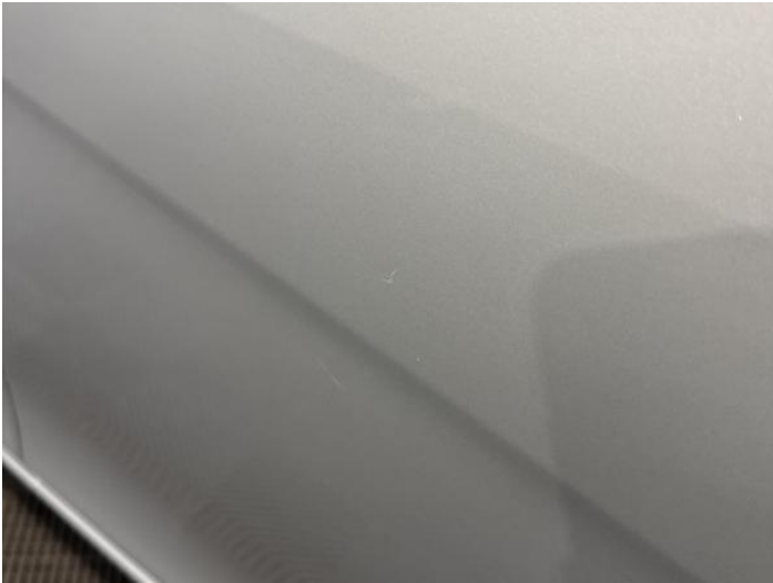
9: Door nsr Scratched UpTo 25mm Thru Paint