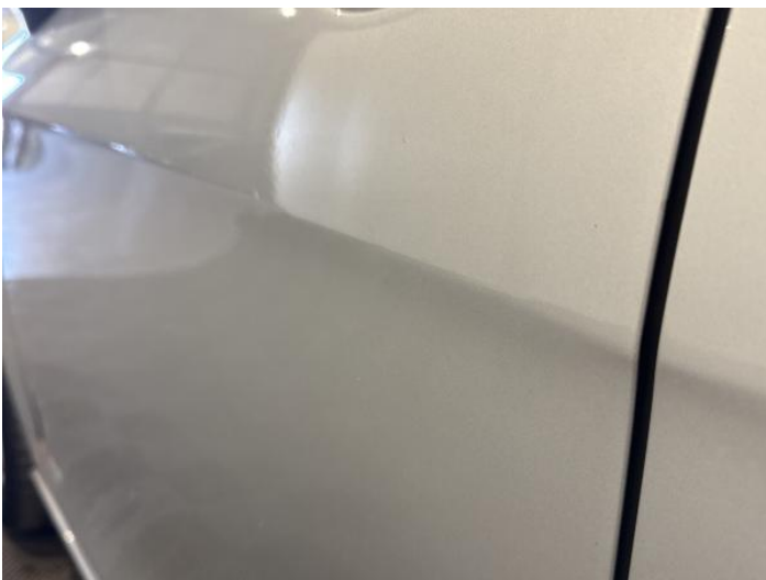
7: Door nsf Chipped 1 To 5