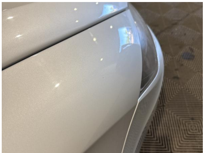
14: Wing osf Chipped 1 To 5