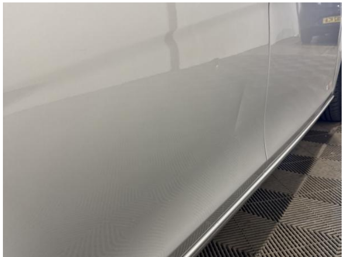
12: Door osr Dented Over 30mm