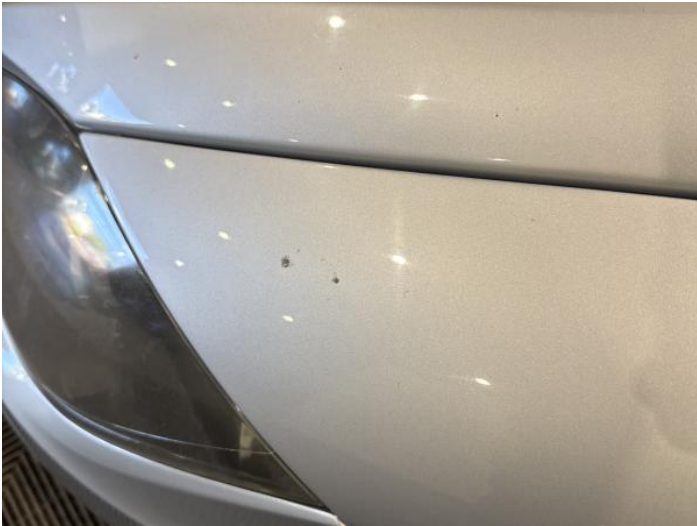
3: Wing nsf Chipped Over 5mm