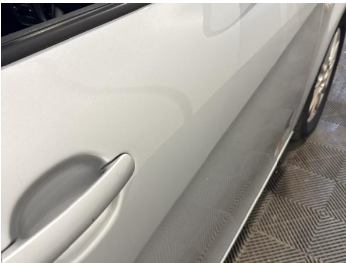
13: Door osf Dented Between 10mm + 30mm