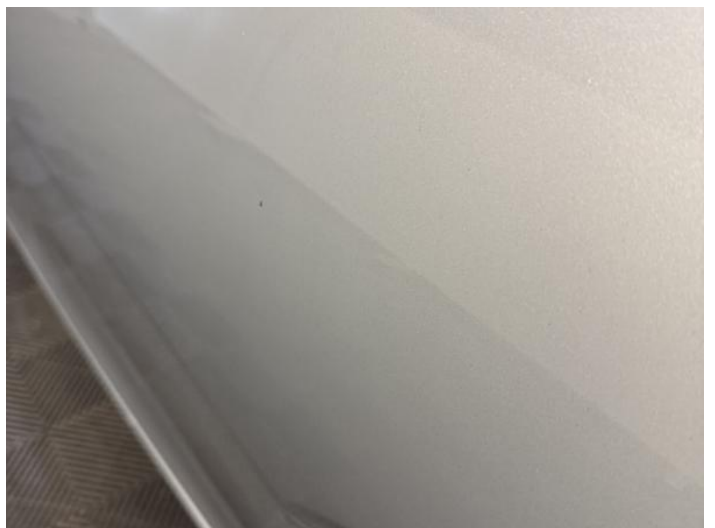
8: Door nsr Dented 2 Or Less UpTo 10mm