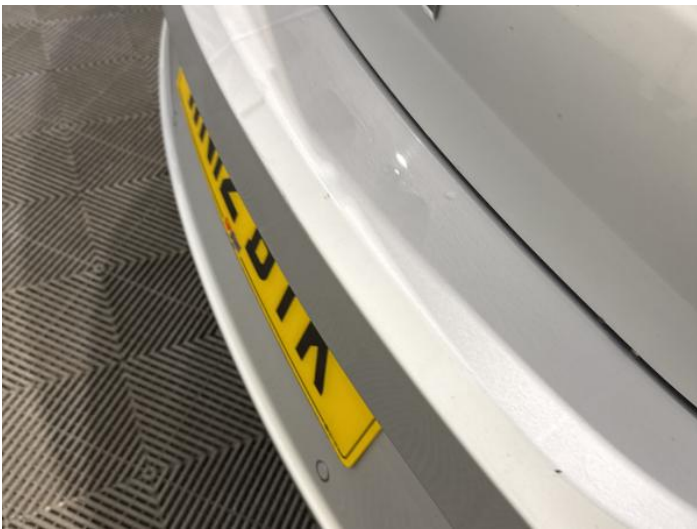
11: Bumper Rear Scratched 25 to 100mm Thru Paint