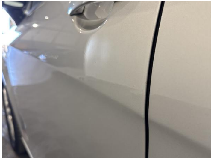
6: Door nsf Dented Over 30mm