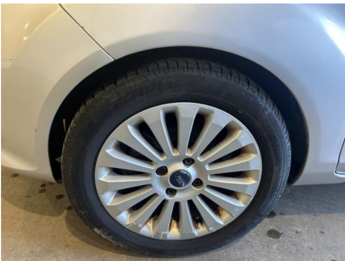
13: Wheel nsf Scratched Over 50mm