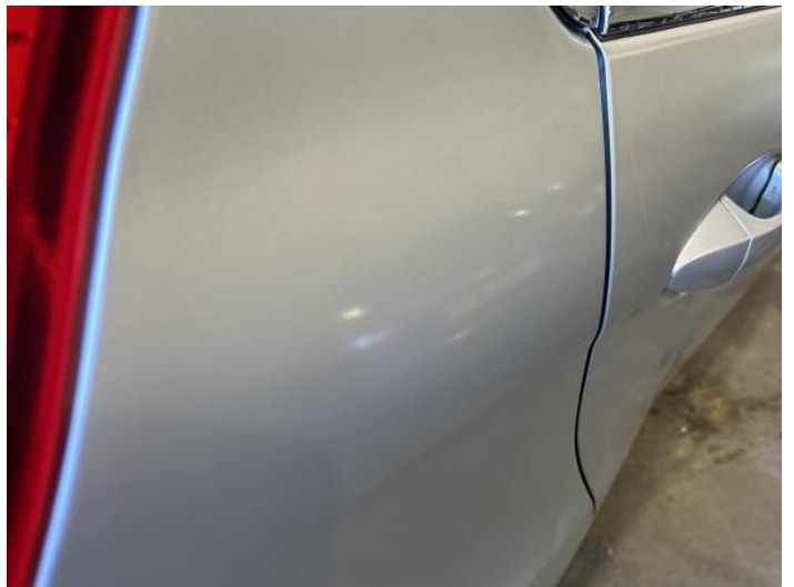
6: Qtr Panel osr Poor Previous Repair Poor Paint