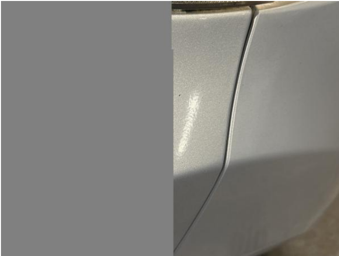
3: Wing osf Chipped 1 To 5