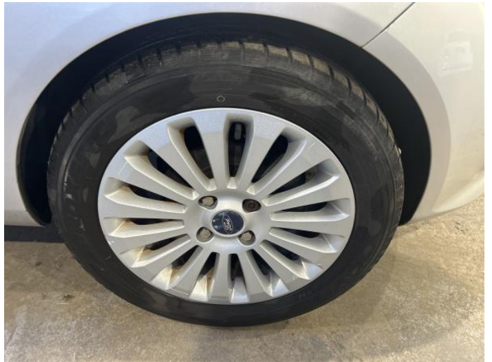
2: Wheel osf Scratched Over 50mm