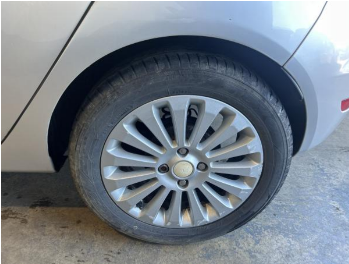
9: Wheel nsr Scratched Over 50mm