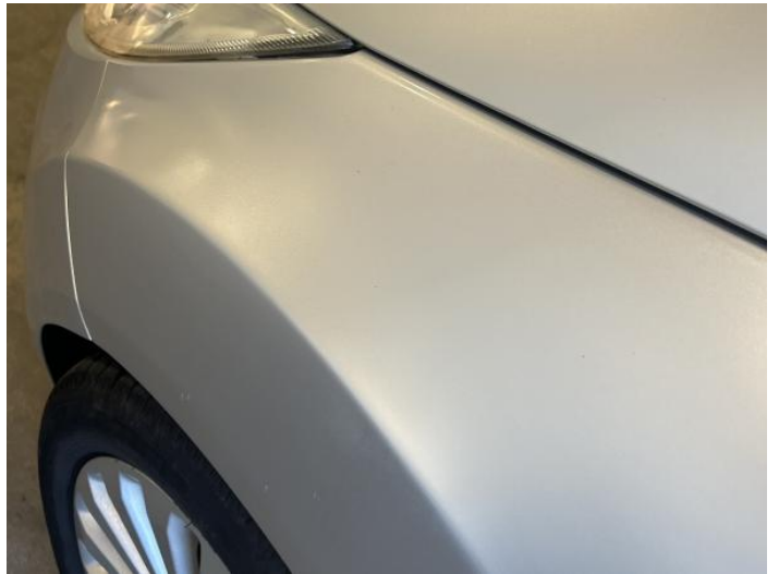
12: Wing nsf Poor Previous Repair Poor Paint