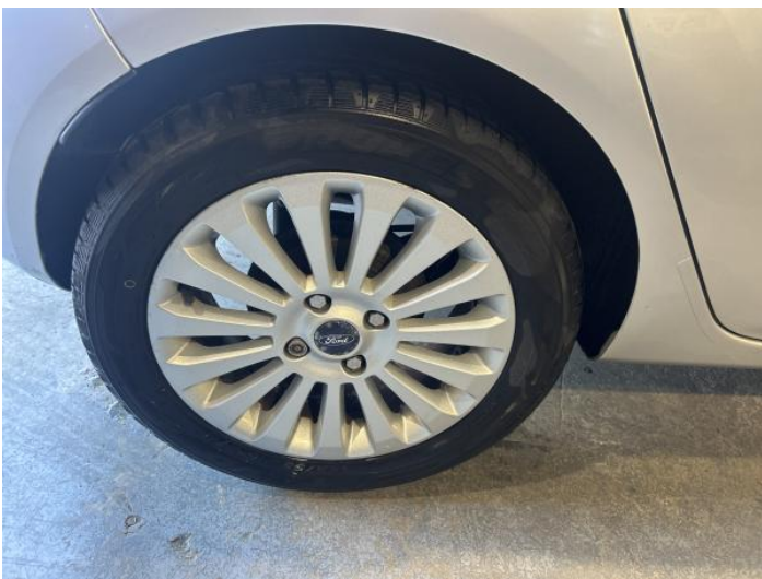
7: Wheel osr Scratched Up To 50mm