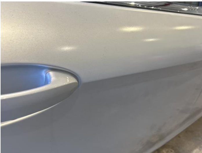
5: Door osr Poor Previous Repair Poor Paint