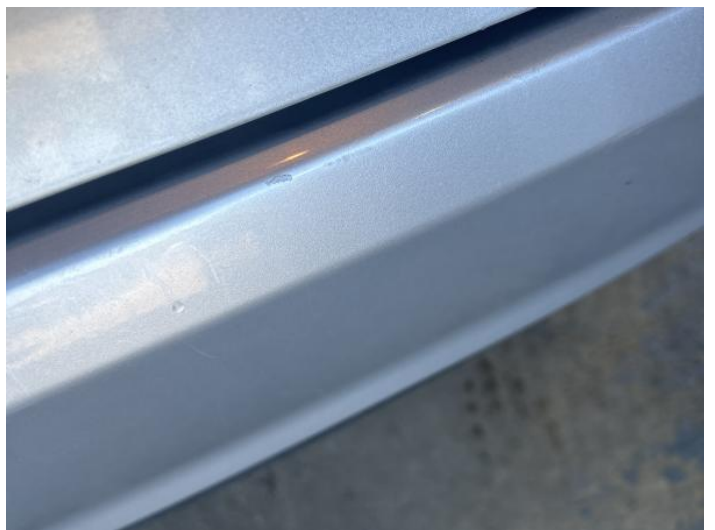
8: Bumper Rear Chipped 1 To 5