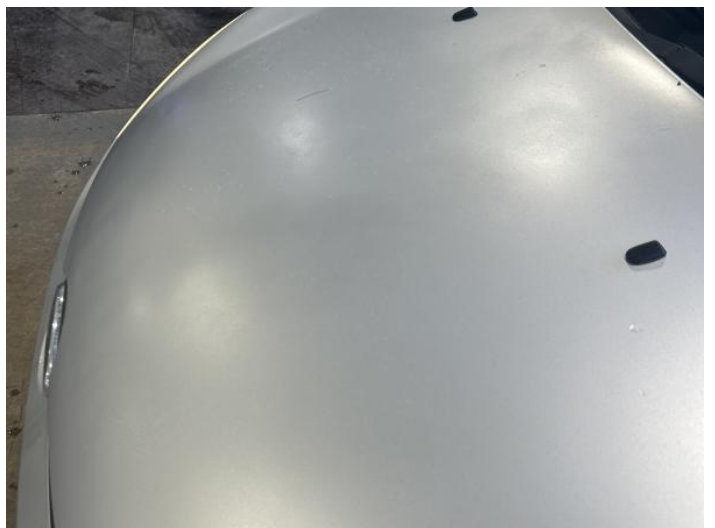
14: Bonnet Poor Previous Repair Poor Paint