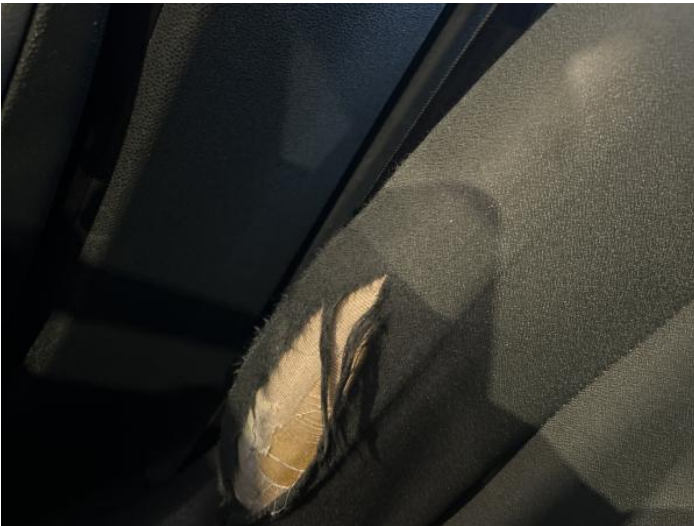
1: Seat Back Cover osf Holed Over 3mm