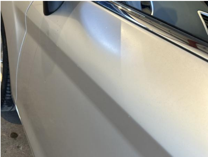
11: Door nsf Poor Previous Repair Poor Paint