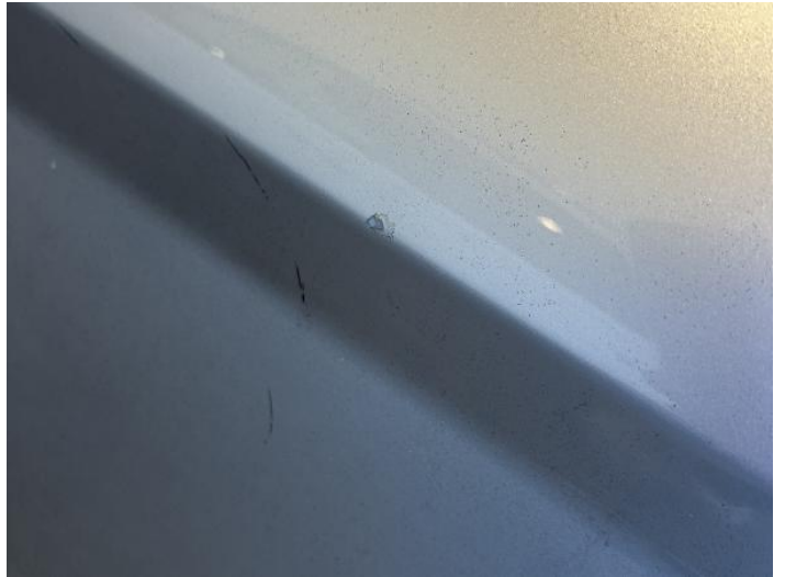
10: Door nsr Chipped 1 To 5