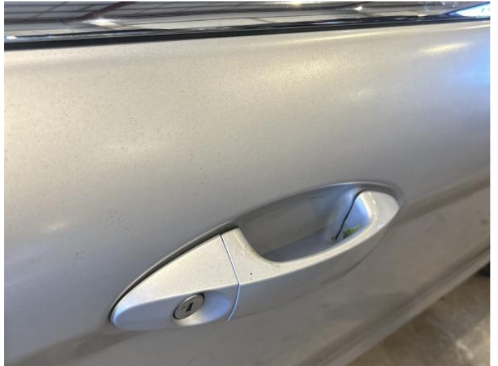
4: Door osf Poor Previous Repair Poor Paint