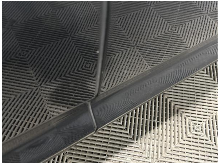
2: Door osr Chipped 1 To 5