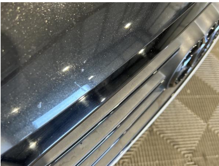
7: Bonnet Chipped 1 To 5