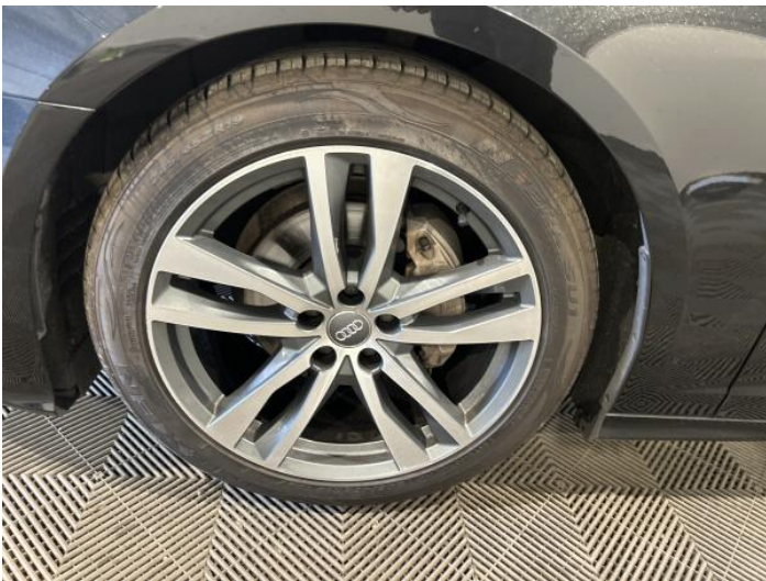
5: Wheel nsf Scratched Over 50mm