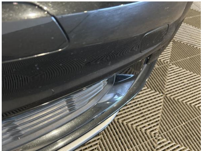
6: Bumper Front Chipped Multiple Chips