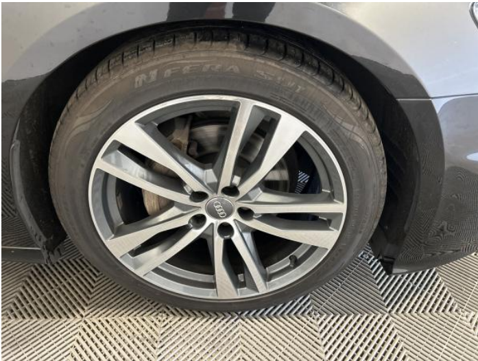
1: Wheel osf Scratched Up To 50mm