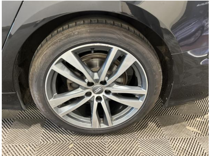
4: Wheel nsr Scratched Over 50mm