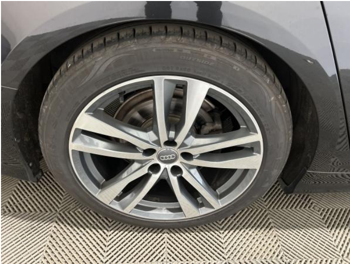
3: Wheel osr Scratched Up To 50mm