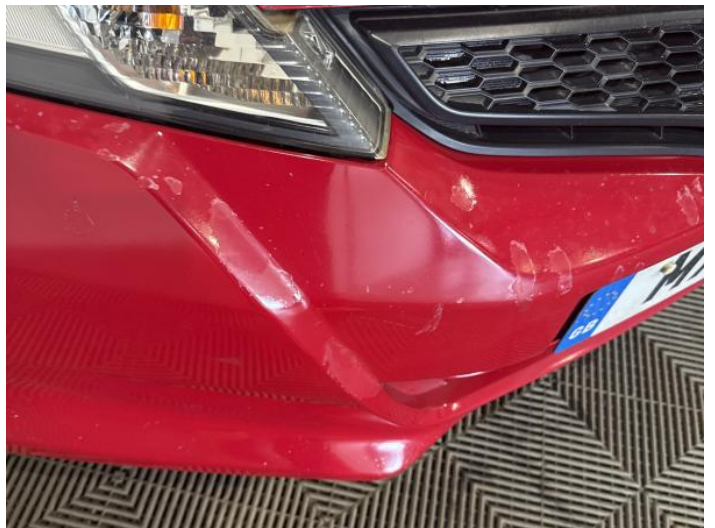
2: Bumper Front Poor Previous Repair Paint Flake