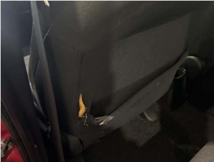
15: Seat Back Cover nsf Torn Over 3mm