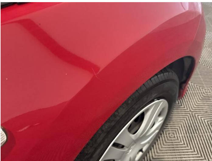
13: Wing osf Scratched Over 25mm Thru Paint