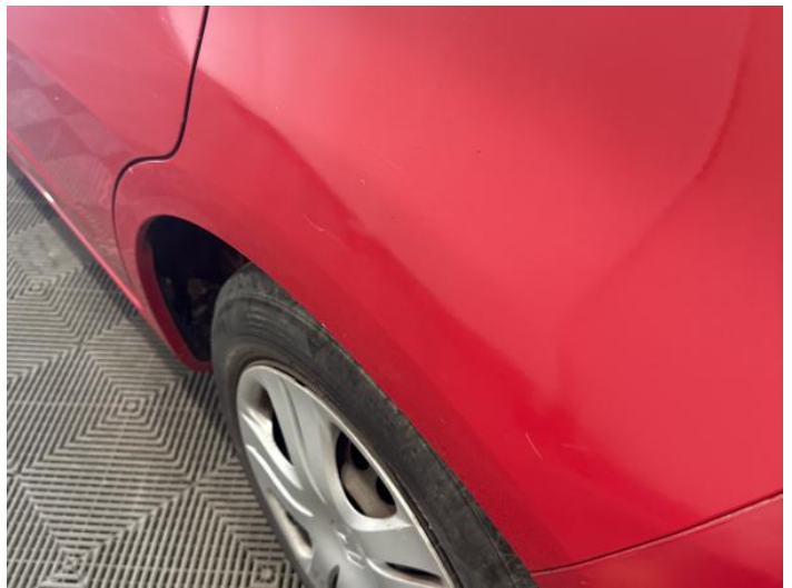
6: Qtr Panel nsr Scratched Over 25mm Thru Paint