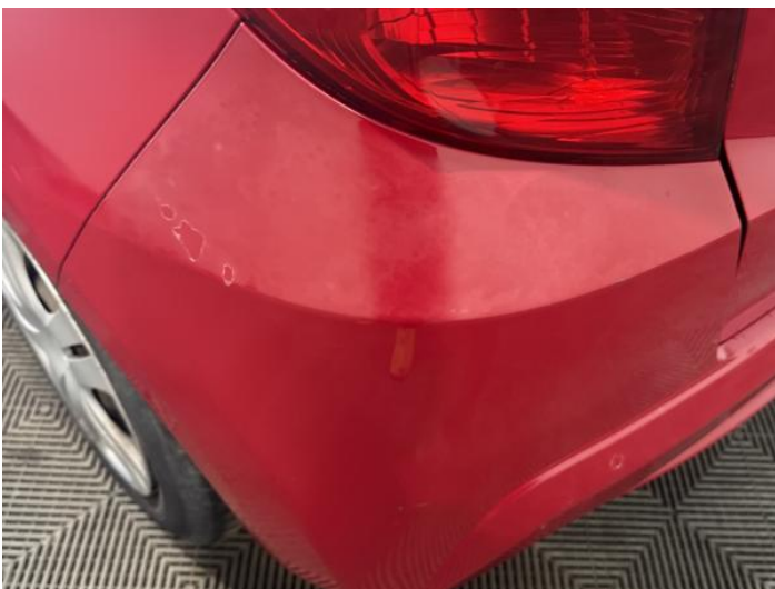
7: Bumper Rear Poor Previous Repair Paint Flake