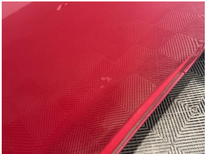
12: Door osf Scratched Over 25mm Thru Paint