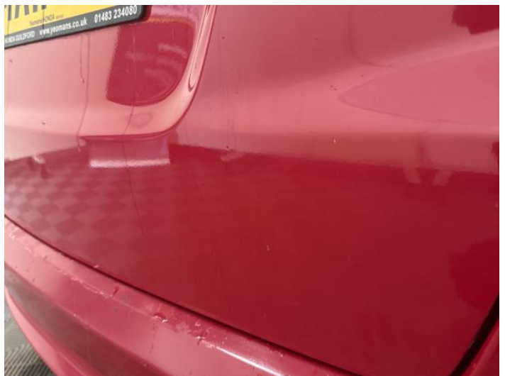
8: Tailgate Chipped 1 To 5