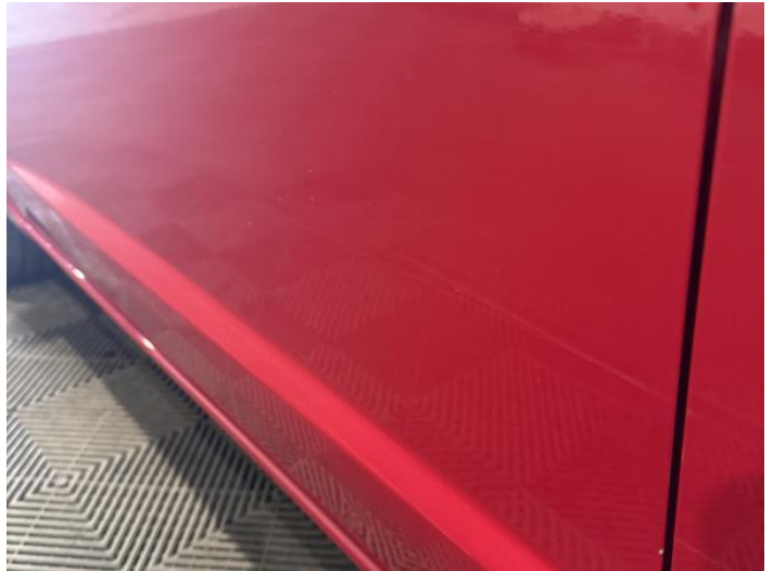
4: Door nsf Scratched Over 25mm Thru Paint