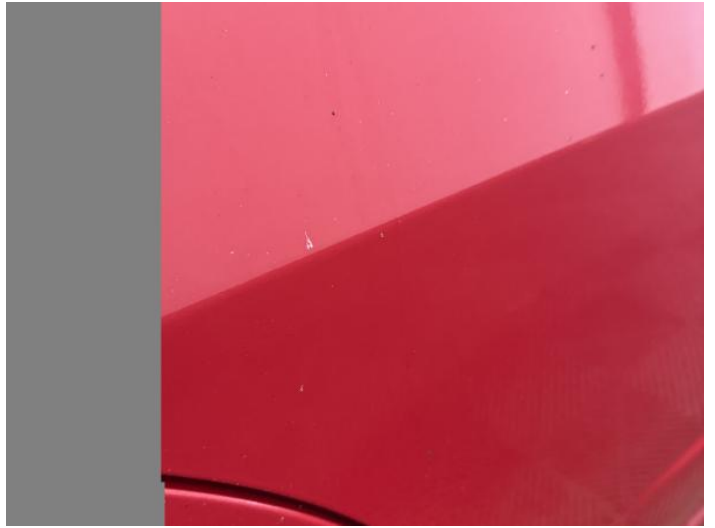
10: Door osf Chipped 1 To 5