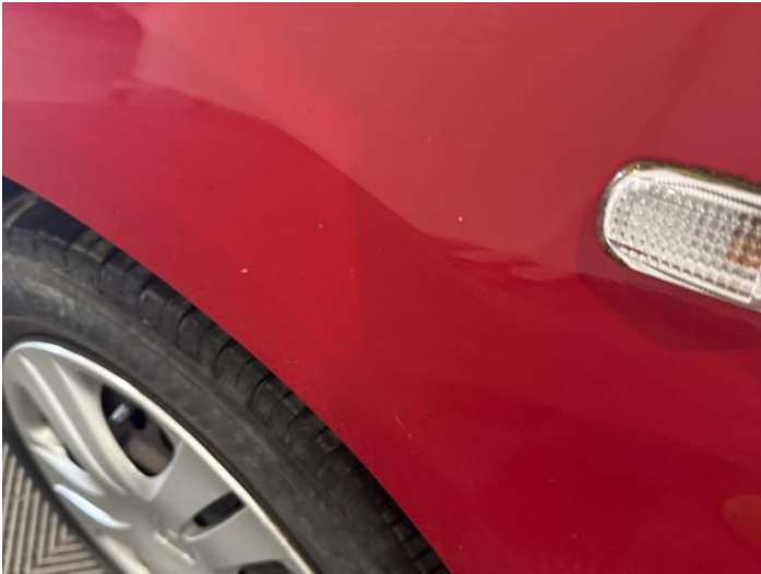
3: Wing nsf Chipped 1 To 5