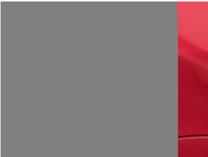
5: Door nsr Scratched Over 25mm Thru Paint