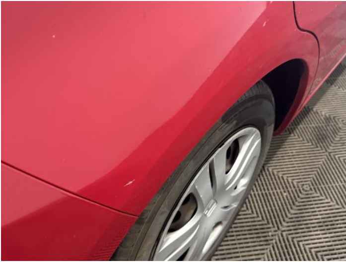
9: Qtr Panel osf Dented With Paint Damage