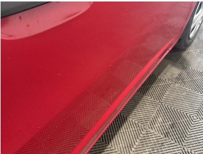
11: Door osf Dented Between 10mm + 30mm