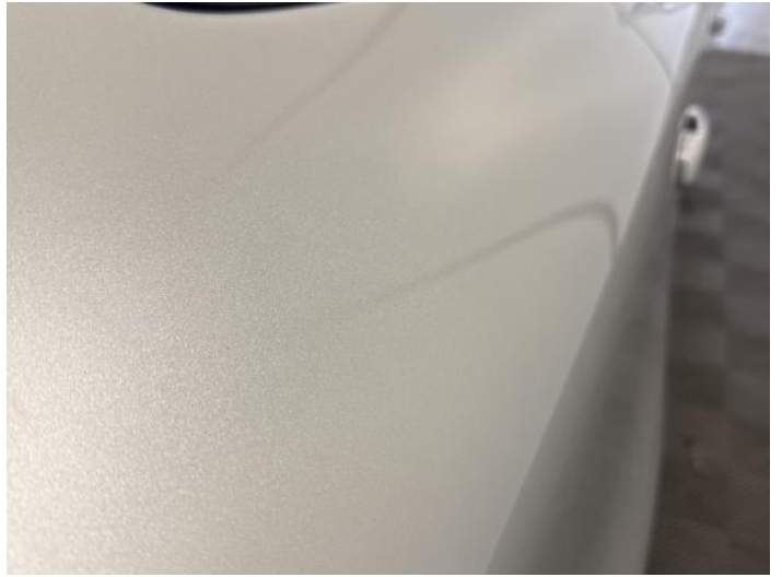
10: Qtr Panel osr Dented Between 10mm + 30mm