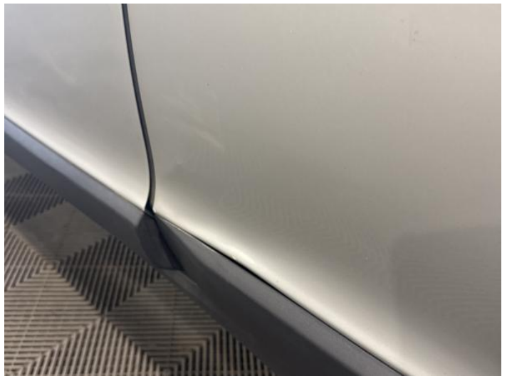
6: Door nsr Dented With Paint Damage