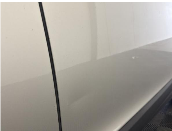
13: Door osf Dented Over 30mm