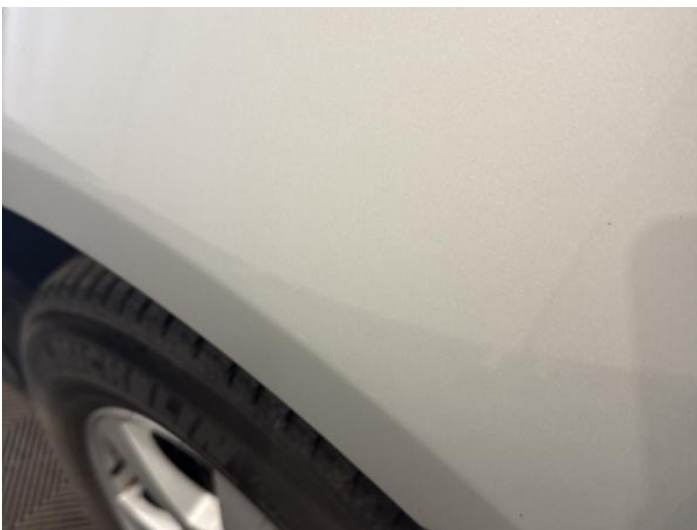
7: Qtr Panel nsr Scratched UpTo 25mm Thru Paint