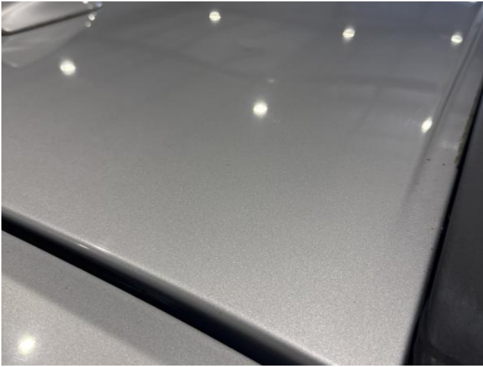
9: Roof Dented Over 30mm