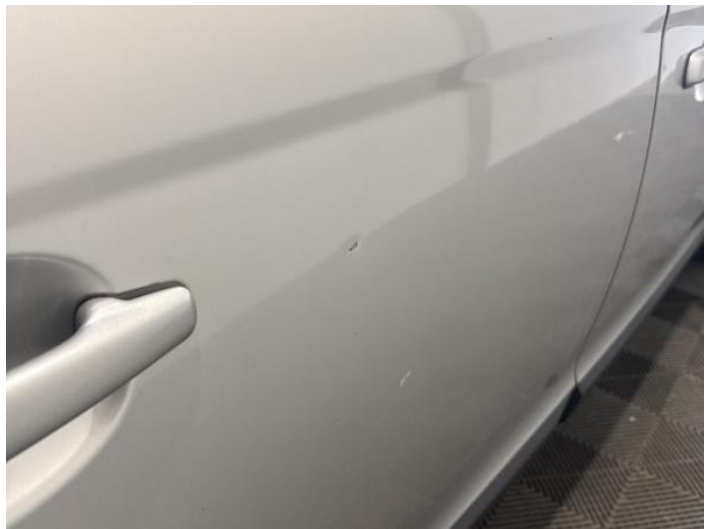
12: Door osr Dented Between 10mm + 30mm