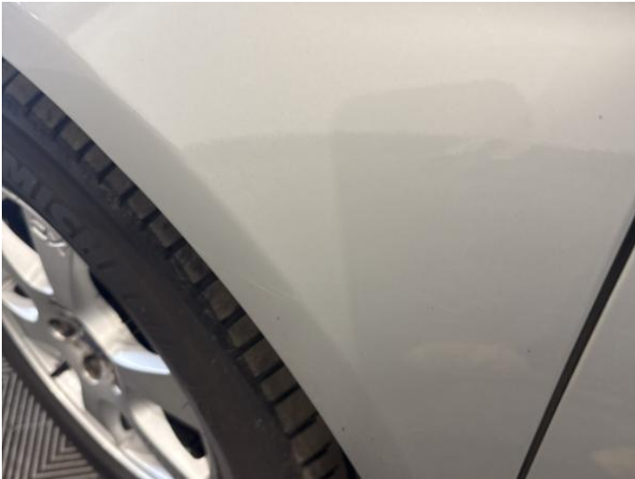
3: Wing nsf Scratched Over 25mm Thru Paint