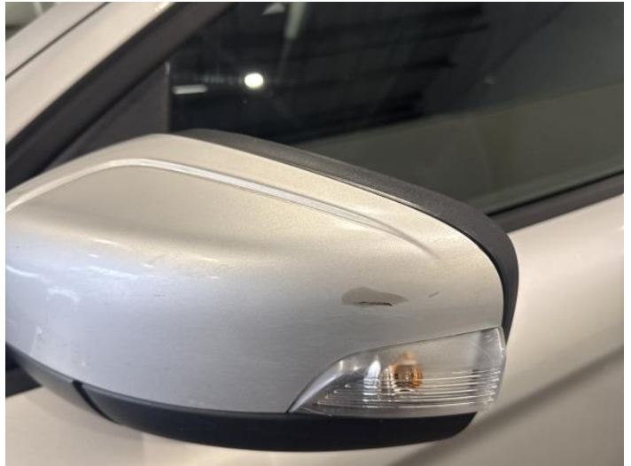
4: Door Mirror Assy nsf Scratched (Painted) UpTo 25mm Thru Paint