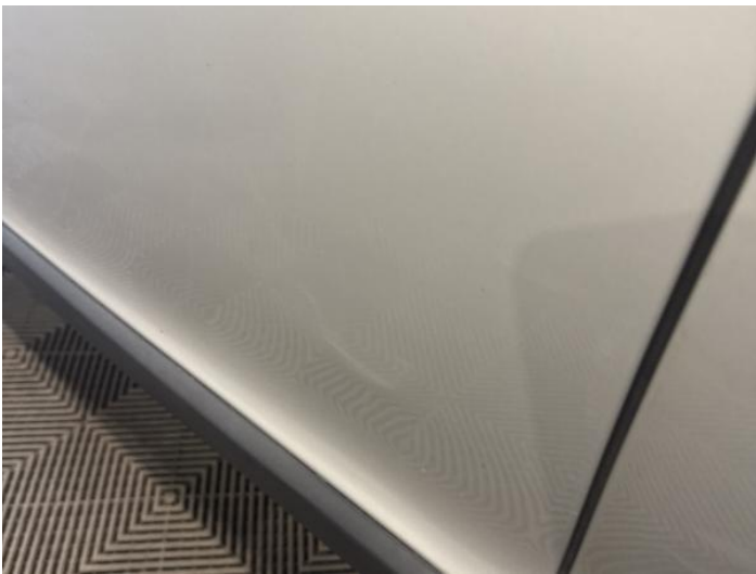
5: Door nsf Dented Over 30mm