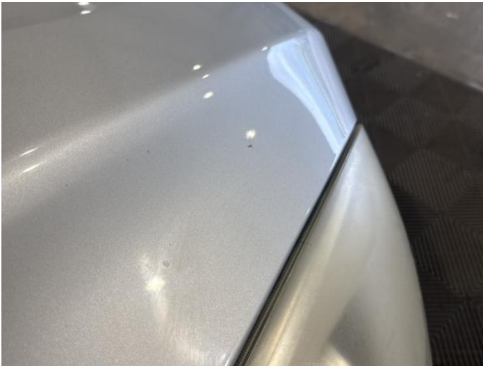
1: Bonnet Scratched Over 25mm Thru Paint