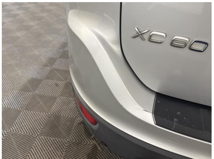
8: Bumper Rear Scratched 25 to 100mm Thru Paint