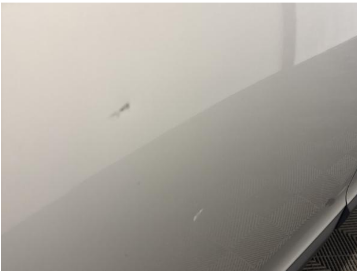
11: Door osr Scratched Over 25mm Thru Paint