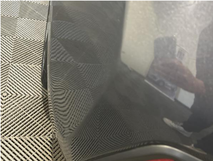
3: Bumper Rear Chipped 1 To 5