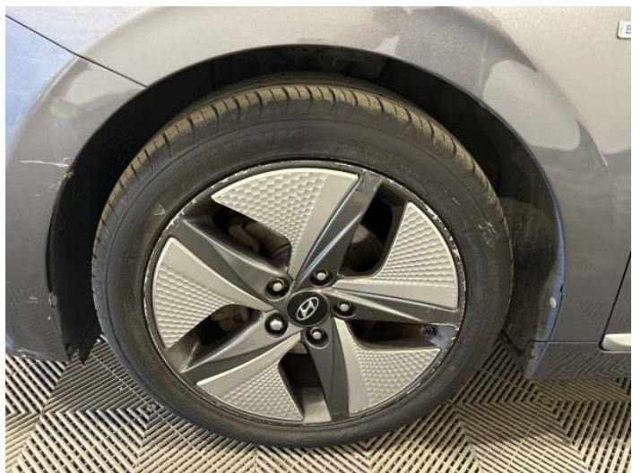
8: Wheel nsf Scratched Over 50mm