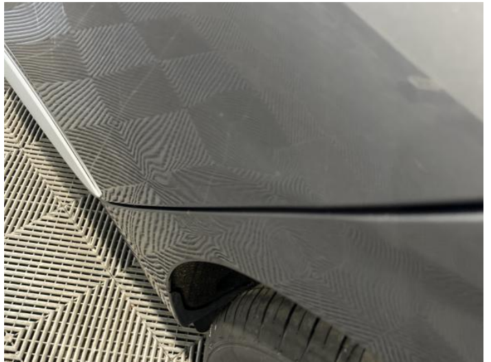
6: Door nsr Dented With Paint Damage