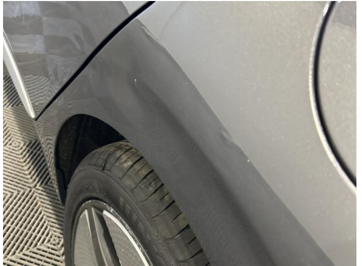
4: Qtr Panel nsr Dented Over 30mm