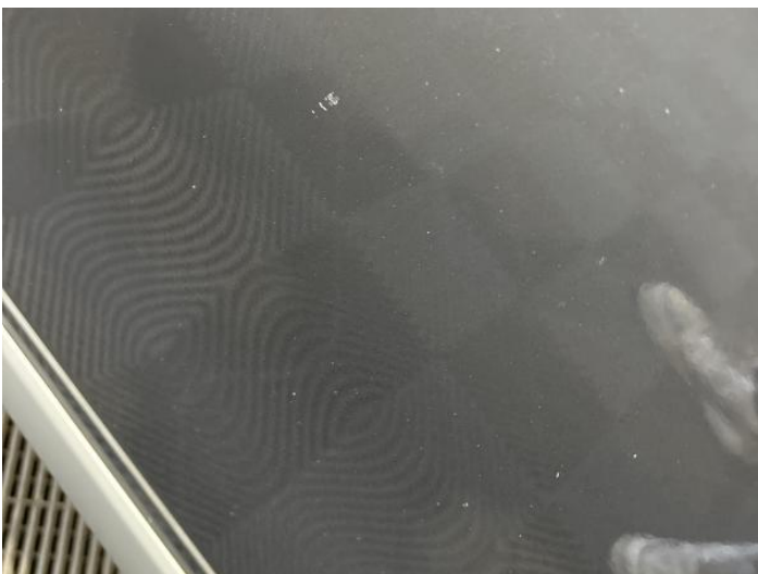
7: Door nsf Chipped 1 To 5