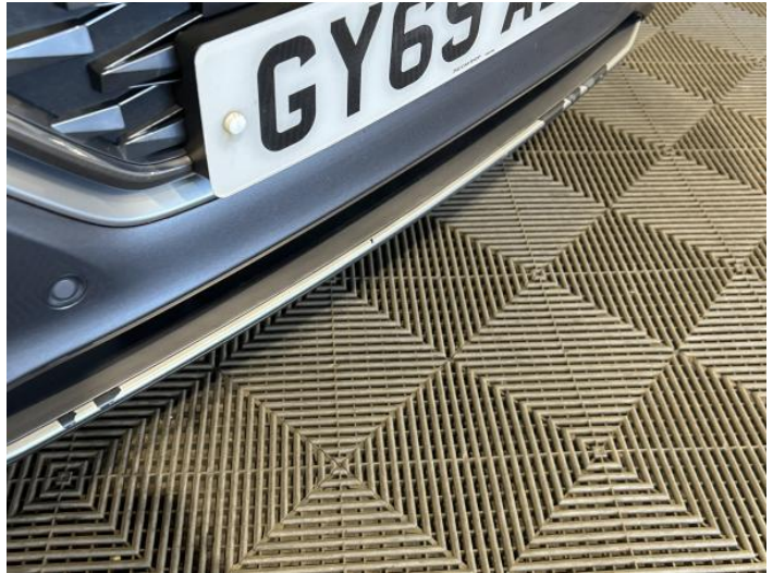
9: Bumper Front Scratched Over 100mm Thru Paint