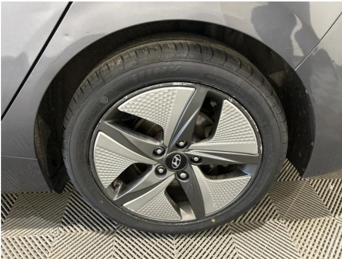
5: Wheel nsr Scratched Over 50mm