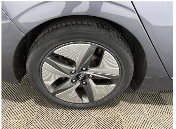
2: Wheel osr Scratched Over 50mm