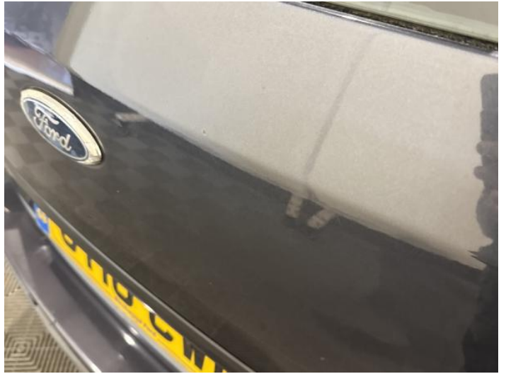
10: Tailgate Chipped 1 To 5