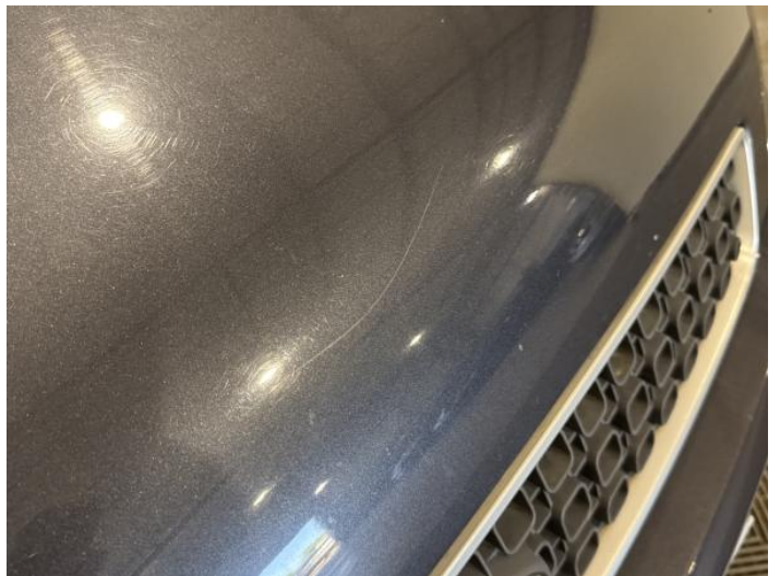
2: Bonnet Scratched Over 25mm Thru Paint