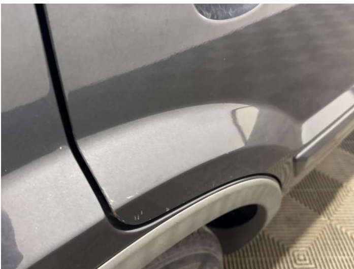
13: Door osr Scratched Over 25mm Thru Paint