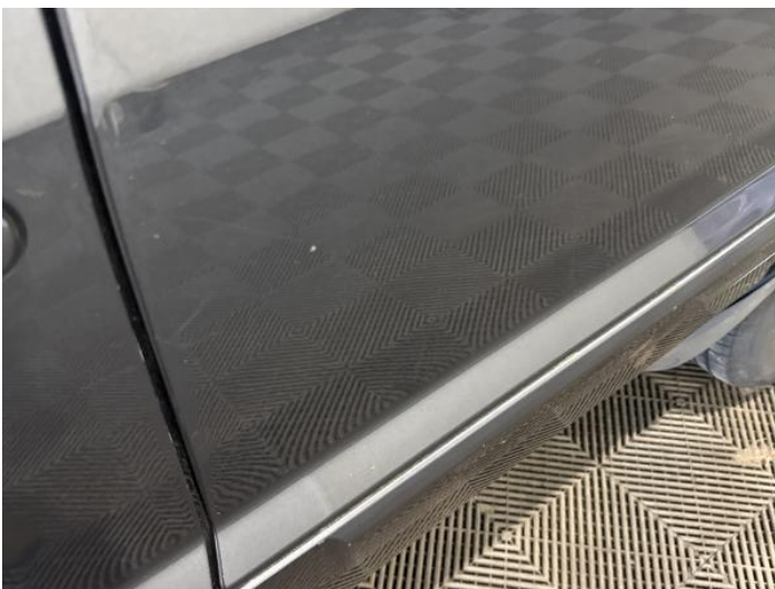
7: Door nsr Scratched Over 25mm Thru Paint