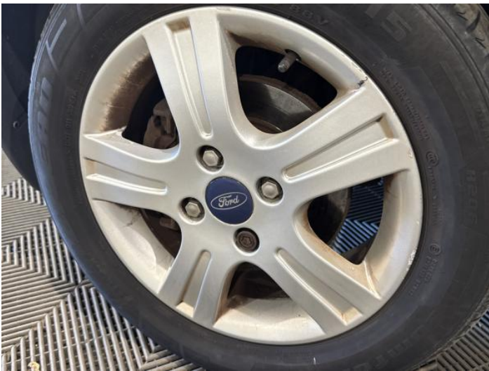
5: Wheel nsf Scratched Over 50mm