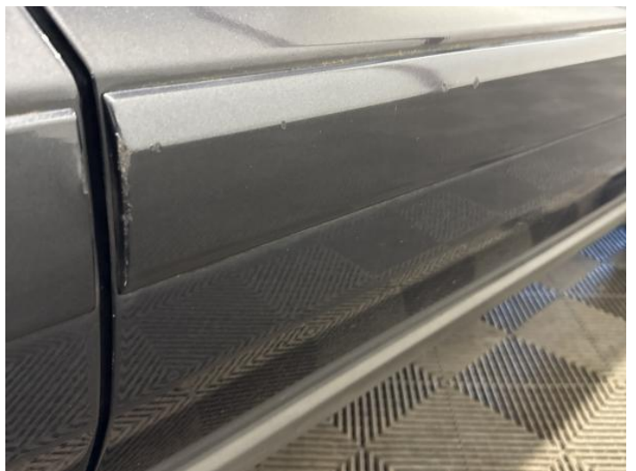
14: Door Moulding osf Scratched (Painted) Over 25mm Thru Paint