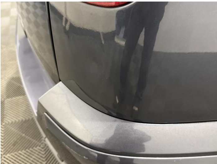
11: Qtr Panel osr Dented Over 30mm