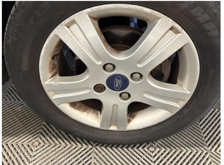
18: Wheel osf Scratched Over 50mm