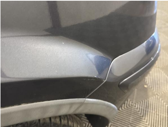
17: Wing osf Scratched Over 25mm Thru Paint