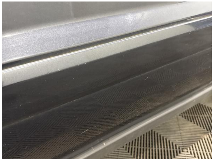
6: Door nsf Chipped Multiple Chips