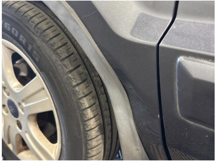
4: Wing nsf Dented Over 30mm