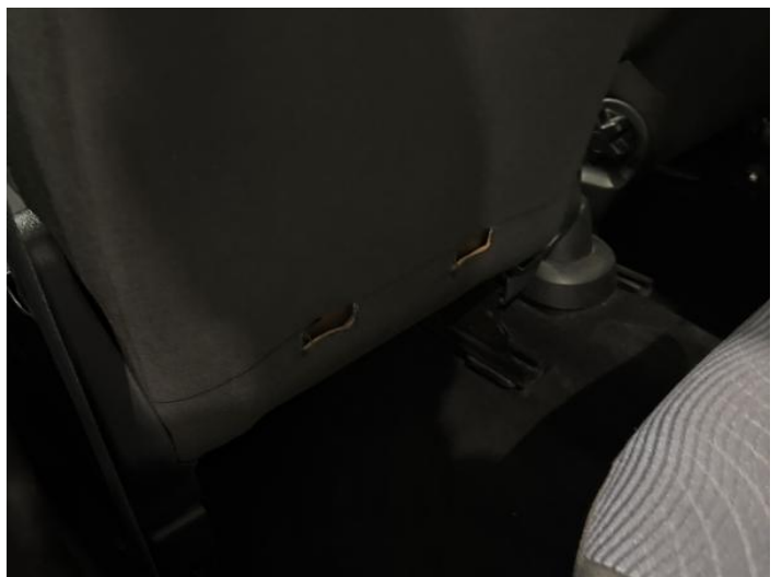
20: Seat Back Cover nsf Scuffed Over 25mm