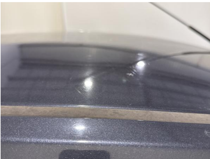
19: Roof Dented Over 30mm