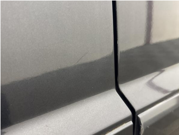
15: Door osr Dented Between 10mm + 30mm