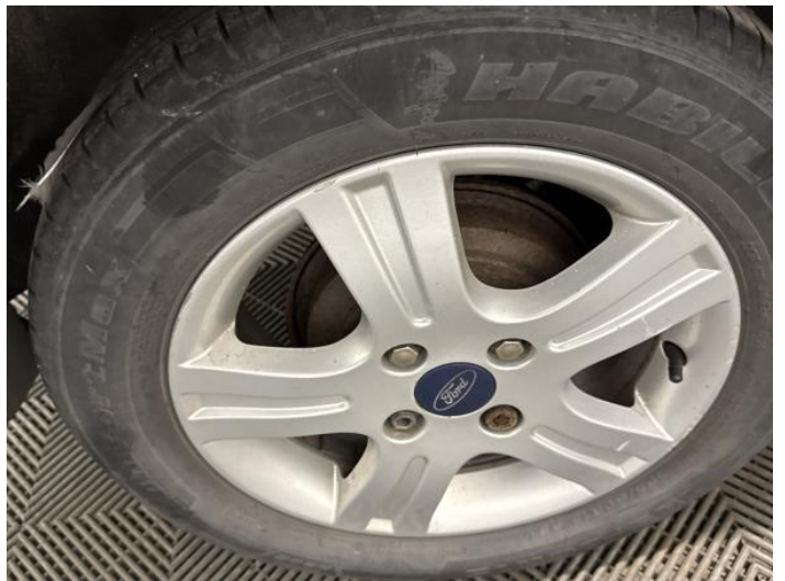
12: Wheel osr Scratched Over 50mm