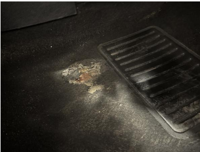
1: Carpets Front Holed Over 3mm