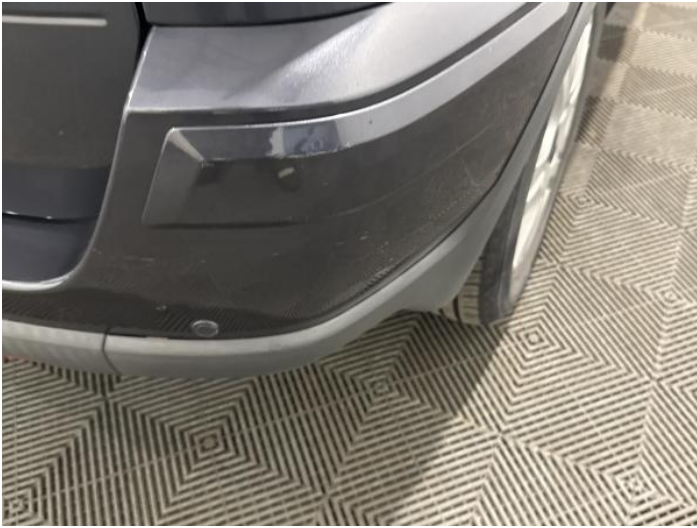
9: Bumper Rear Scratched Over 100mm Thru Paint