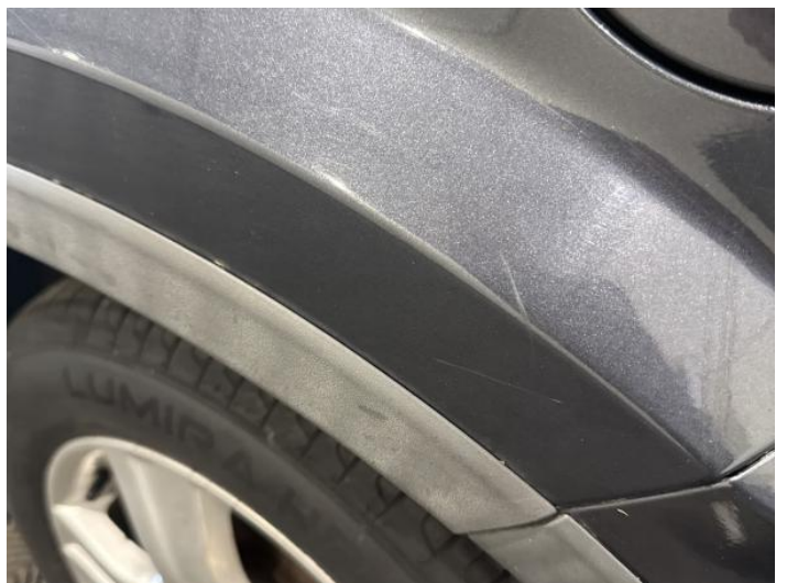
8: Qtr Panel nsr Scratched Over 25mm Thru Paint