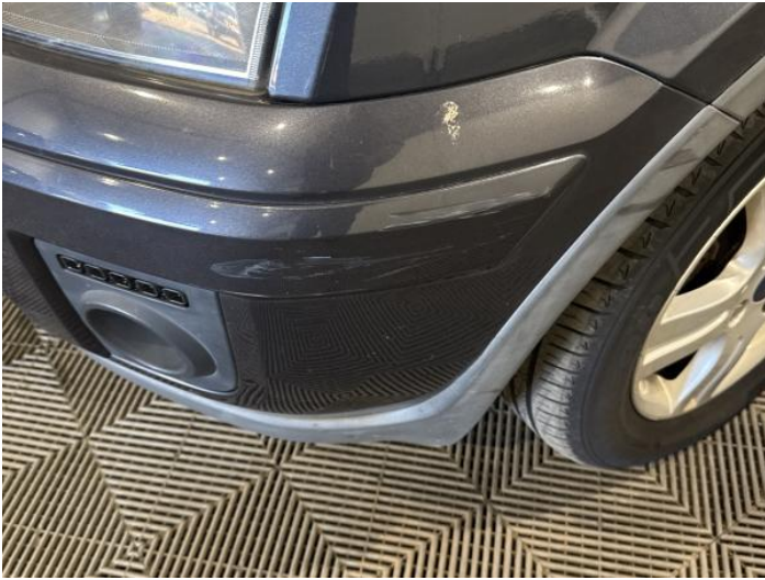
3: Bumper Front Scratched 25 to 100mm Thru Paint