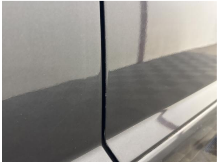
16: Door osf Chipped Edge Chip