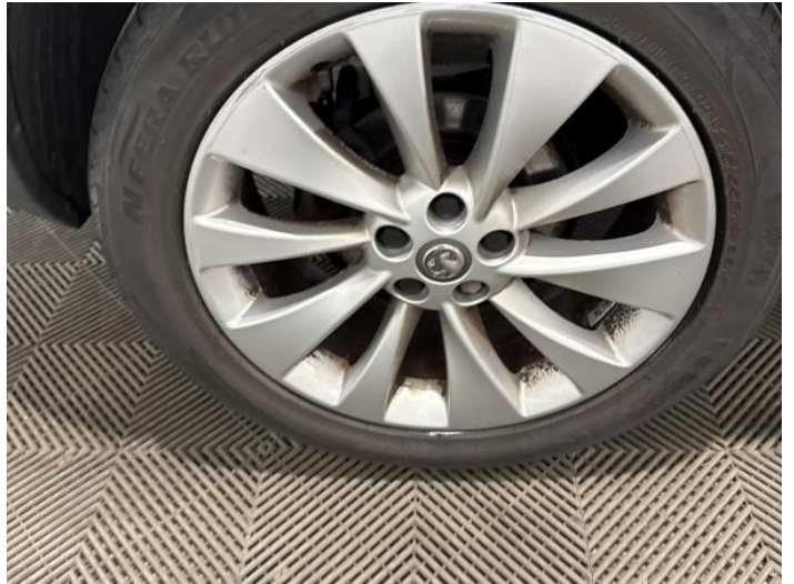
10: Wheel osr Scratched Up To 50mm