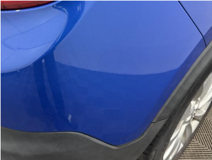
9: Bumper Rear Scratched 25 to 100mm Thru Paint