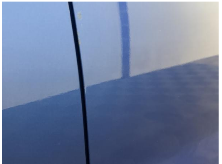
12: Door osf Dented 2 Or Less UpTo 10mm