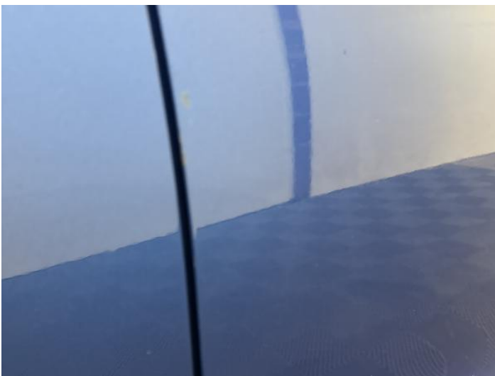
13: Door osf Scratched UpTo 25mm Thru Paint