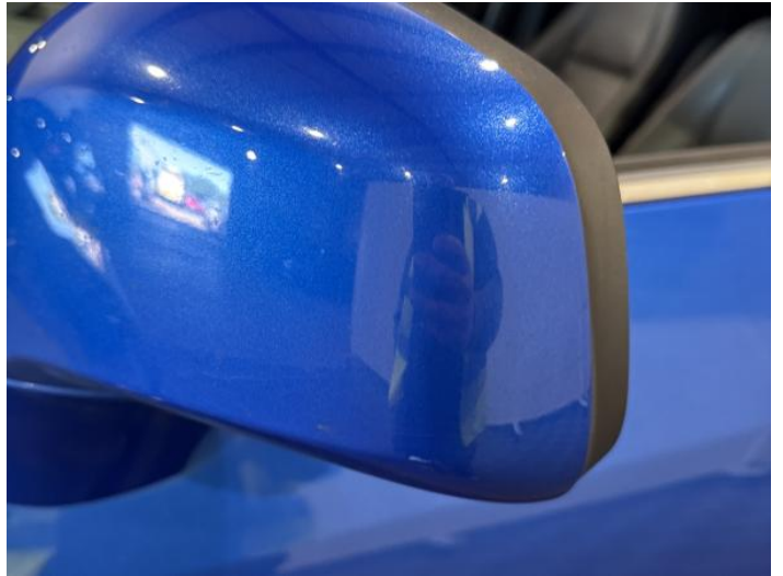
4: Door Mirror Assy nsf Scratched (Painted) UpTo 25mm Thru Paint