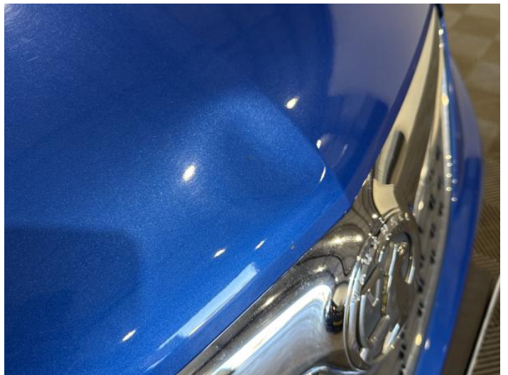
2: Bonnet Chipped 1 To 5