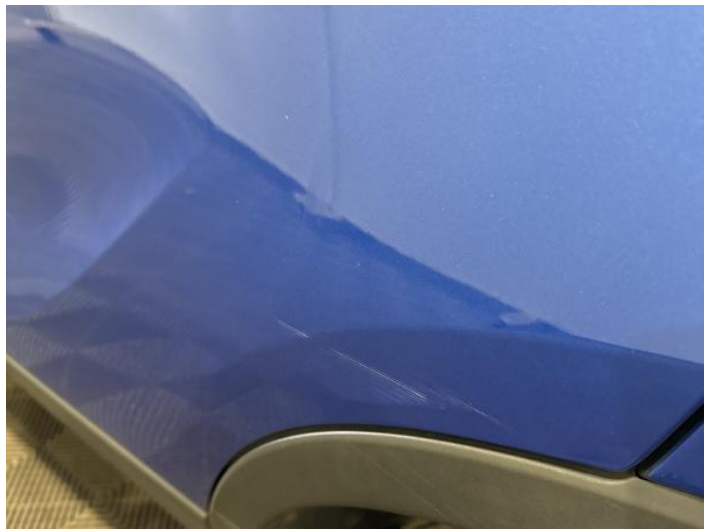
6: Door nsr Dented With Paint Damage