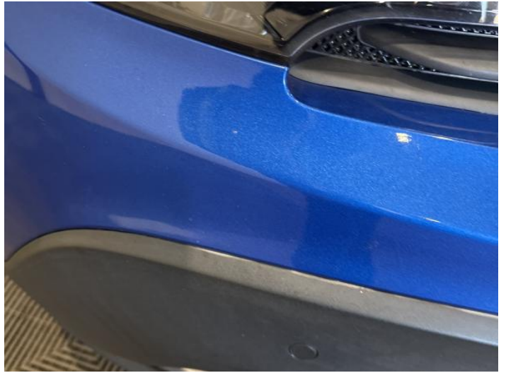
16: Bumper Front Chipped 1 To 5