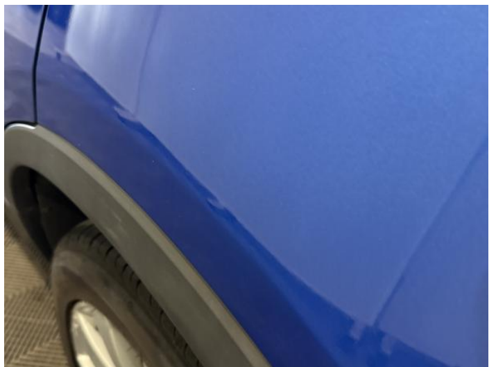
8: Qtr Panel nsr Dented Between 10mm + 30mm