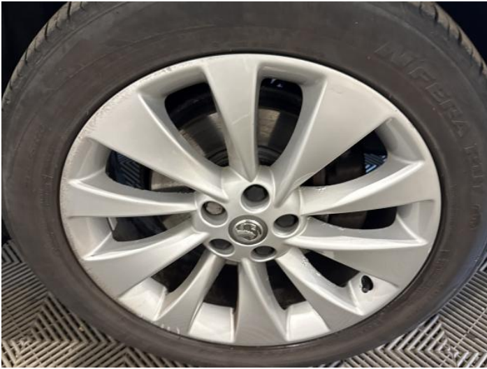
15: Wheel of Scratched Over 50mm