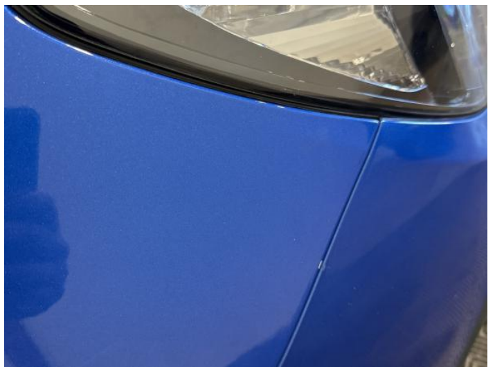
14: Wing osf Chipped 1 To 5