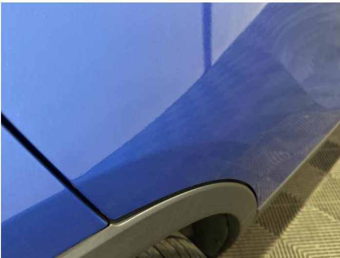
11: Door osr Dented Between 10mm + 30mm