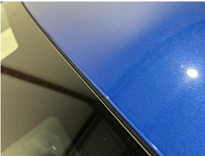
17: Roof Chipped Edge Chip