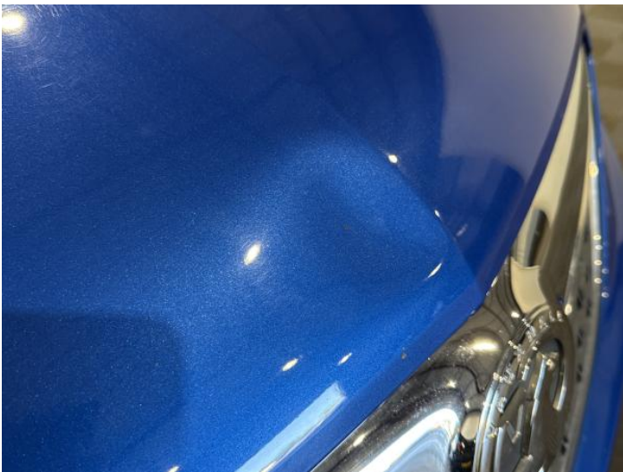
1: Bonnet Dented Over 30mm