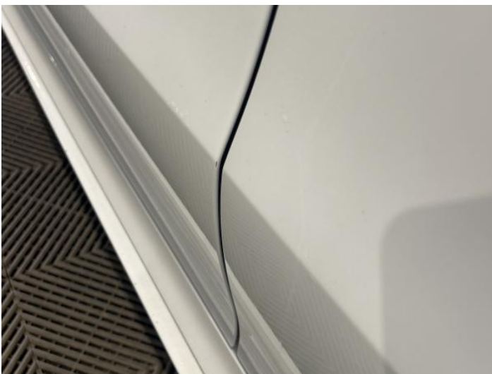
7: Door nsf Chipped Edge Chip