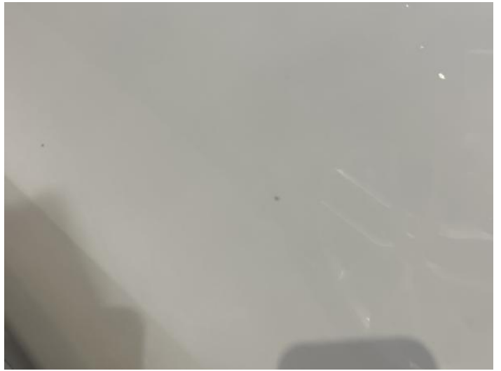
6: Door nsr Chipped 1 To 5