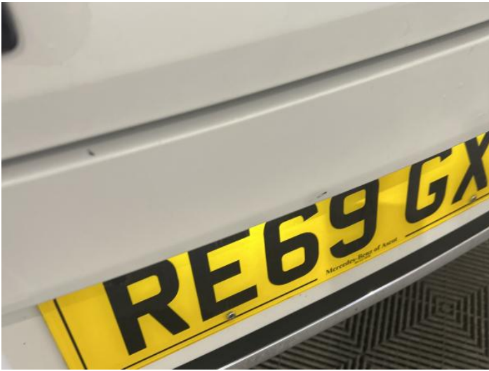
5: Bumper Rear Chipped 1 To 5