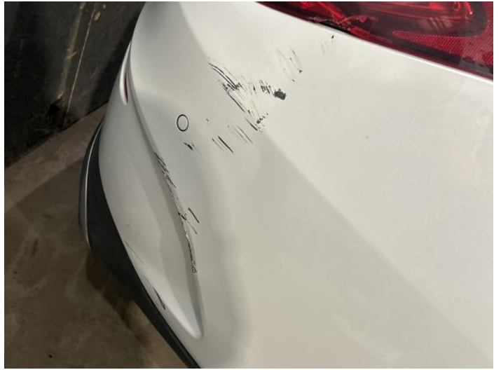
4: Bumper Rear Scratched 25 to 100mm Thru Paint