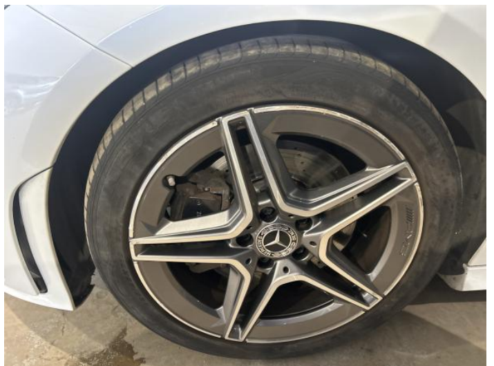
8: Wheel nsf Scratched Over 50mm