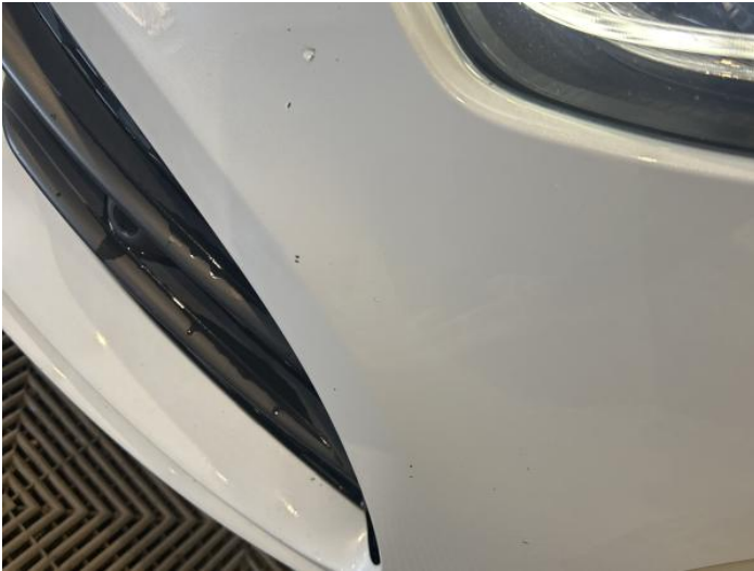
9: Bumper Front Chipped Multiple Chips