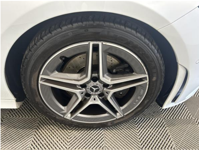
1: Wheel of Scratched Over 50mm