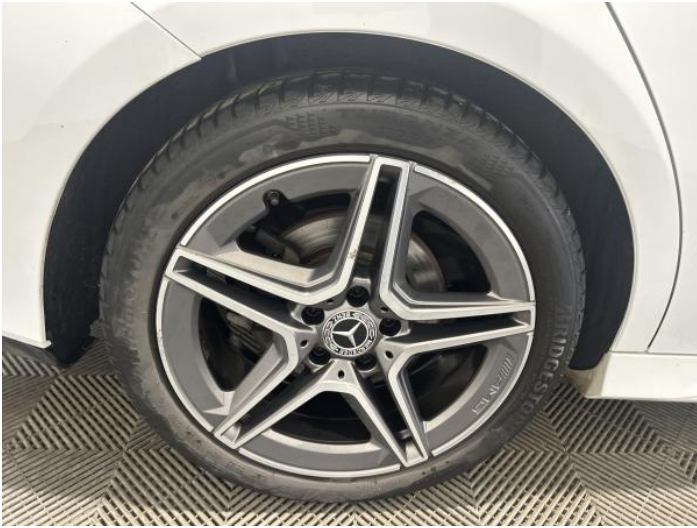
3: Wheel osr Corroded Light