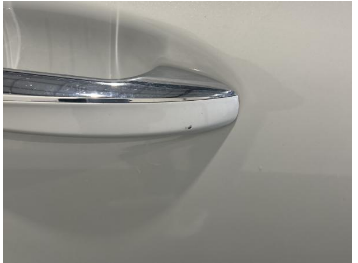
2: Other N/A N/A