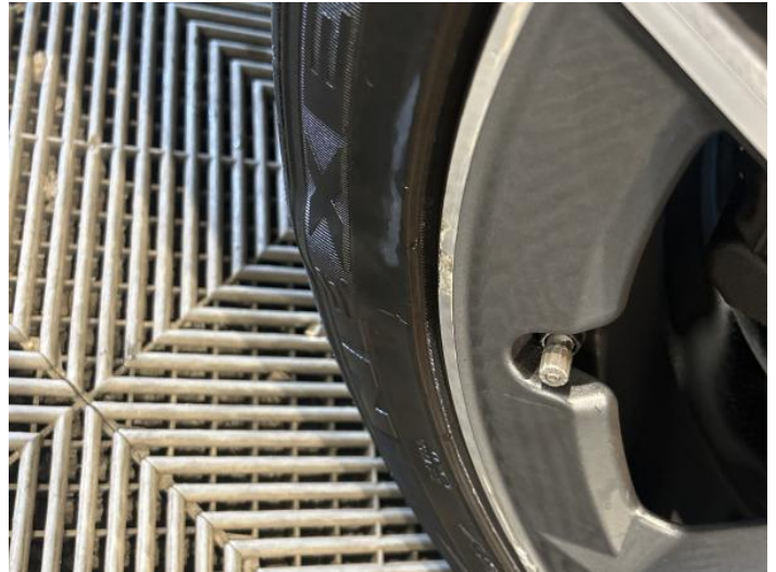
10: Tyre nsf Damaged Replace