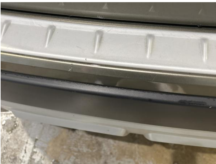
7: Bumper Rear Chipped Multiple Chips