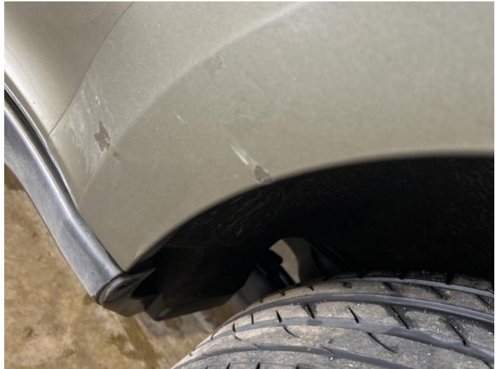
10: Door nsr Chipped Over 5mm