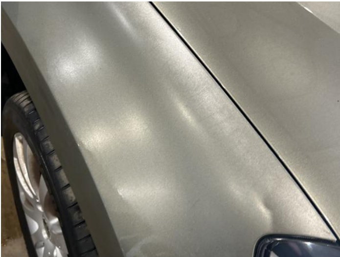
1: Wing osf Poor Previous Repair Poor Paint