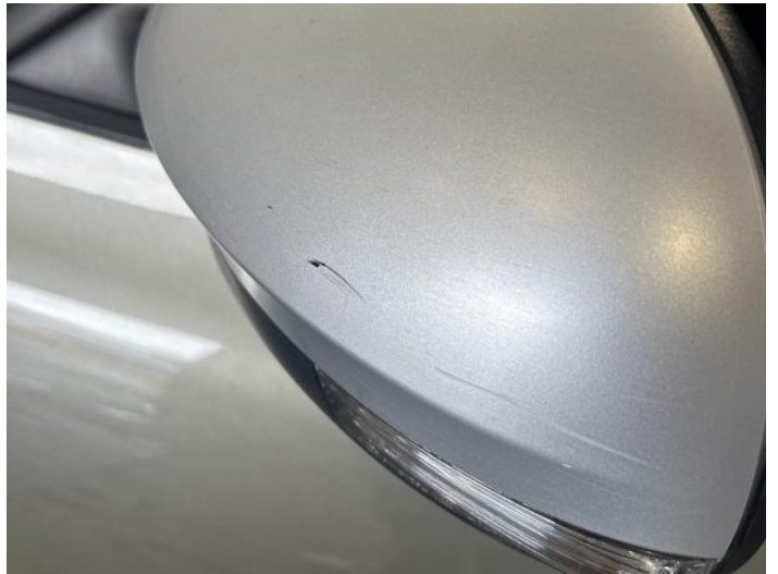
12: Door Mirror Assy nsf Scratched (Painted) UpTo 25mm Thru Paint