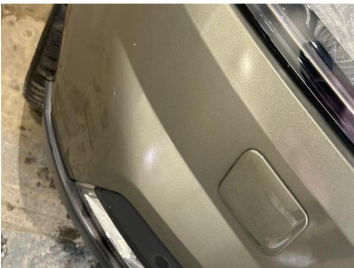
13: Bumper Front Poor Previous Repair Poor Paint