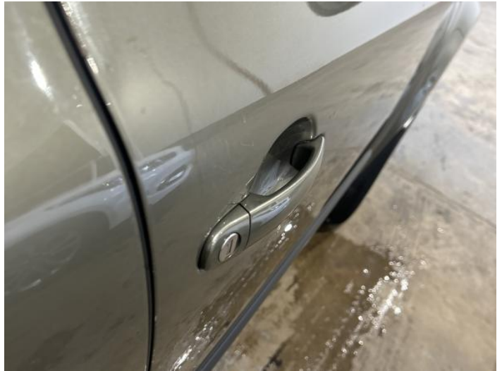
4: Door osf Dented 2 Or Less Up To 10mm