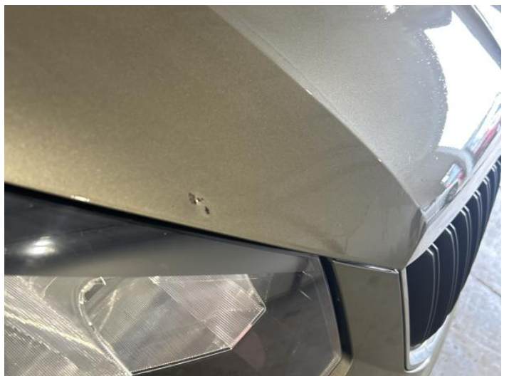
14: Bonnet Dented With Paint Damage