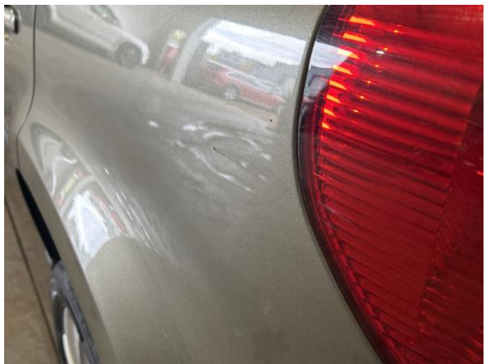
8: Qtr Panel nsr Dented Over 30mm