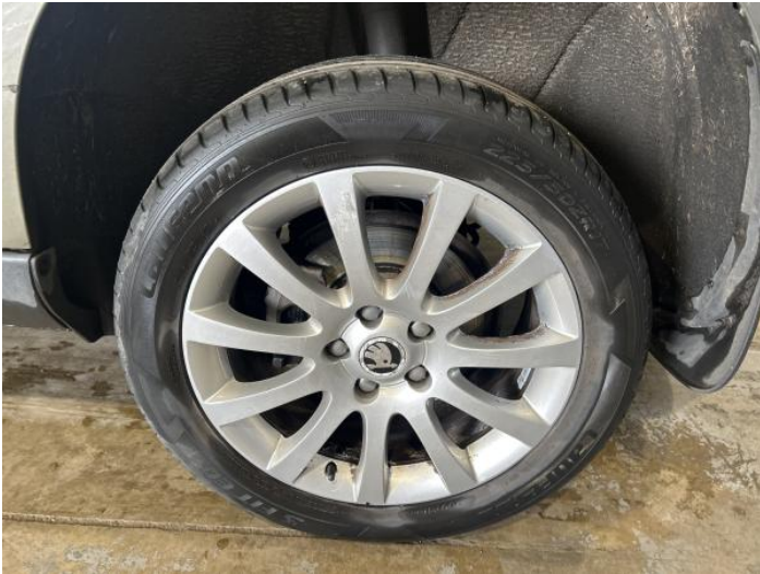
9: Wheel nsr Corroded Light