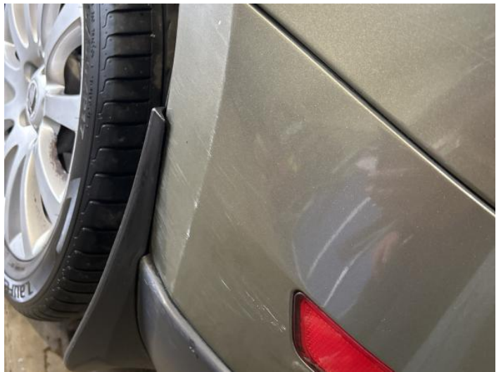
6: Bumper Rear Scratched 25 to 100mm Thru Paint