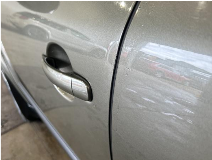
11: Door nsf Dented Over 30mm