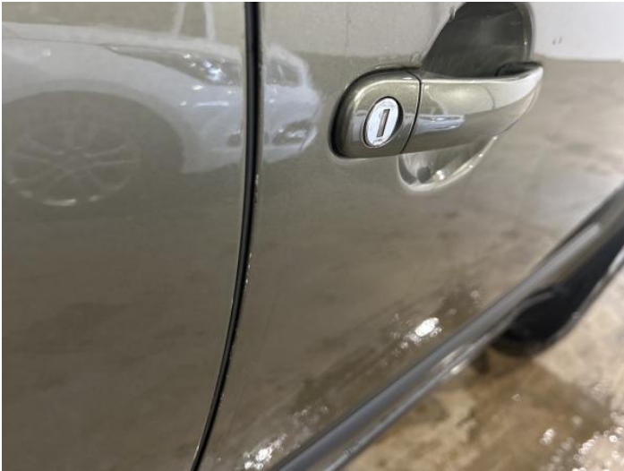
3: Door osf Chipped Edge Chip