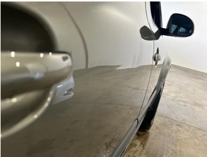
5: Door osr Dented Over 30mm