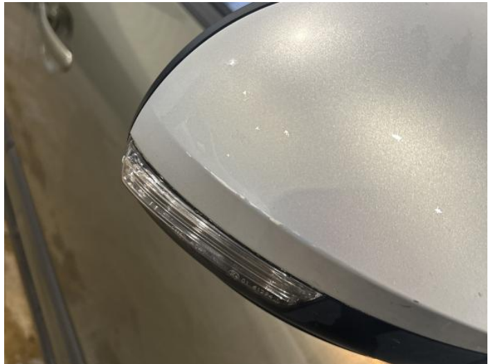
2: Door Mirror Assy osf Scratched (Painted) Over 25mm Thru Paint