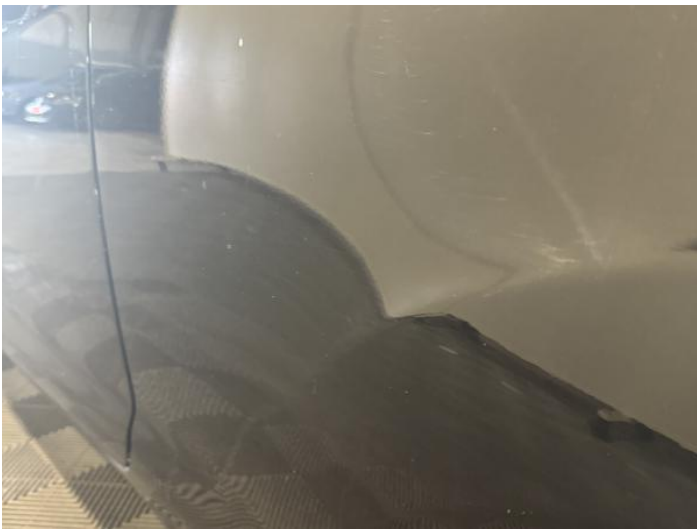
5: Qtr Panel nsr Dented With Paint Damage