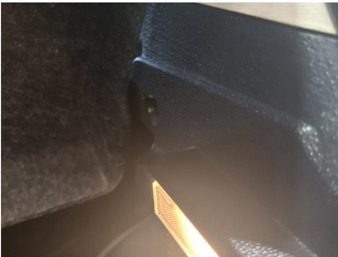
1: Fascia Trim Damaged Replace