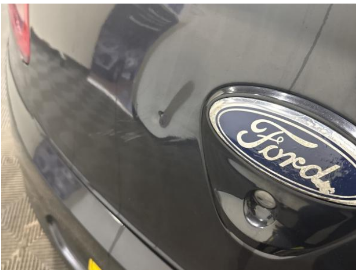
7: Tailgate Dented With Paint Damage