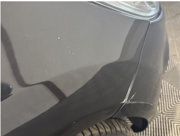
11: Wing osf Scratched Over 25mm Thru Paint