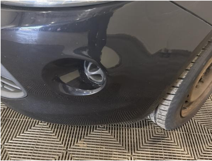
3: Bumper Front Scratched Over 100mm Thru Paint