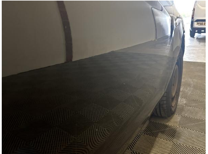
10: Door osf Dented Over 30mm