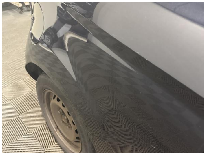
8: Qtr Panel osr Dented With Paint Damage