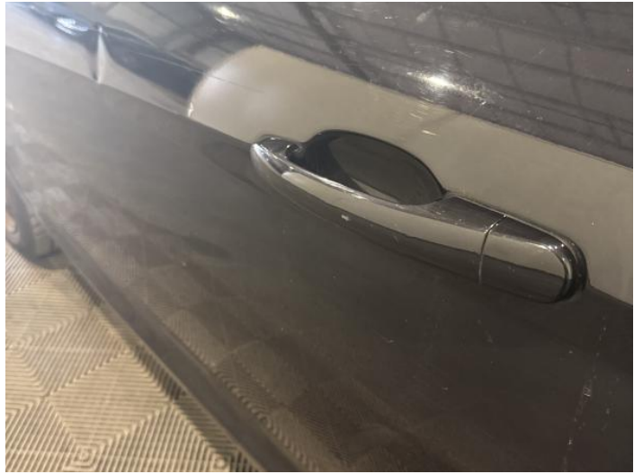
4: Door nsf Dented With Paint Damage