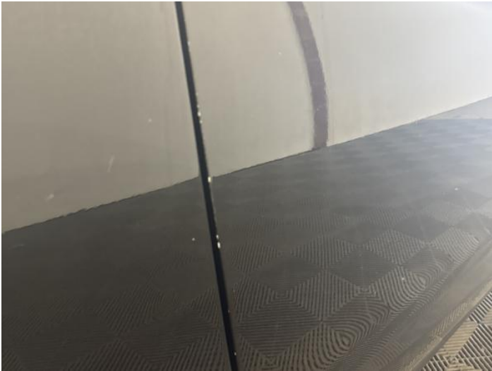
9: Door osf Chipped Edge Chip