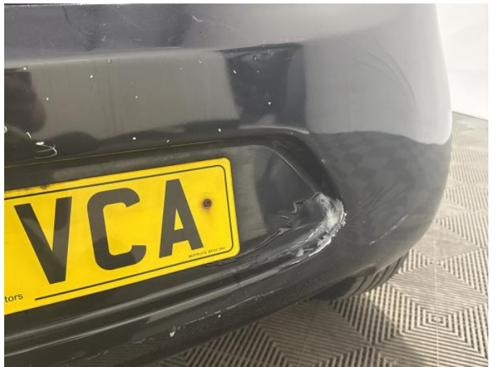
6: Bumper Rear Dented With Paint Damage