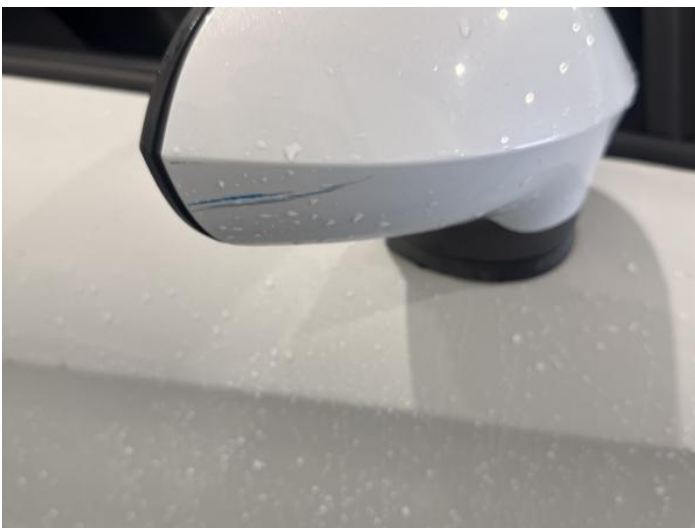
13: Door Mirror Assy osf Scratched (Painted) Over 25mm Thru Paint