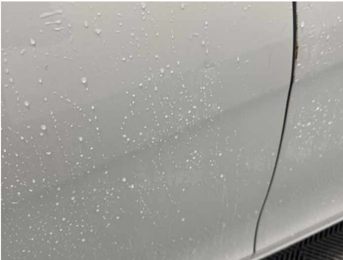
11: Door osr Chipped 1 To 5