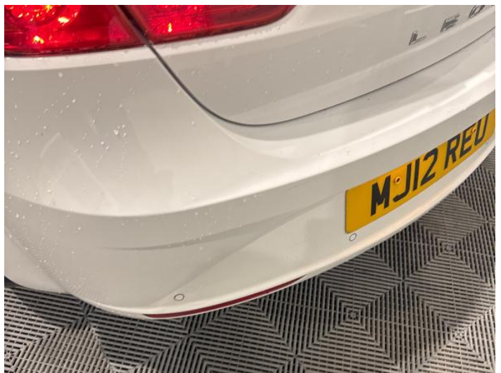
8: Bumper Rear Scratched 25 to 100mm Thru Paint