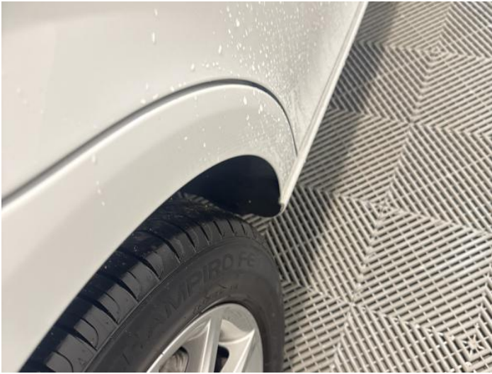
9: Qtr Panel osr Dented 2 Or Less UpTo 10mm