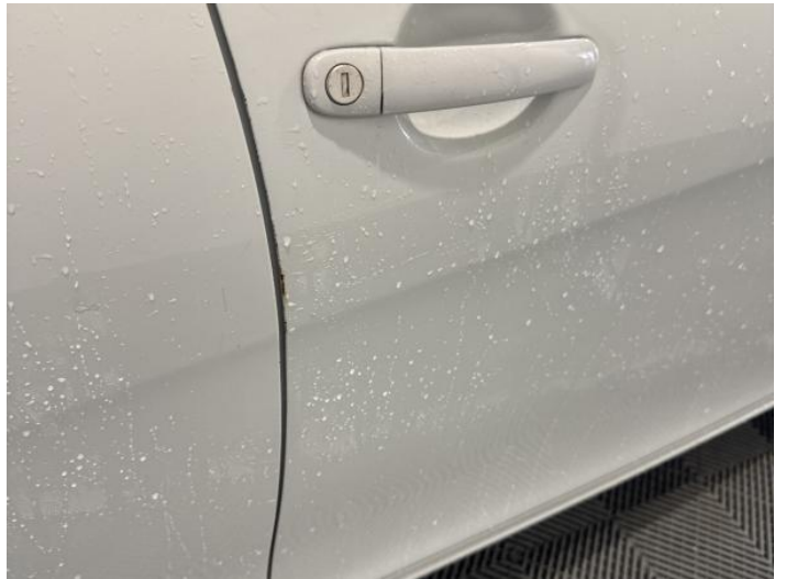
12: Door osf Chipped Multiple Chips