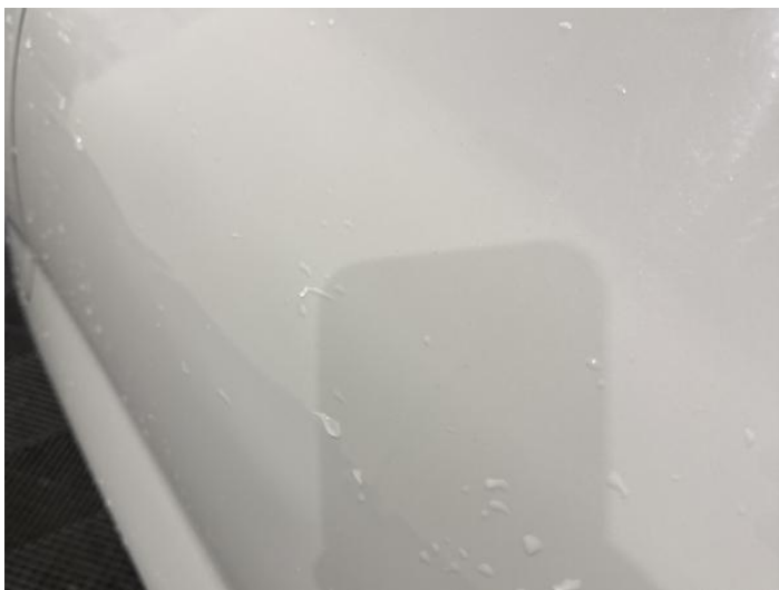
7: Qtr Panel nsr Dented Over 30mm