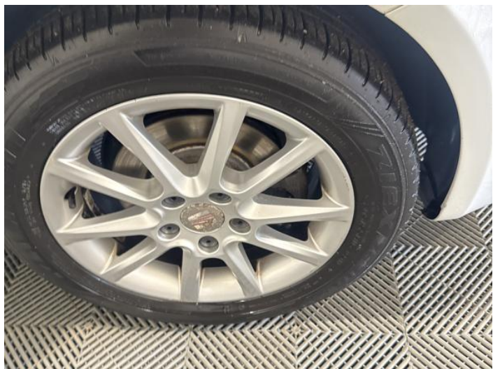
14: Wheel osf Scratched Up To 50mm