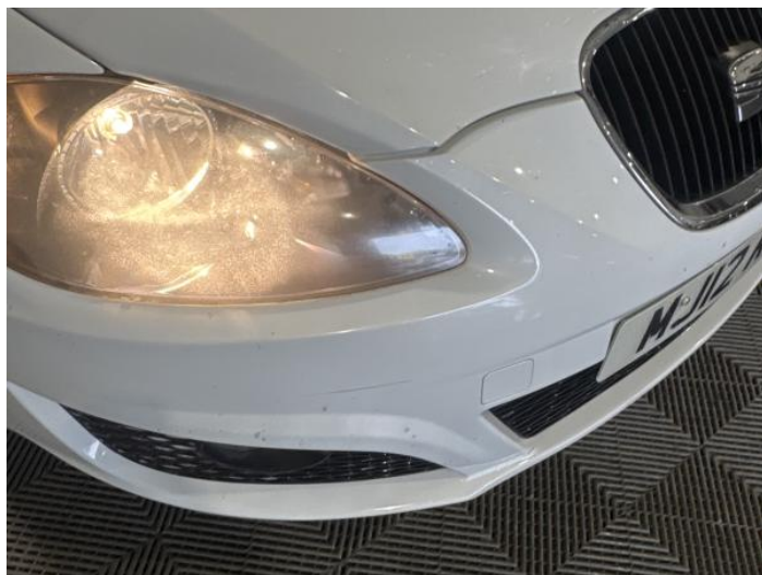
2: Bumper Front Poor Previous Repair Paint Flake