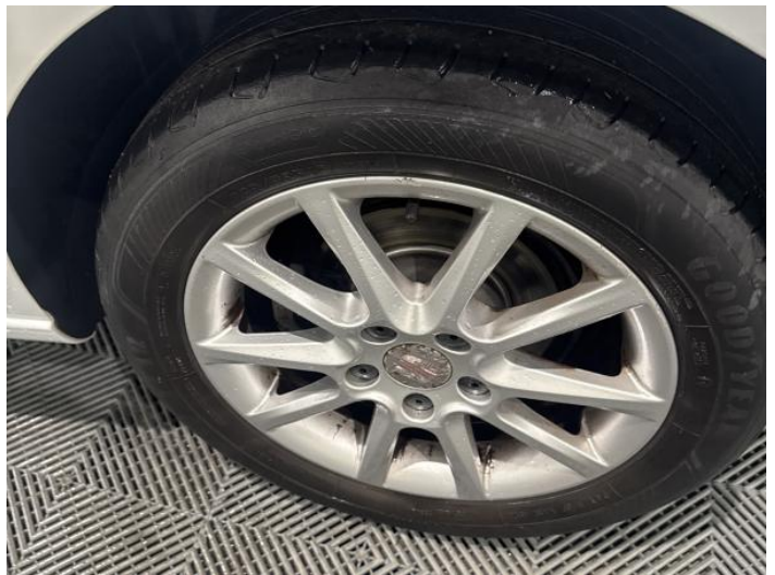
6: Wheel nsr Scratched Over 50mm