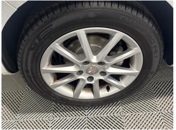
10: Wheel osr Scratched Up To 50mm