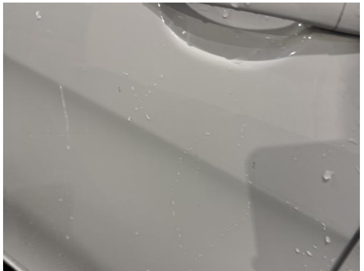
4: Door nsr Chipped 1 To 5