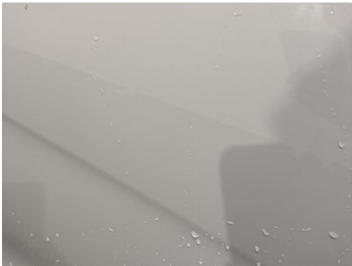
5: Door nsr Chipped 1 To 5