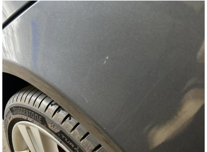
4: Qtr Panel nsr Chipped 1 To 5