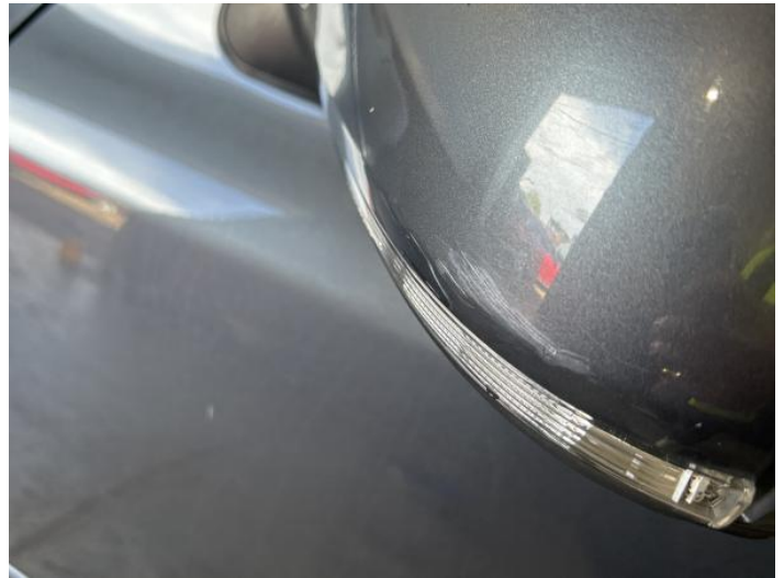
6: Door Mirror Assy nsf Scratched (Painted) UpTo 25mm Thru Paint