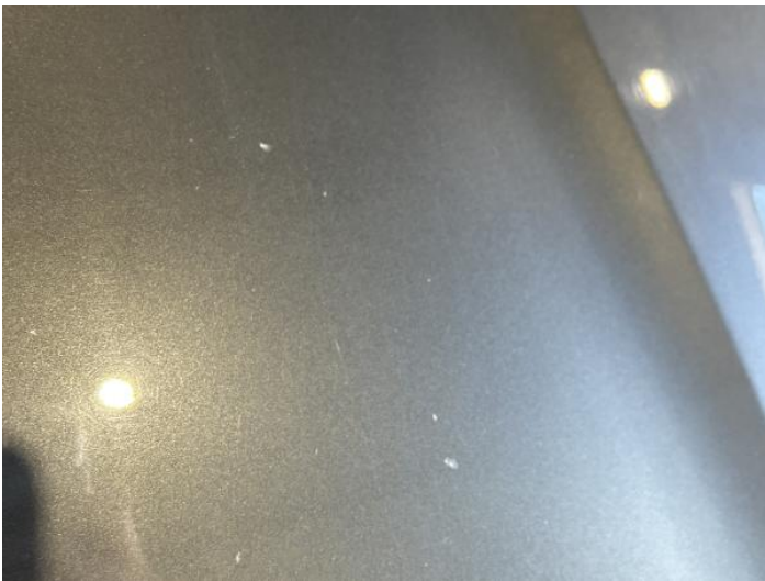
11: Bonnet Chipped 1 To 5