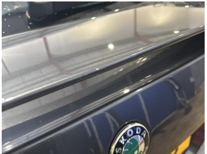
12: Spoiler Rear Scratched (Painted) UpTo 25mm Thru Paint