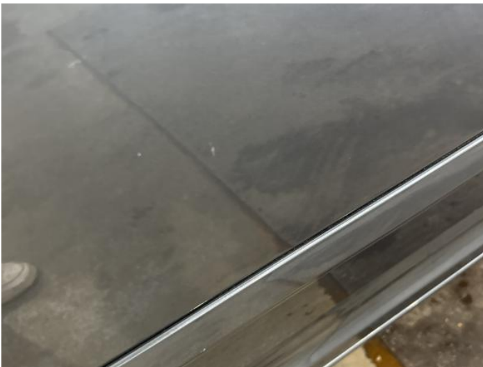
1: Door osf Chipped 1 To 5