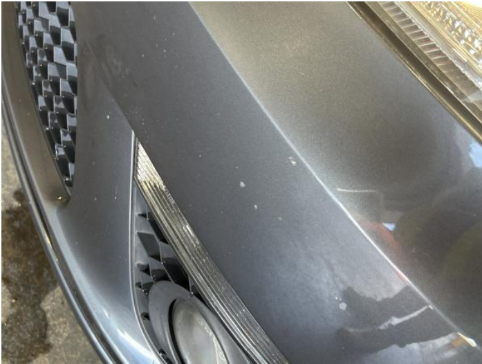
9: Bumper Front Chipped Multiple Chips