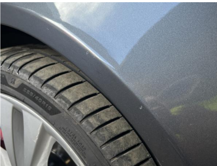
7: Wing nsf Chipped 1 To 5