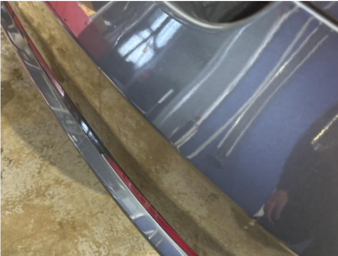
3: Bumper Rear Chipped 1 To 5