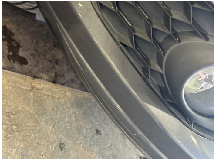
10: Bumper Front Scratched 25 to 100mm Thru Paint