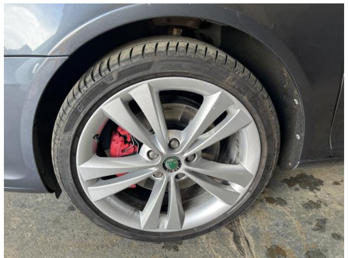
8: Wheel nsf Scratched Over 50mm