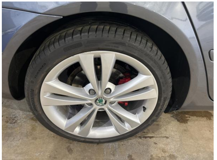
2: Wheel osr Scratched Up To 50mm