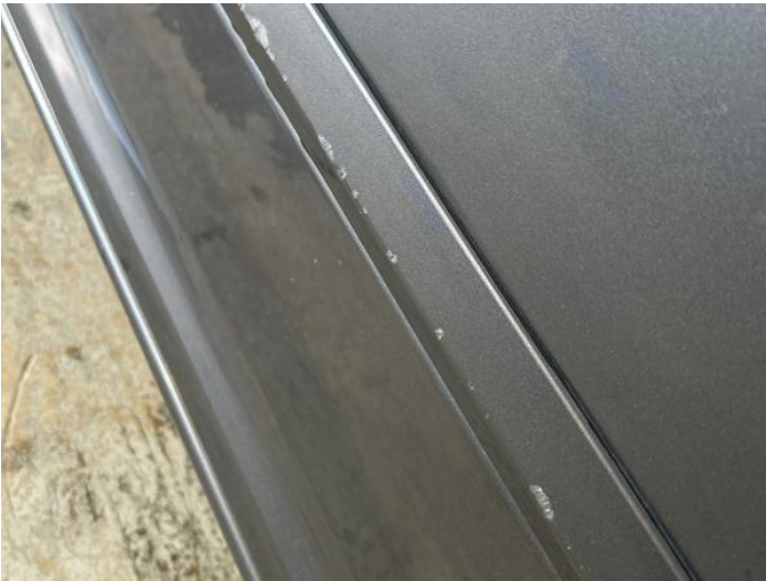
5: Door Moulding nsf Scratched (Painted) Over 25mm Thru Paint