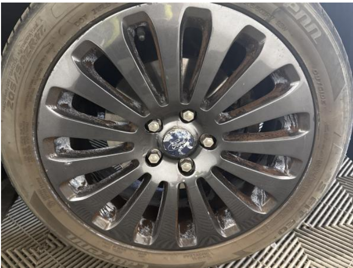
11: Wheel osf Scratched Over 50mm