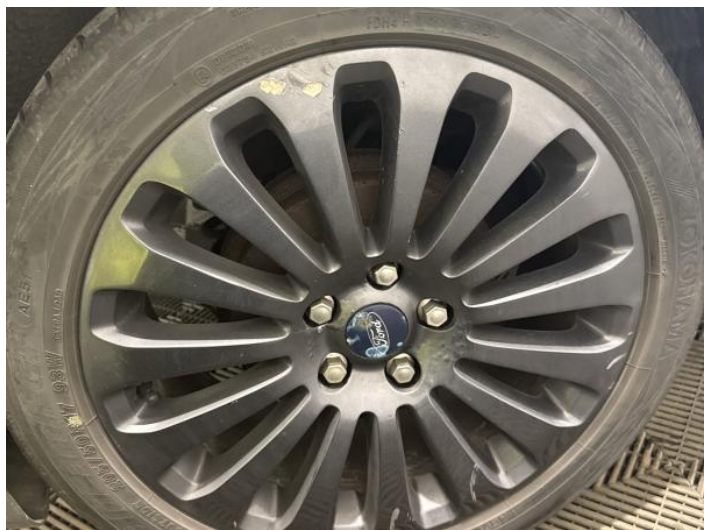
8: Wheel osr Scratched Over 50mm