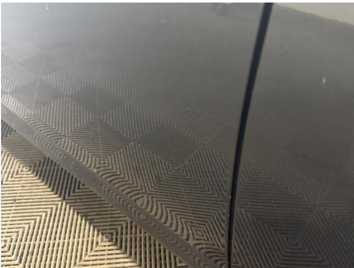
5: Door nsf Chipped Edge Chip