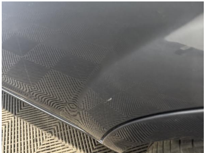
6: Door osr Scratched Up To 25mm Thru Paint