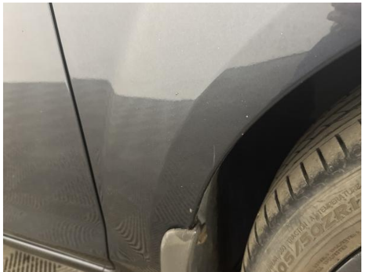
12: Wing osf Scratched UpTo 25mm Thru Paint