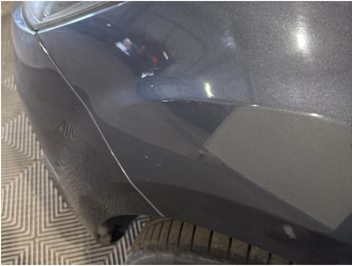
3: Wing nsf Chipped 1 To 5