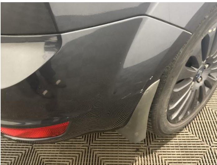
7: Bumper Rear Scratched 25 to 100mm Thru Paint