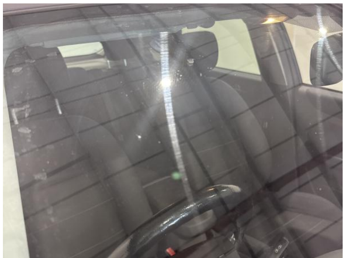
14: Screen Front Cracked Replace