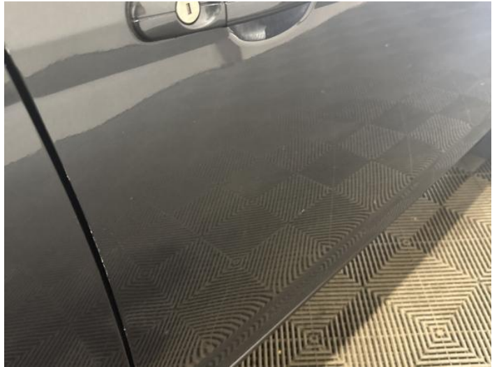
10: Door osf Chipped Multiple Chips