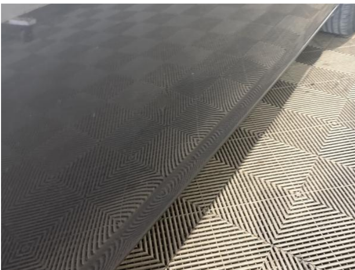
13: Door osf Dented Over 30mm