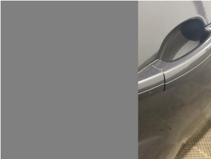
9: Door osr Chipped 1 To 5