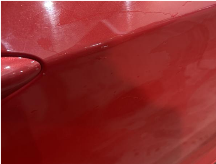
3: Door osf Chipped 1 To 5