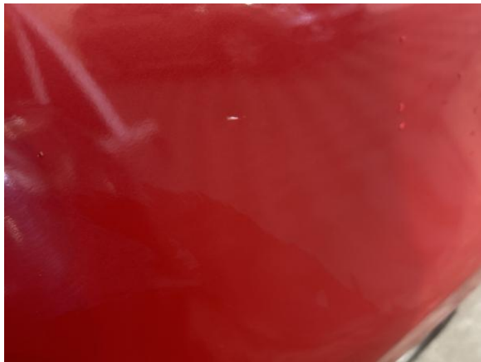
2: Wing osf Chipped 1 To 5