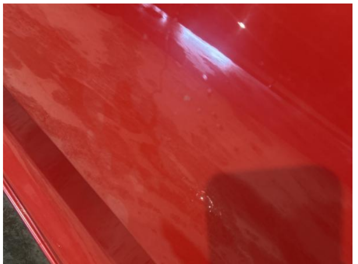
8: Door nsf Chipped 1 To 5