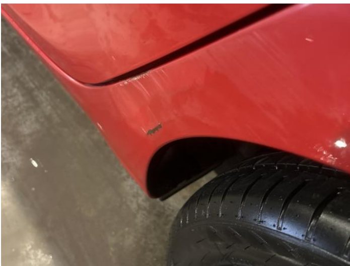
7: Qtr Panel nsr Dented With Paint Damage