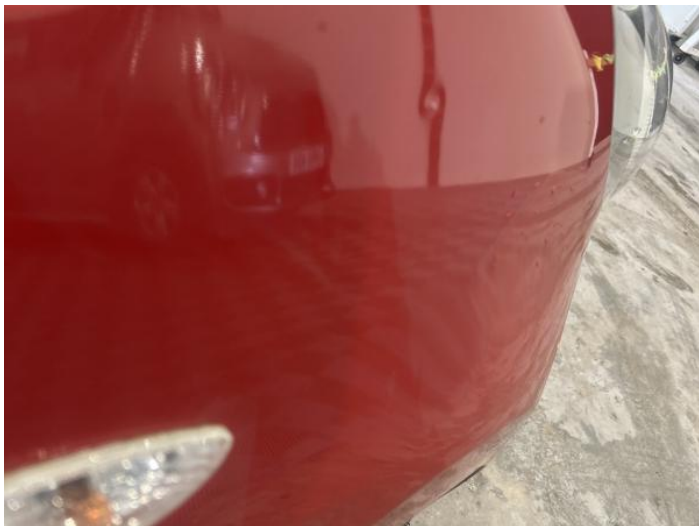
1: Wing osf Dented 2 Or Less UpTo 10mm