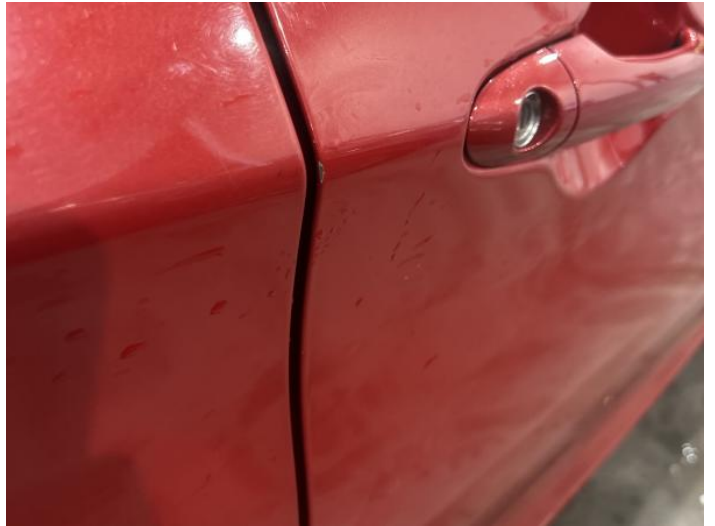
4: Door osf Chipped Edge Chip