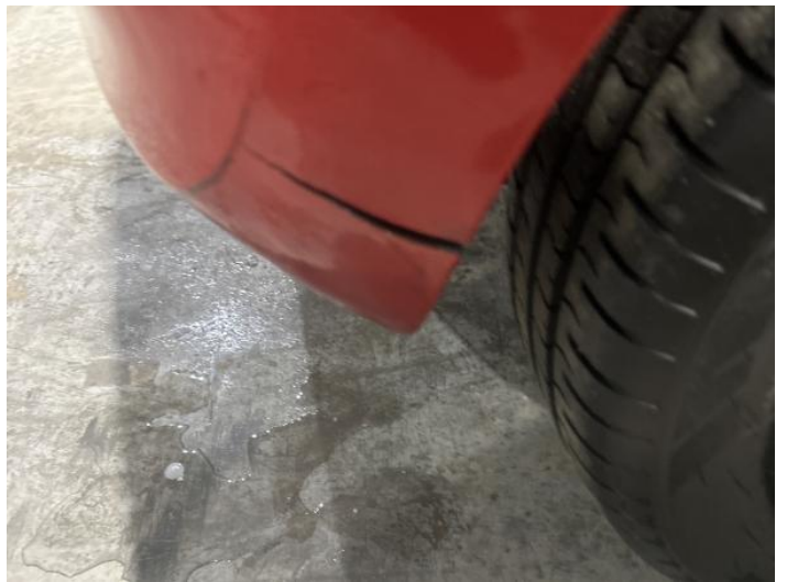
6: Bumper Rear Cracked Over 25mm