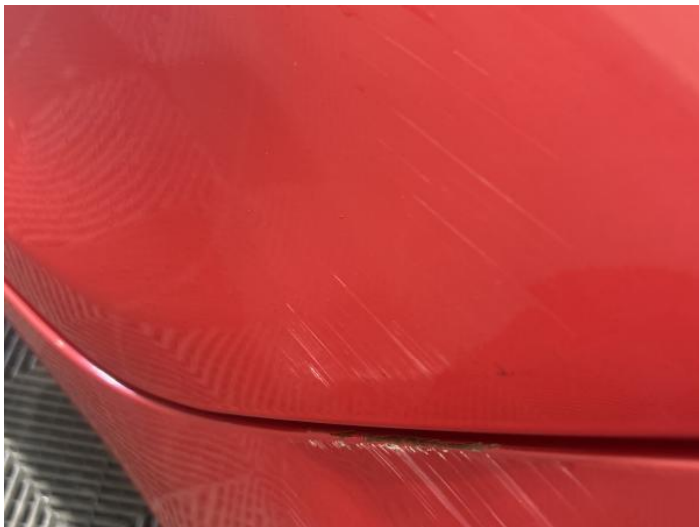
9: Door nsr Scratched Over 25mm Thru Paint