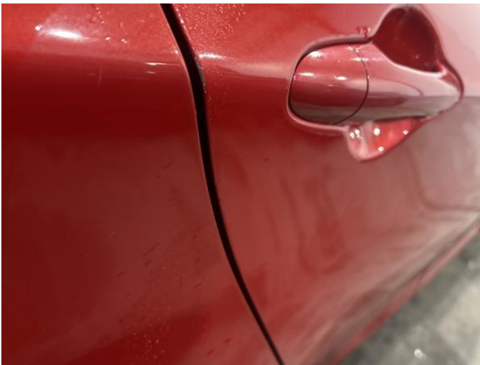
5: Door osr Chipped Edge Chip