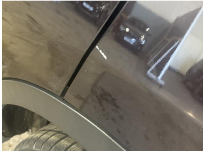
10: Qtr Panel nsr Scratched UpTo 25mm Thru Paint