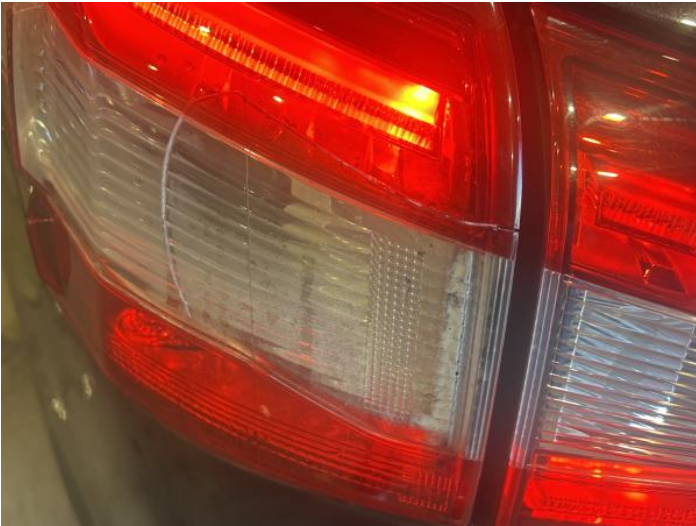
9: Lamp nsr Broken Replace