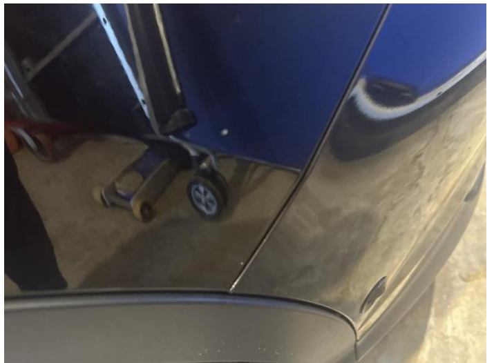
2: Wing osf Chipped 1 To 5