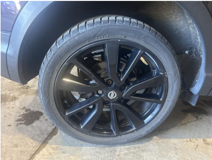
5: Wheel osr Scratched Over 50mm