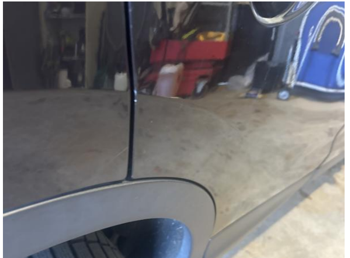
6: Door osr Chipped Edge Chip