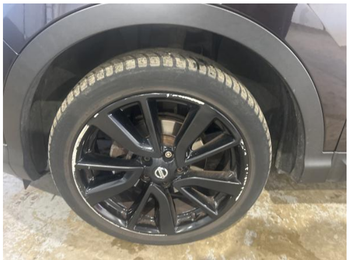
14: Wheel nsf Scratched Over 50mm