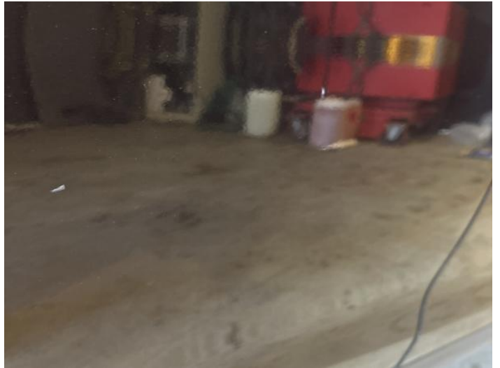
4: Door osr Chipped 1 To 5