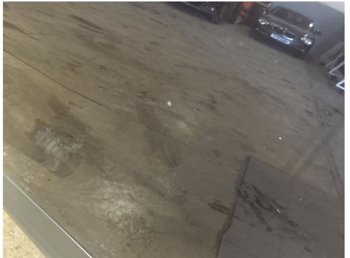
12: Door nsr Chipped 1 To 5