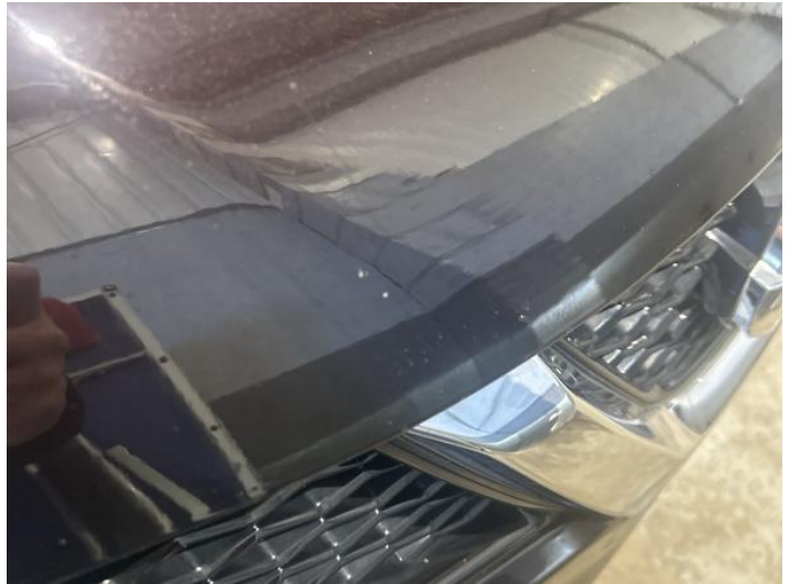
15: Bumper Front Poor Previous Repair Poor Paint