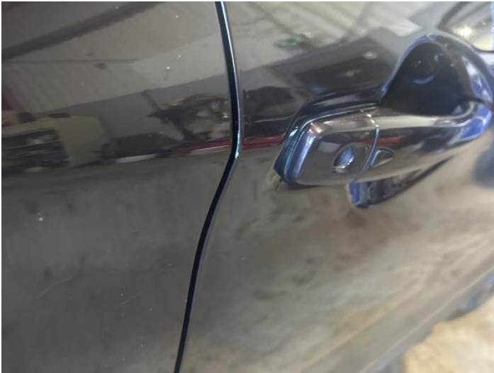
3: Door osf Chipped Edge Chip