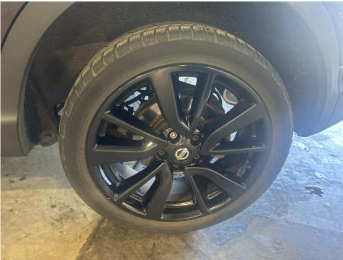
11: Wheel nsr Scratched Up To 50mm