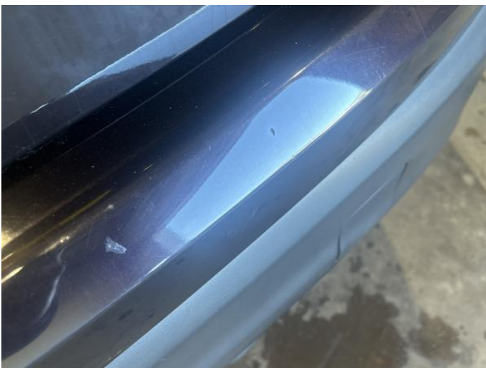
7: Bumper Rear Chipped Multiple Chips