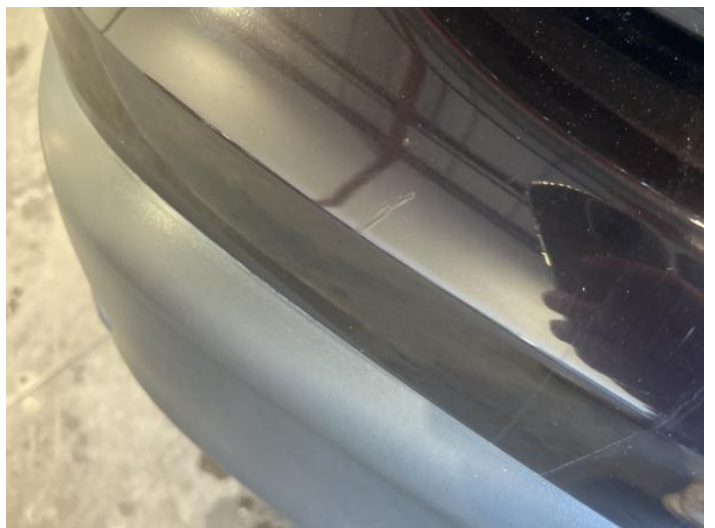
8: Bumper Rear Scratched Up To 25mm Thru Paint