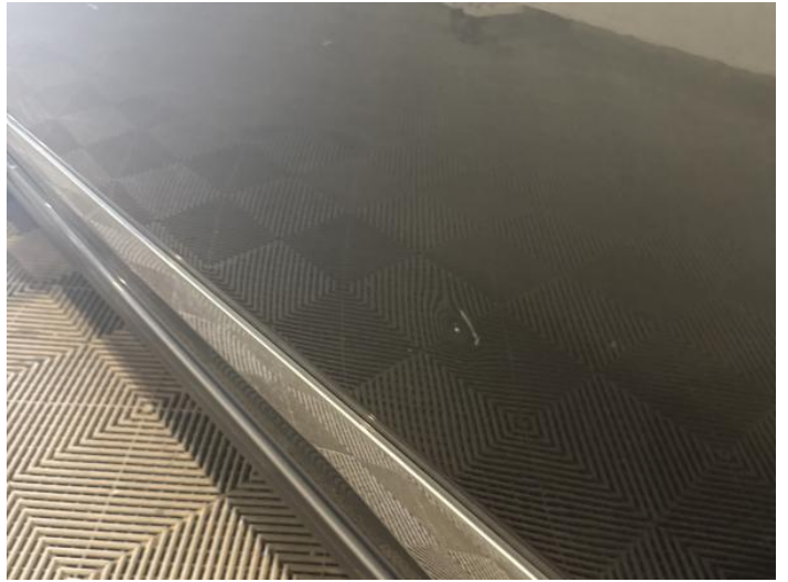
4: Door nsf Dented With Paint Damage