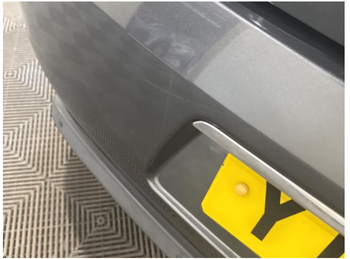
6: Bumper Rear Scratched 25 to 100mm Thru Paint