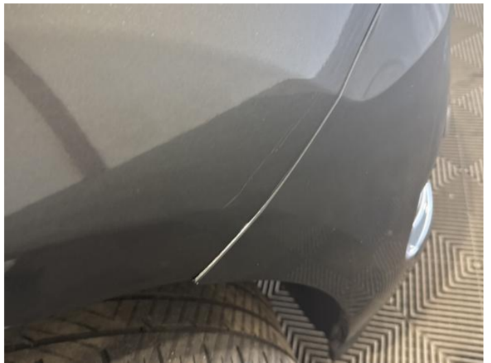
12: Wing osf Scratched Over 25mm Thru Paint