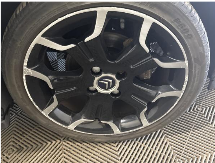
11: Wheel osf Scratched Over 50mm