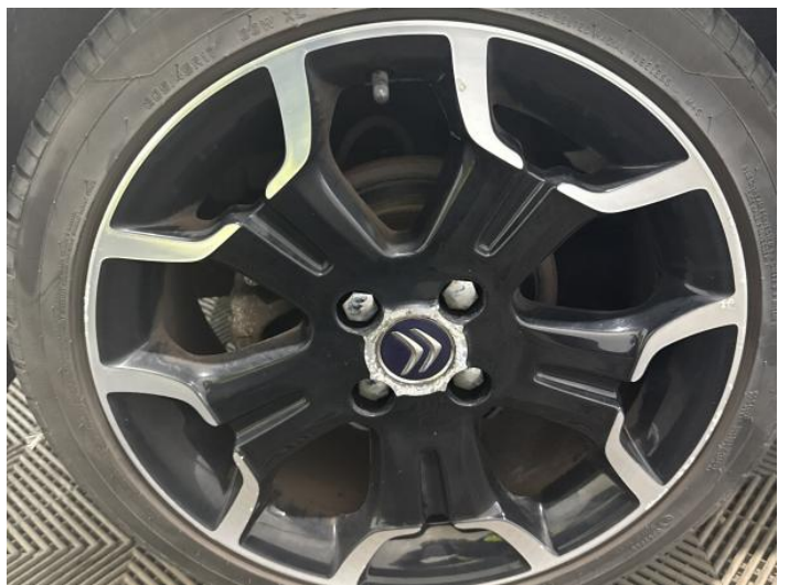
8: Wheel osr Scratched Over 50mm