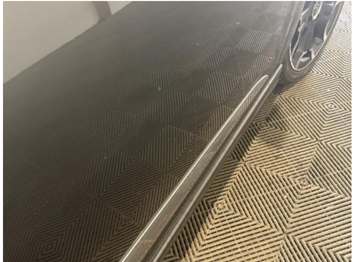
10: Door osf Chipped 1 To 5