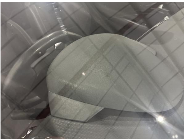
13: Screen Front Chipped UpTo 10mm