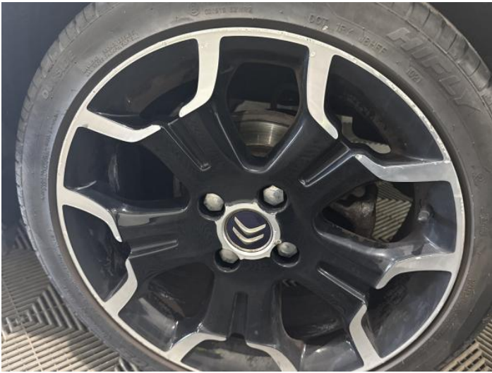
5: Wheel nsr Scratched Over 50mm