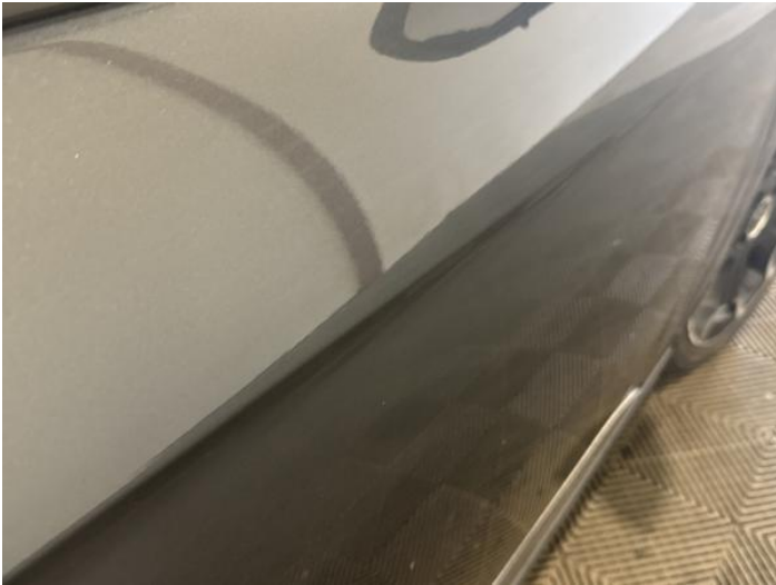
9: Door osf Dented Between 10mm + 30mm