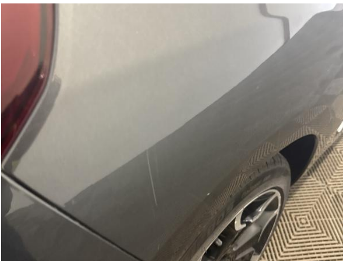
7: Qtr Panel osr Scratched Over 25mm Thru Paint