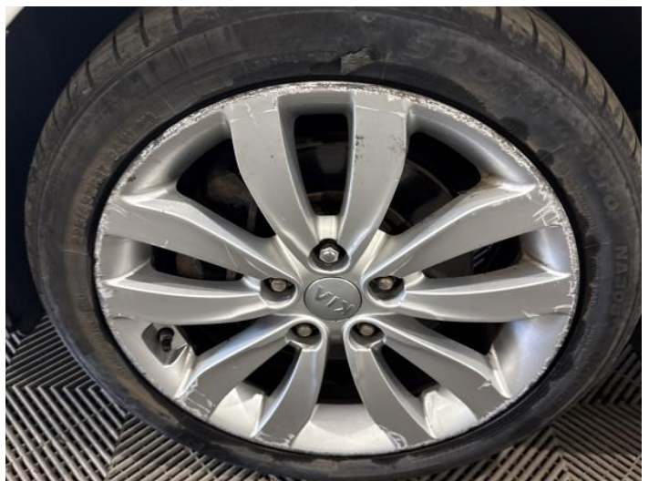
8: Wheel nsf Scratched Over 50mm