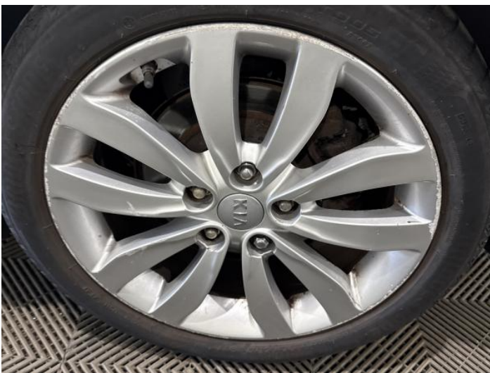
13: Wheel nsr Scratched Over 50mm