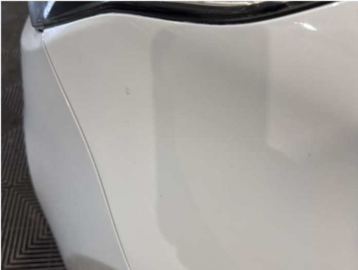
9: Wing nsf Chipped Over 5mm