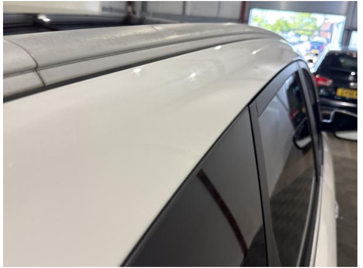
16: B Post os Dented Over 30mm