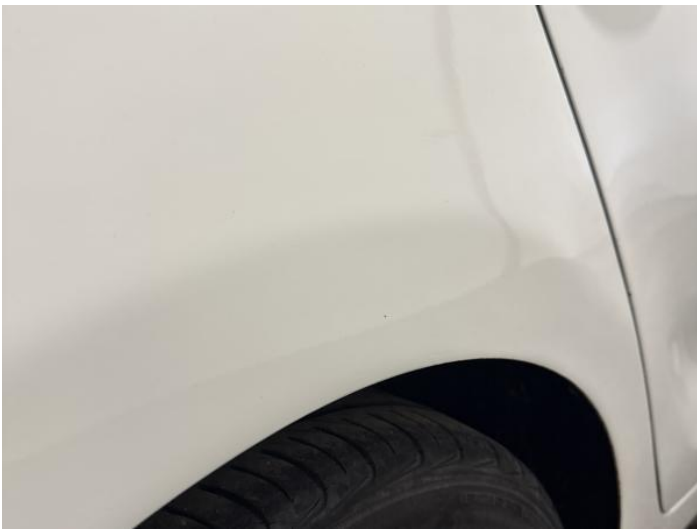
17: Qtr Panel osr Rusted Over 5mm