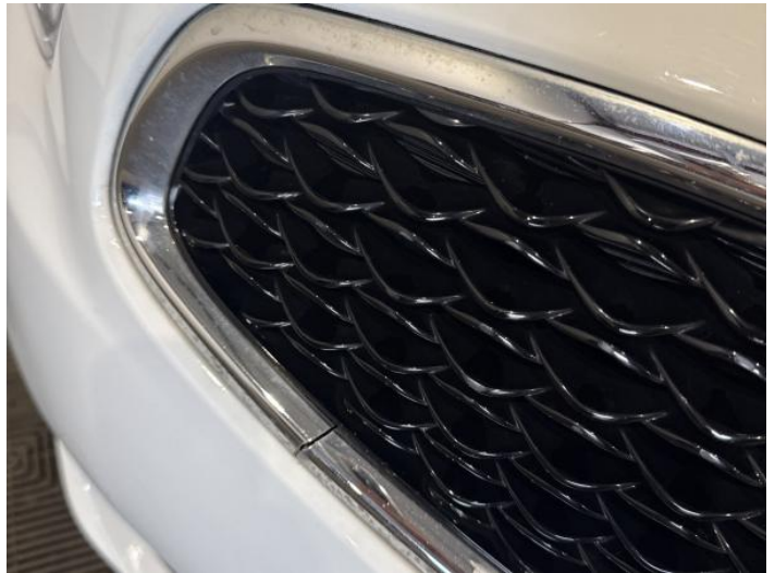
6: Bumper Front Grill Broken Replace