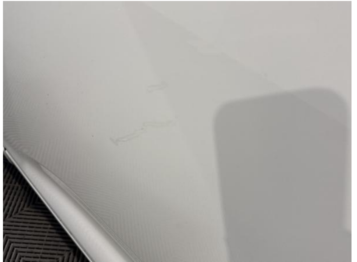
10: Door nsf Dented With Paint Damage