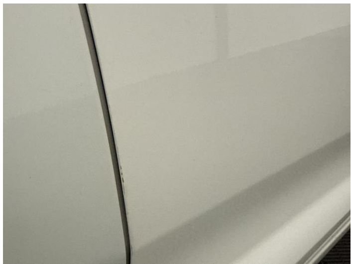
20: Door osf Chipped Edge Chip