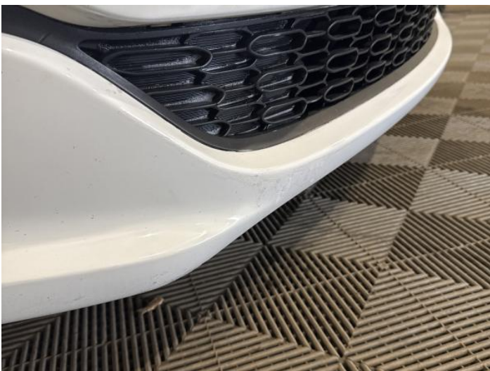
7: Bumper Front Scratched 25 to 100mm Thru Paint