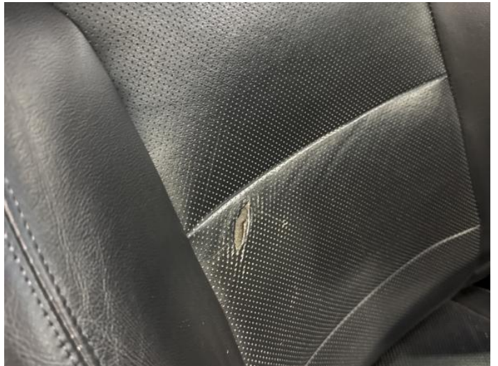
2: Seat Back Cover osf Torn Over 3mm