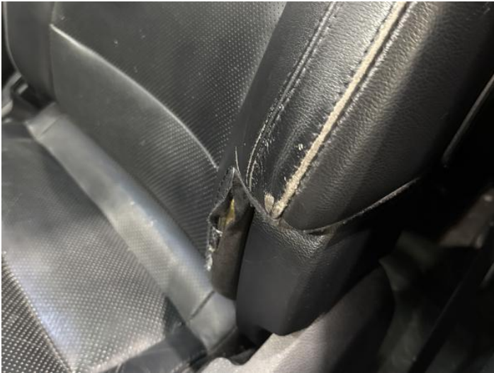
3: Seat Back Cover nsf Torn Over 3mm