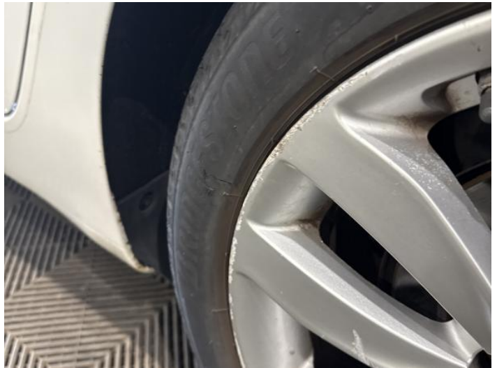
24: Tyre nsr Damaged Replace