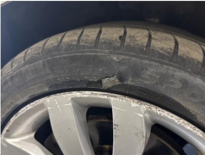
23: Tyre nsf Damaged Replace