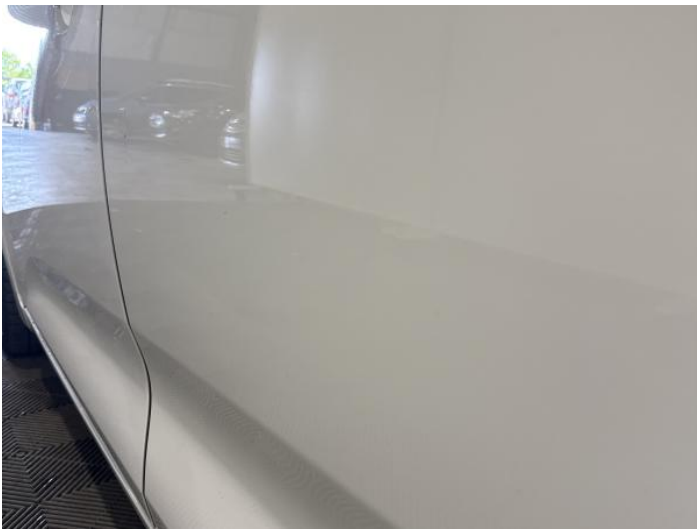
11: Door nsr Dented With Paint Damage