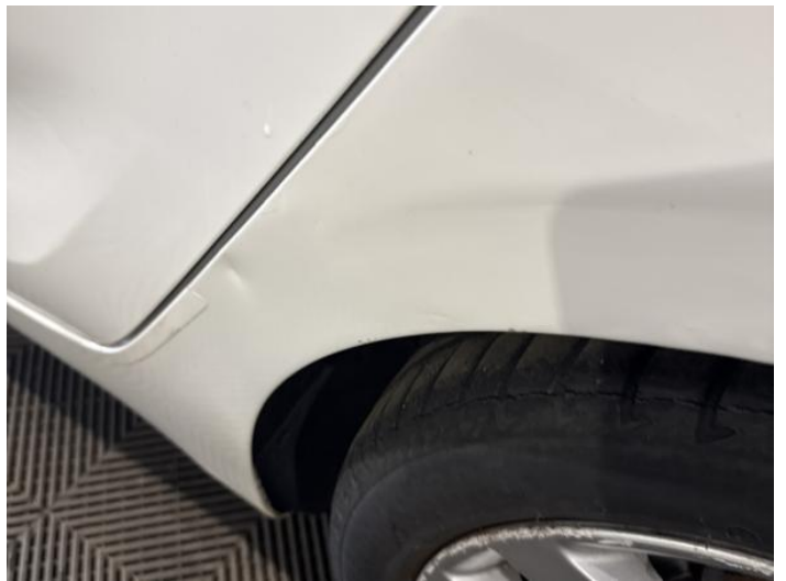
12: Qtr Panel nsr Dented With Paint Damage