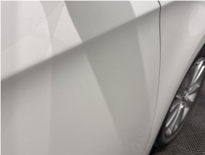
21: Door osf Dented Between 10mm + 30mm