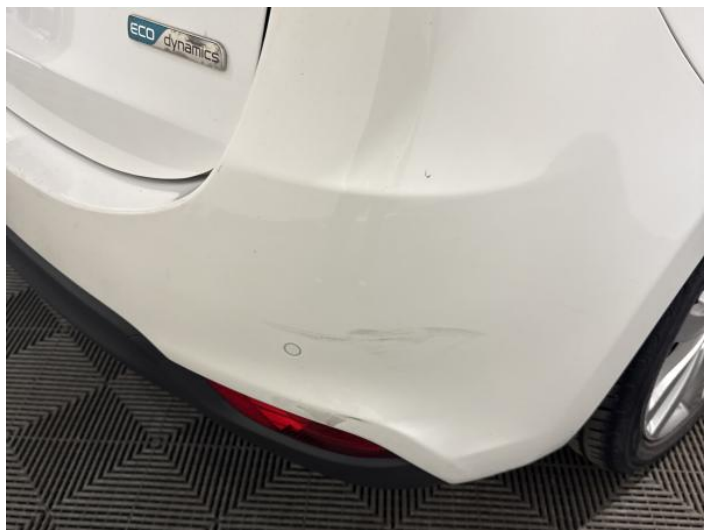
14: Bumper Rear Scratched Over 100mm Thru Paint