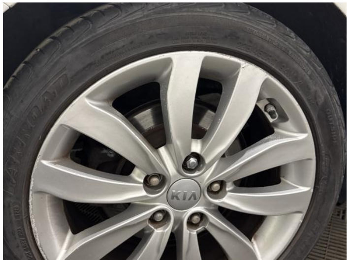
18: Wheel osr Scratched Over 50mm