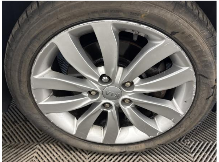
22: Wheel osf Scratched Over 50mm