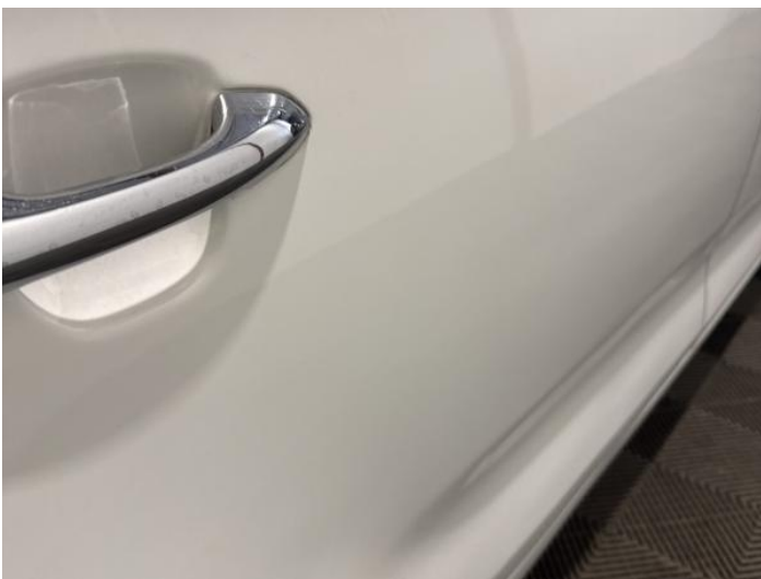
19: Door osr Poor Previous Repair Rippled UpTo 30%