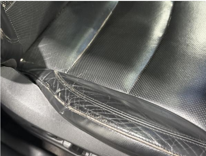
1: Seat Back Cover osf Scuffed Over 25mm