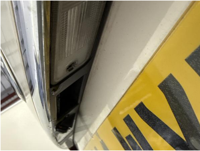
15: Other N/A N/A