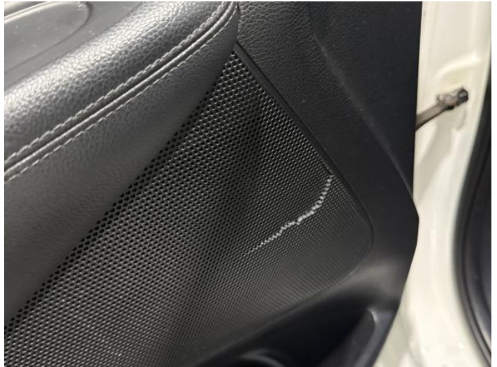
4: Door Pad nsf Broken Replace