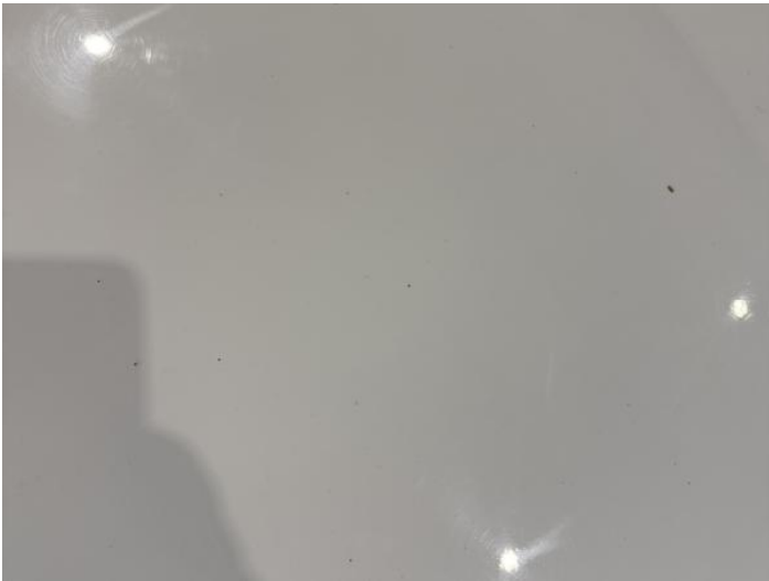
5: Bonnet Chipped Multiple Chips