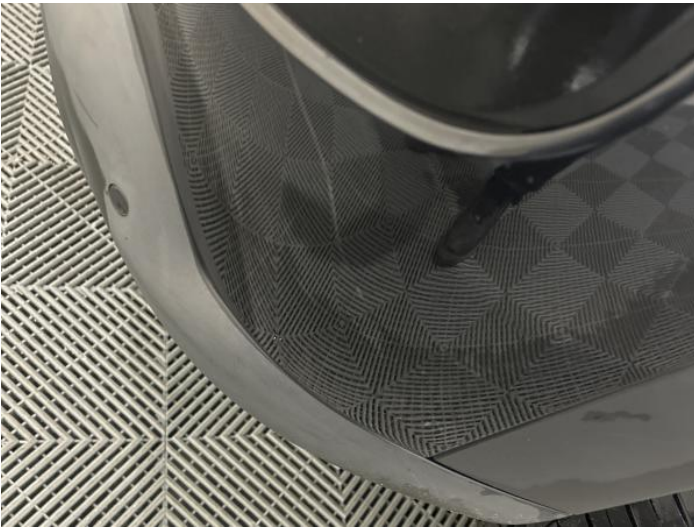
5: Bumper Rear Scratched Over 25mm Not Thru Paint