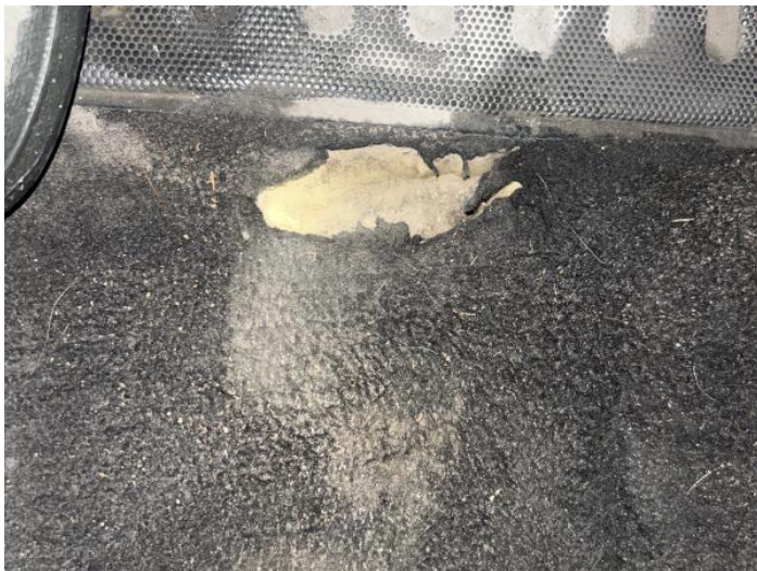
1: Carpets Front Holed Over 3mm