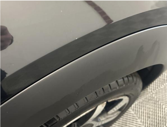
3: Wing osf Chipped 1 To 5