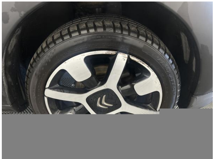
2: Wheel osf Scratched Over 50mm