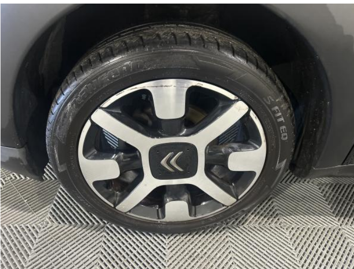
7: Wheel nsf Scratched Over 50mm