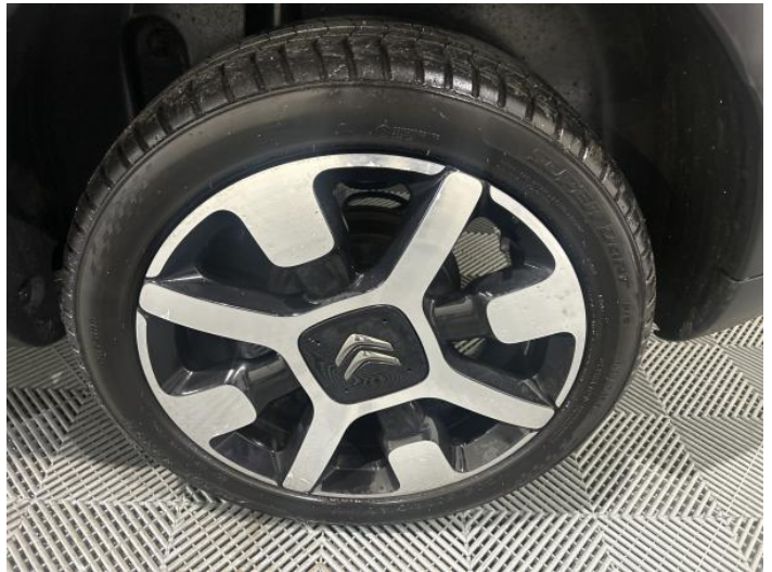
6: Wheel nsr Scratched Up To 50mm