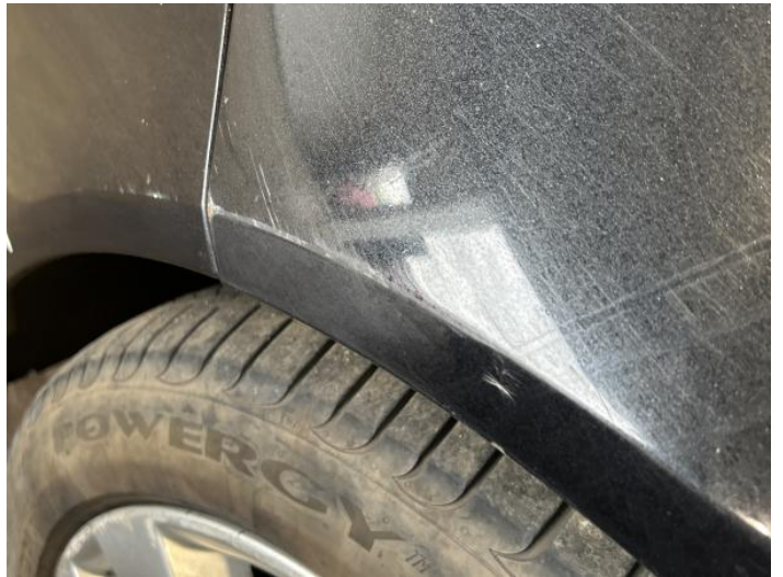
12: Wing nsf Scratched Over 25mm Thru Paint