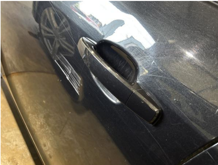
11: Door nsf Dented With Paint Damage