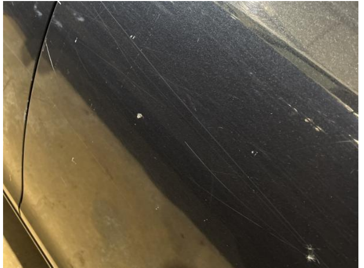
10: Door nsf Chipped Multiple Chips