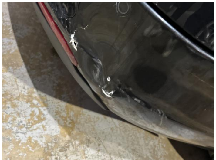
6: Bumper Rear Dented With Paint Damage