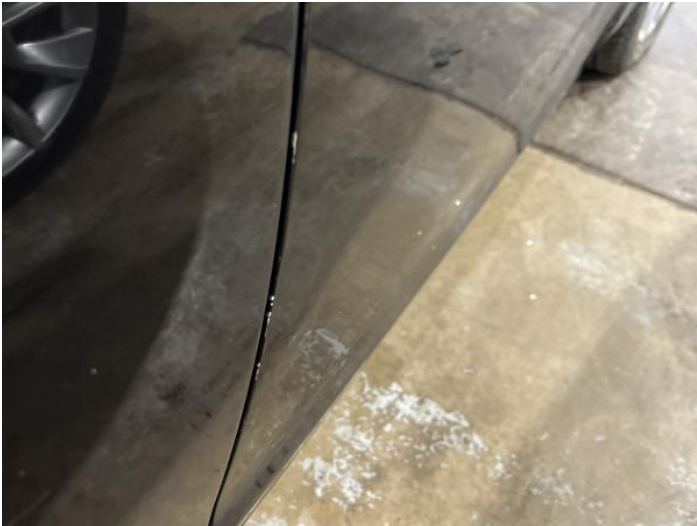
3: Door osf Chipped Edge Chip