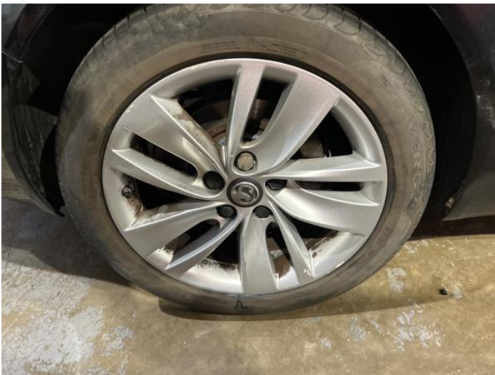
5: Wheel osr Scratched Over 50mm