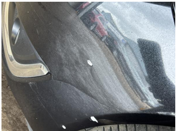
14: Bumper Front Scratched Over 100mm Thru Paint