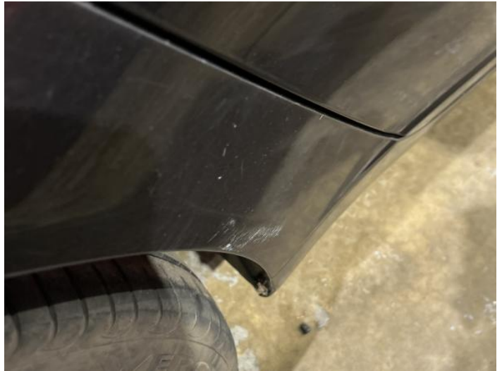
4: Qtr Panel osr Dented With Paint Damage