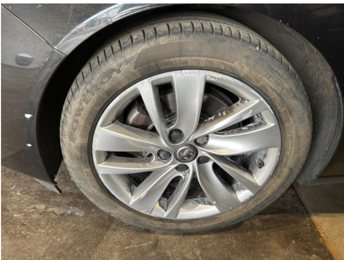
13: Wheel nsf Scratched Over 50mm