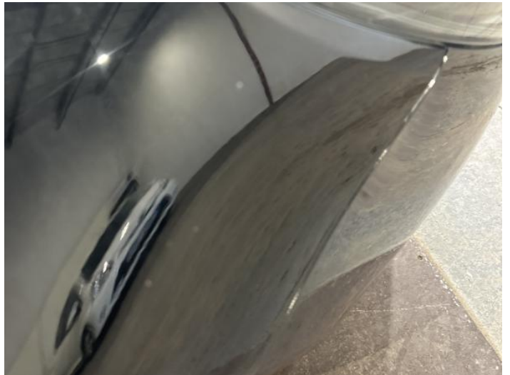
2: Wing osf Chipped 1 To 5