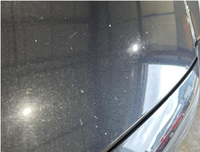
15: Bonnet Chipped Multiple Chips