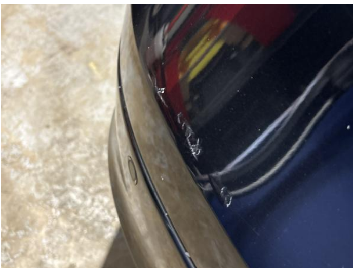
7: Tailgate Scratched Over 25mm Thru Paint