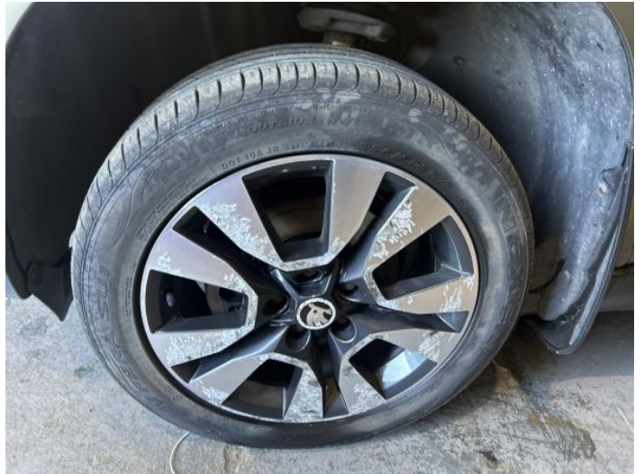
10: Wheel nsf Corroded Light