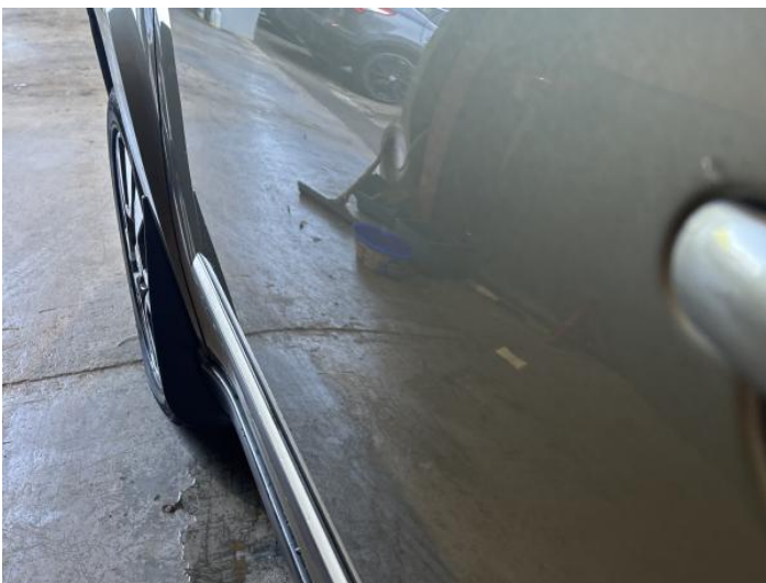
7: Door nsf Dented Over 2 UpTo 10mm