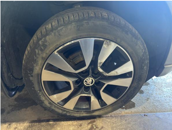
1: Wheel osf Corroded Light