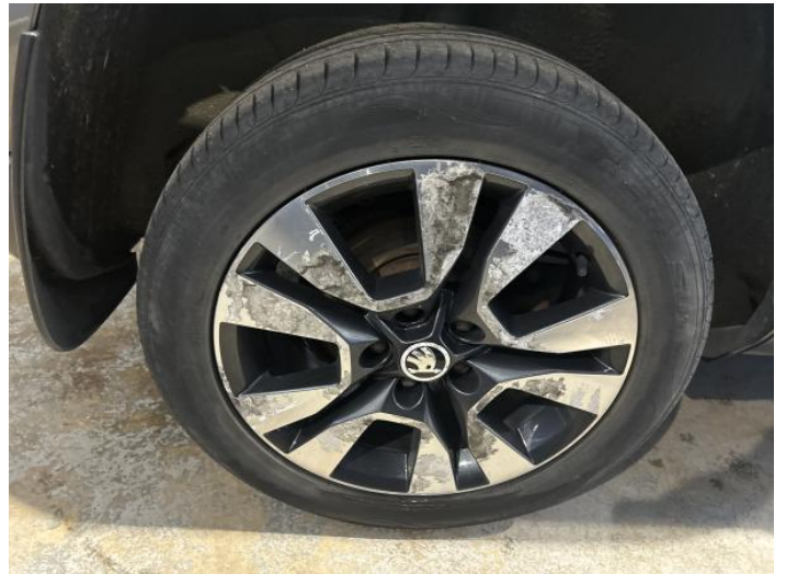
2: Wheel osr Corroded Light