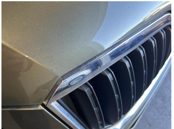
12: Bonnet Chipped 1 To 5