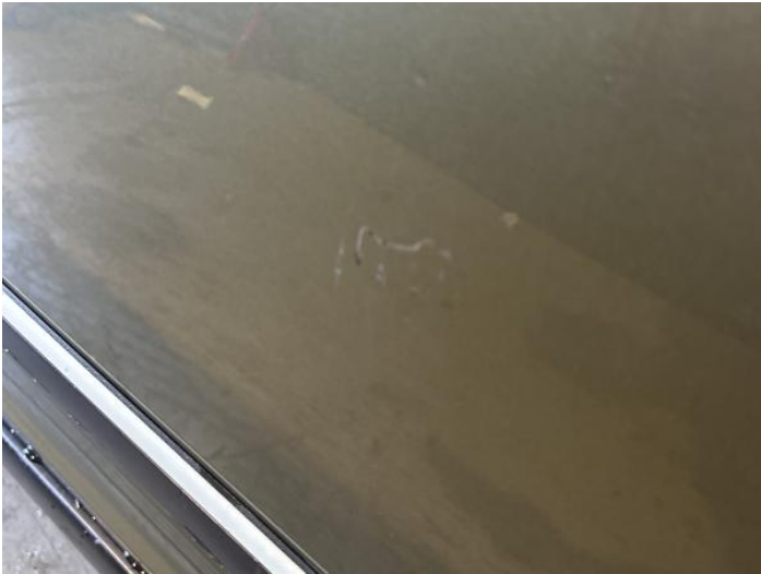
9: Door nsf Scratched UpTo 25mm Thru Paint