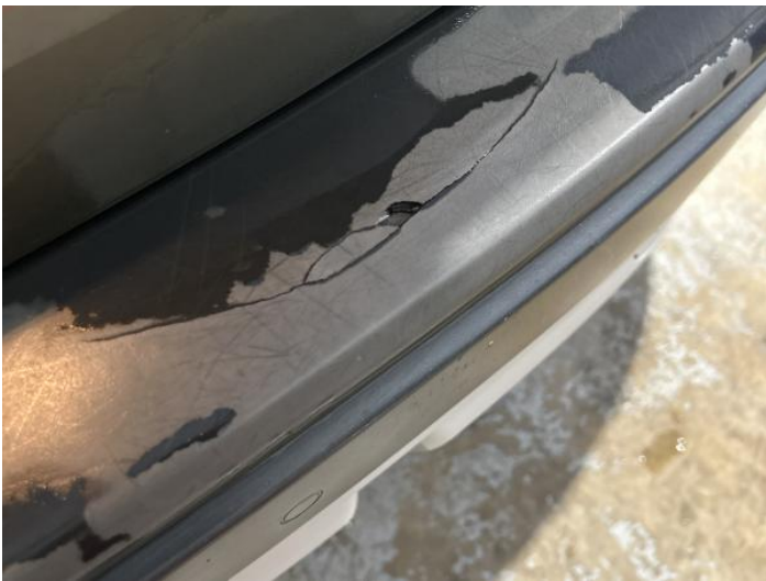
5: Bumper Rear Moulding Broken Replace