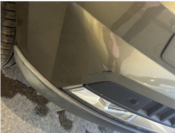
11: Bumper Front Scratched Over 100mm Thru Paint