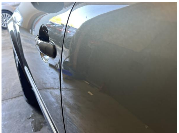
8: Door nsr Dented 2 Or Less UpTo 10mm