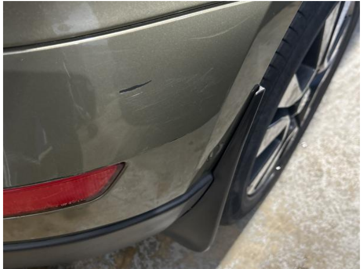
4: Bumper Rear Scratched 25 to 100mm Thru Paint