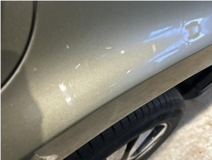
3: Qtr Panel osr Chipped 1 To 5