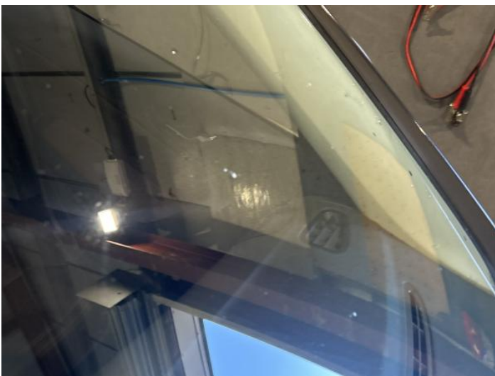
13: Screen Front Chipped UpTo 10mm