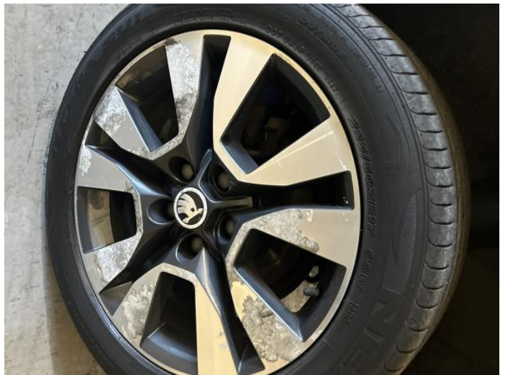
6: Wheel nsr Corroded Light