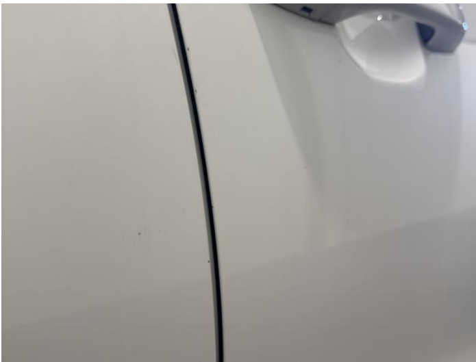
11: Door osf Chipped Edge Chip