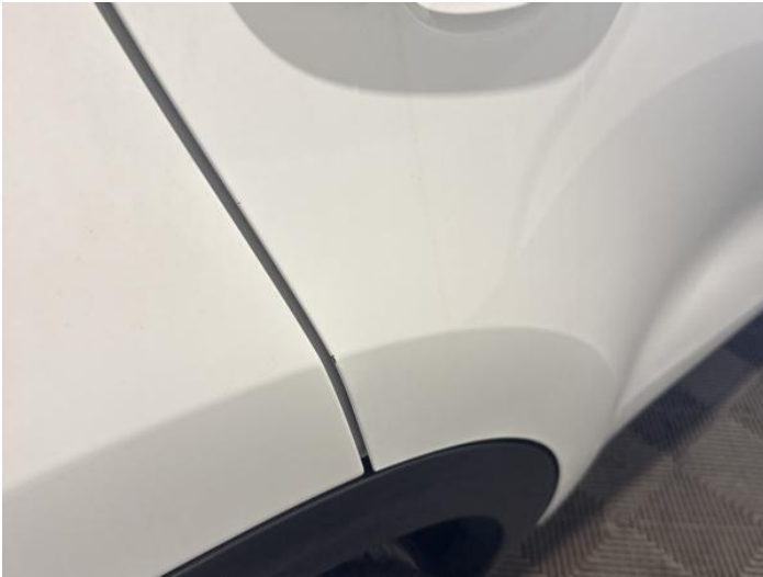
9: Door osr Chipped Edge Chip