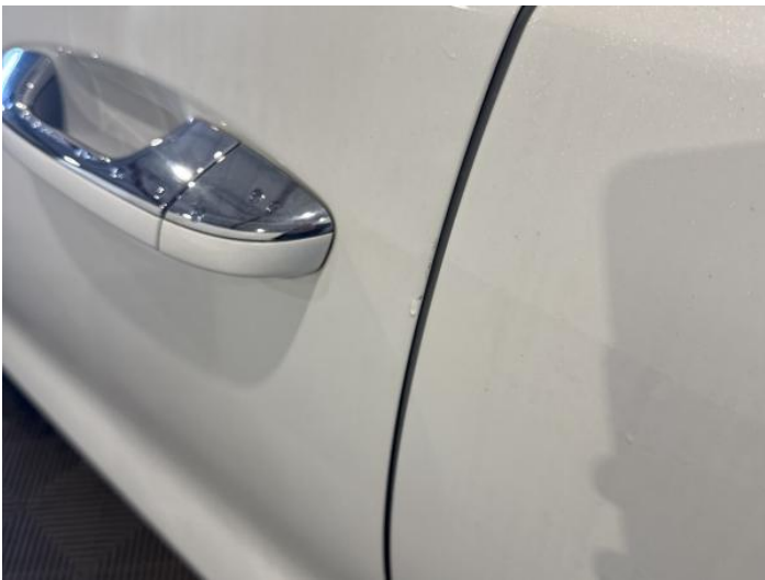
5: Door nsf Chipped Edge Chip