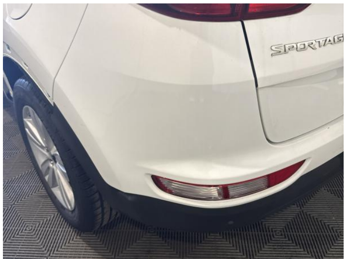
8: Bumper Rear Scratched 25 to 100mm Thru Paint