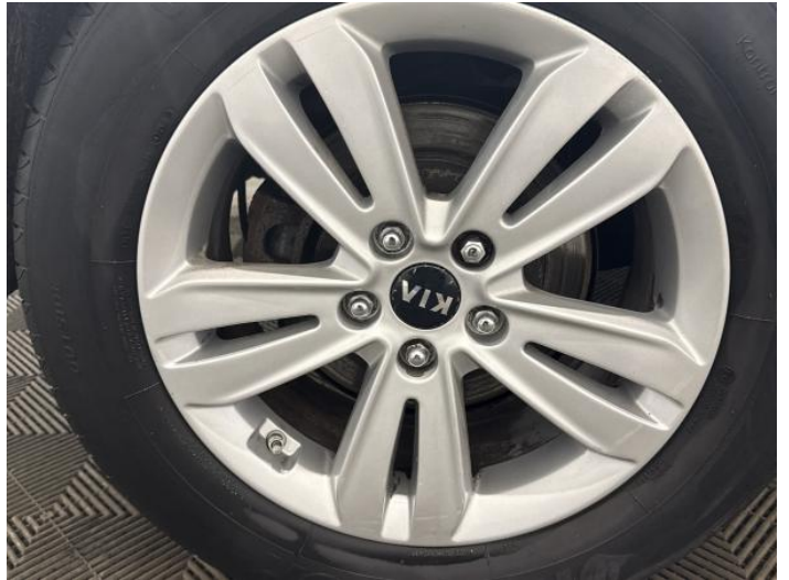
10: Wheel osr Scratched Up To 50mm