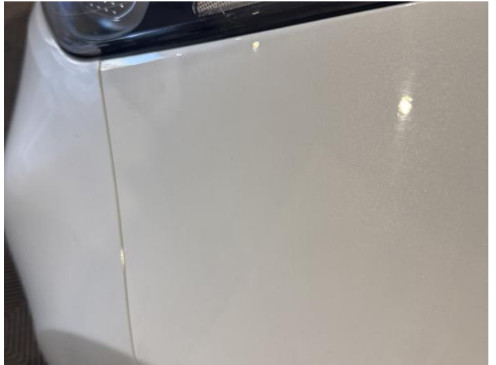
4: Wing nsf Chipped 1 To 5