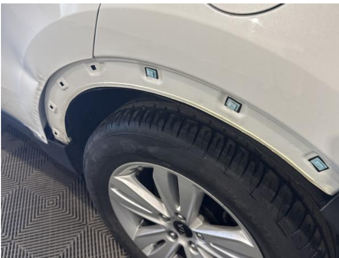
7: Qtr Panel Arch Extension ns Missing Replace