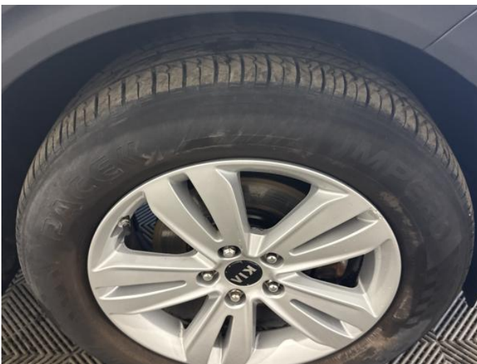
13: Wheel osf Scratched Over 50mm