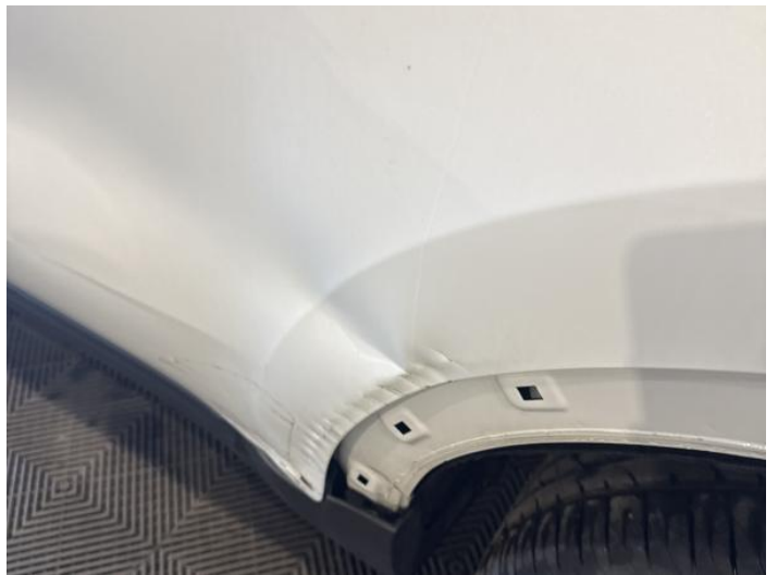
6: Door nsr Dented With Paint Damage