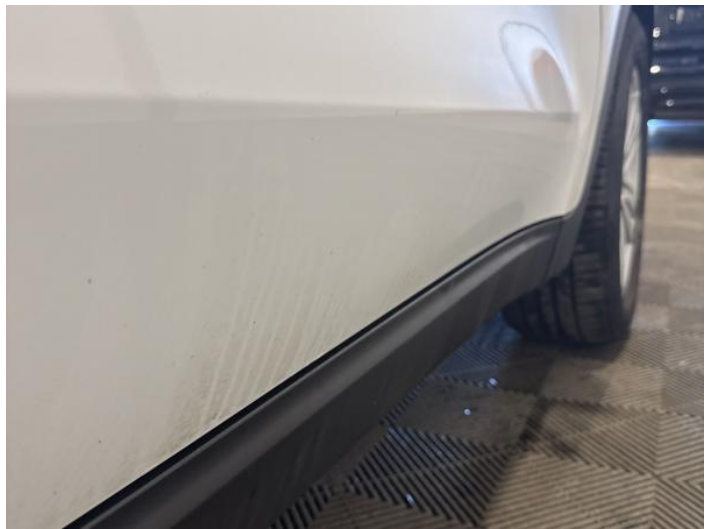
12: Door osf Dented 2 Or Less UpTo 10mm