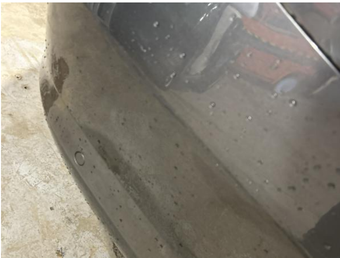
5: Bumper Rear Scratched 25 to 100mm Thru Paint