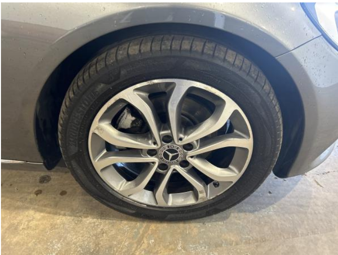
1: Wheel of Corroded Light