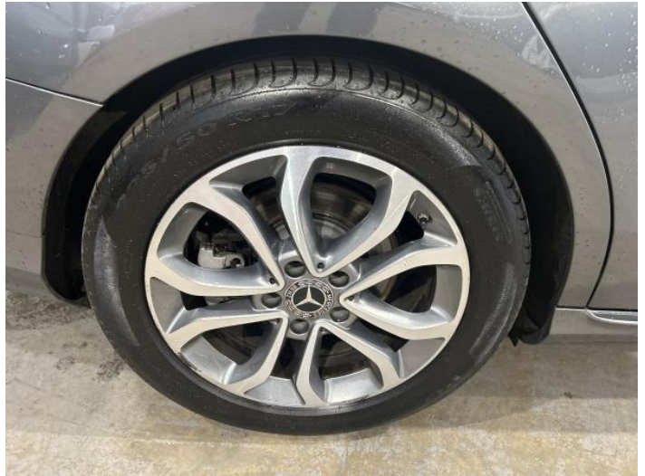
4: Wheel osr Corroded Light