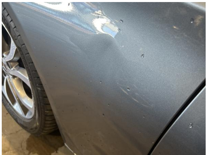
8: Wing nsf Dented Over 30mm