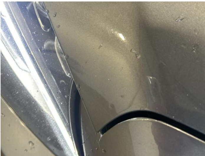
11: Bonnet Chipped 1 To 5