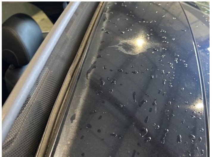
12: Other N/A N/A