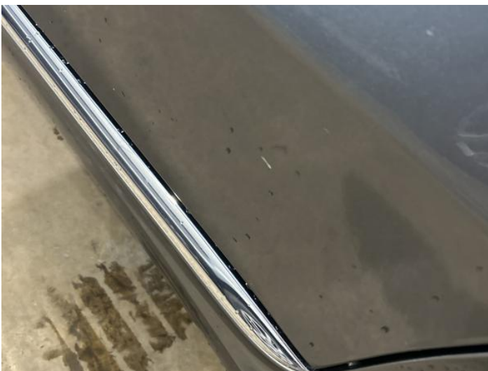
7: Door nsr Chipped 1 To 5