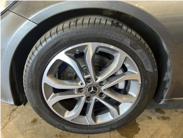
9: Wheel nsf Corroded Light