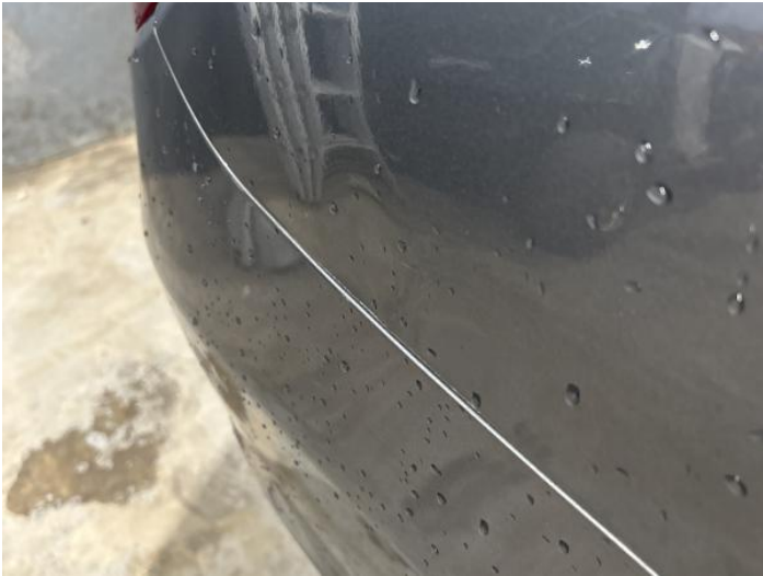
3: Qtr Panel osr Dented Over 30mm