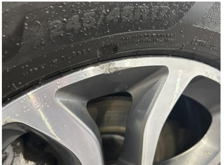
2: Tyre of Damaged Replace