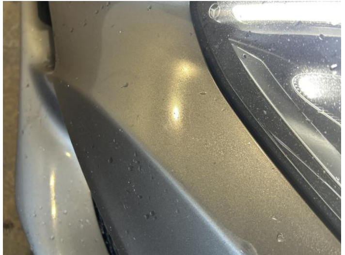
10: Bumper Front Poor Previous Repair Poor Paint