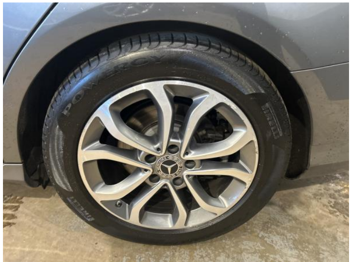
6: Wheel nsr Corroded Light