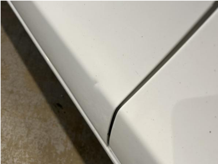
9: Door nsf Dented 2 Or Less UpTo 10mm