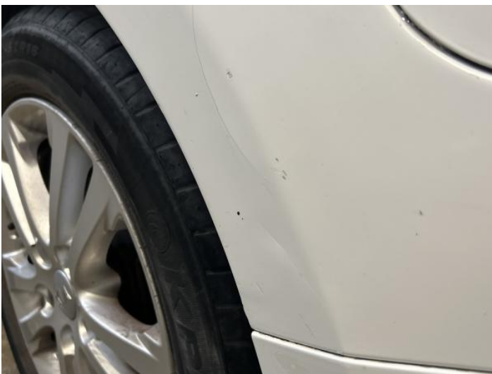
7: Qtr Panel nsr Dented With Paint Damage