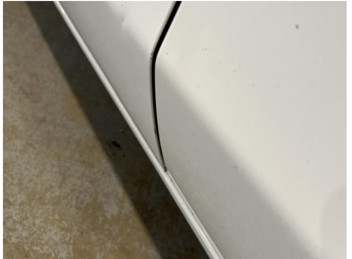
10: Door nsf Chipped Edge Chip