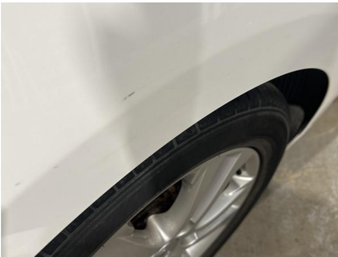
5: Qtr Panel osr Scratched UpTo 25mm Thru Paint