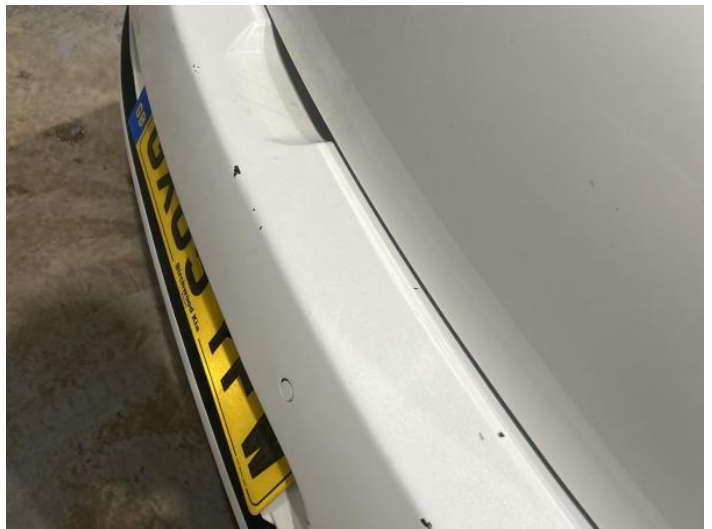
6: Bumper Rear Scratched Over 100mm Thru Paint