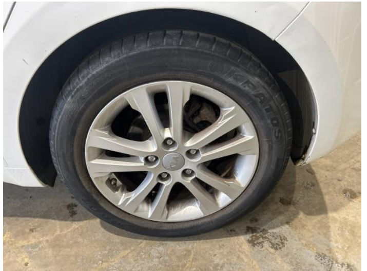
12: Wheel nsr Scratched Over 50mm