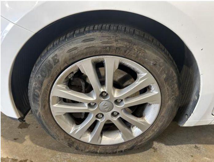
11: Wheel nsf Scratched Over 50mm