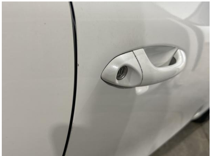
2: Door of Chipped Edge Chip