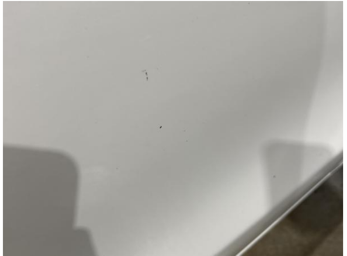
4: Door osr Chipped 1 To 5