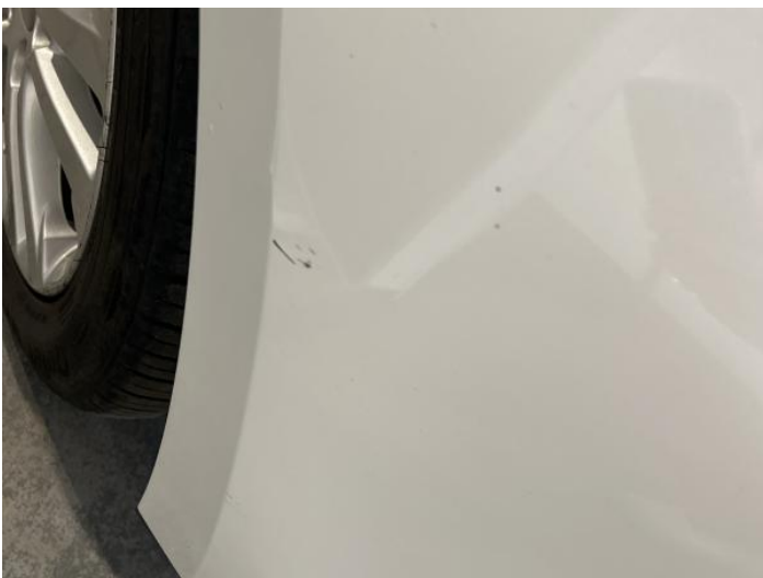
13: Bumper Front Chipped Multiple Chips