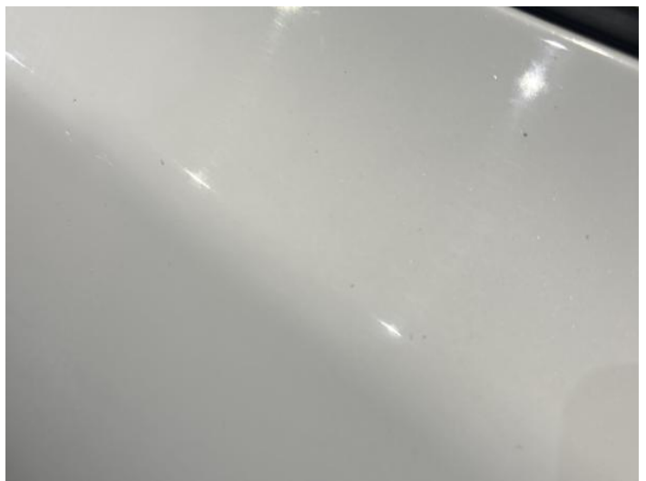
8: Door nsr Chipped 1 To 5