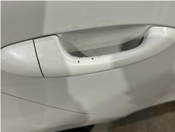
3: Other N/A N/A