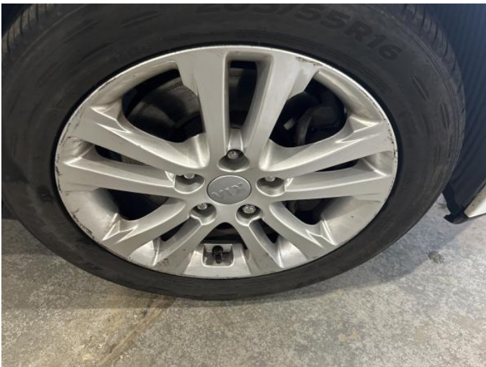
1: Wheel of Scratched Over 50mm