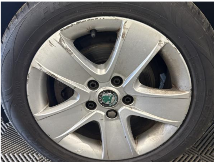
5: Wheel nsf Scratched Over 50mm