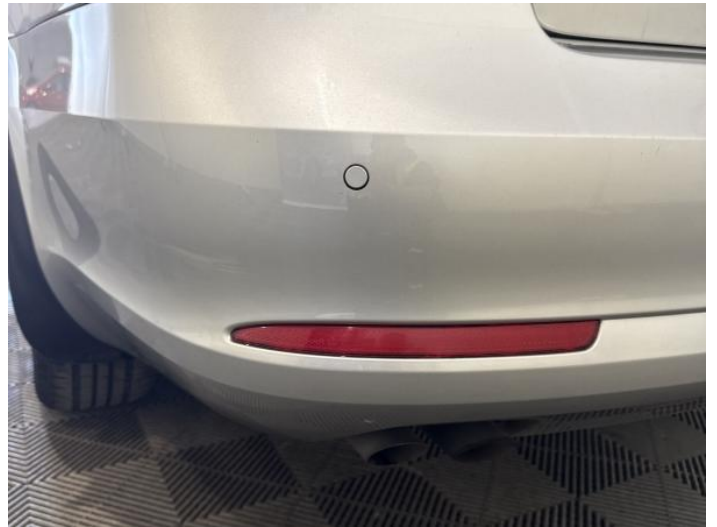
12: Bumper Front Scratched 25 to 100mm Thru Paint