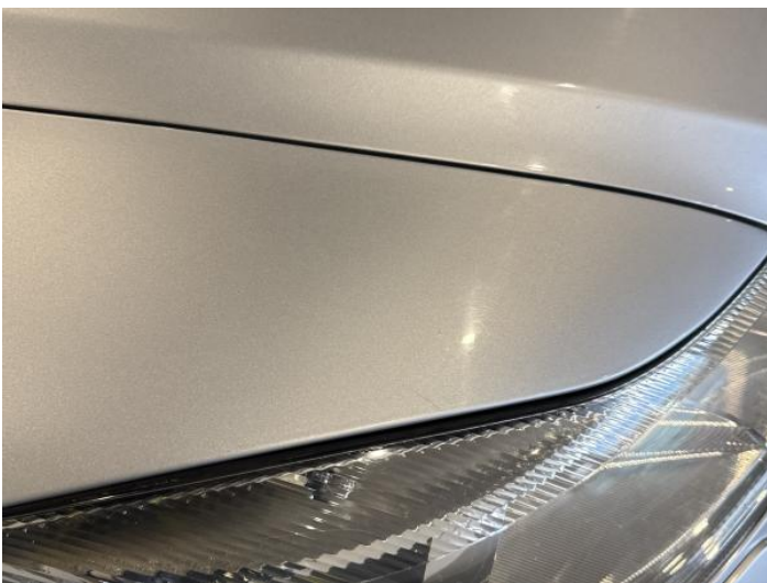
19: Wing osf Chipped 1 To 5