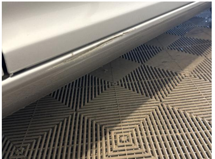
18: Sill ns Dented With Paint Damage