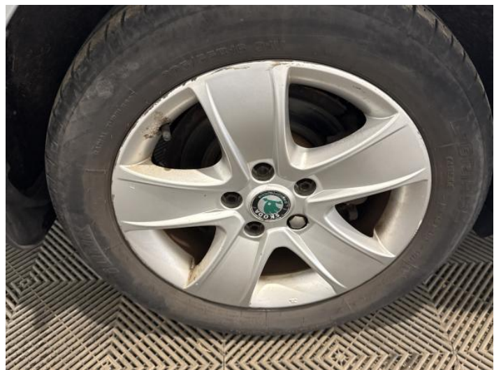
14: Wheel osr Scratched Over 50mm