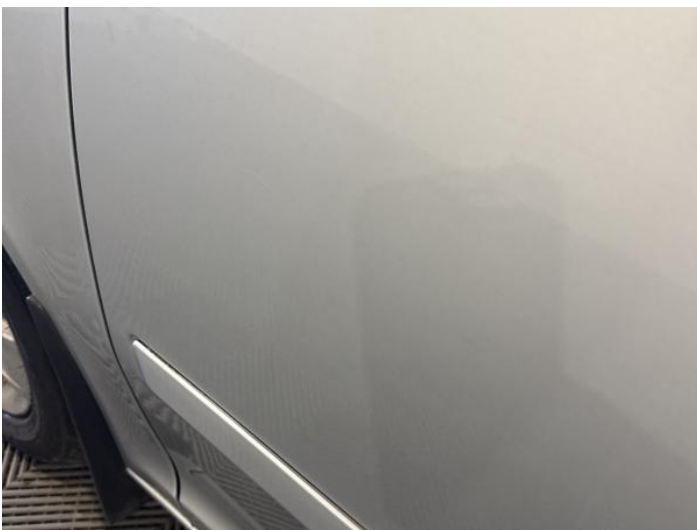
7: Door nsf Scratched Over 25mm Thru Paint