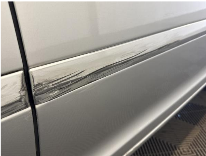
17: Door Moulding osf Scratched (Painted) Over 25mm Thru Paint