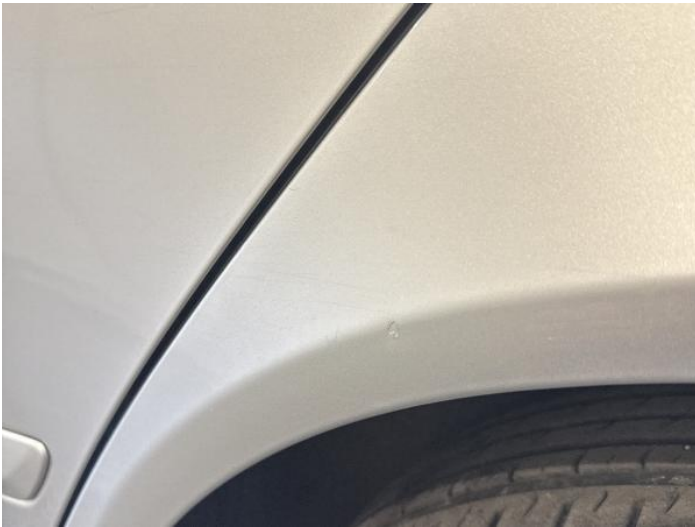
11: Qtr Panel nsr Chipped Over 5mm