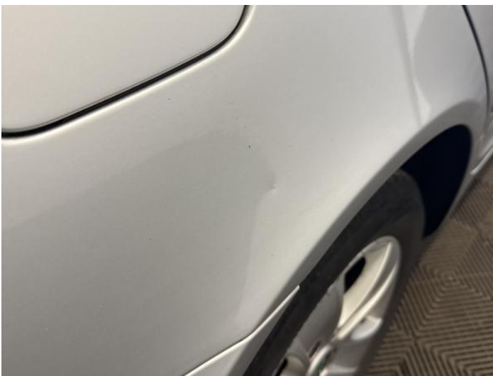
13: Qtr Panel osr Dented Between 10mm + 30mm