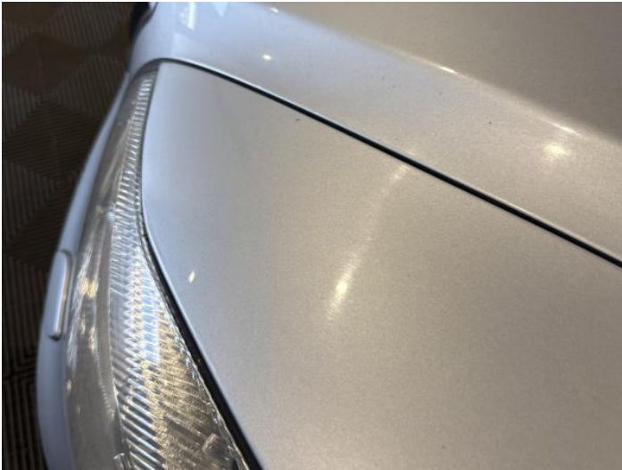
3: Wing nsf Chipped 1 To 5