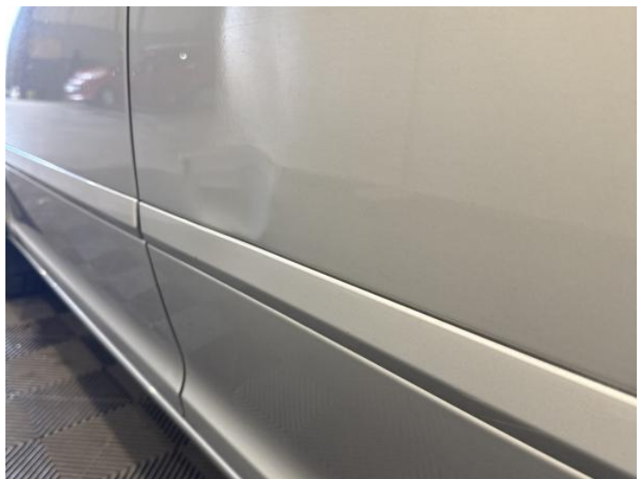
8: Door nsr Dented Over 30mm