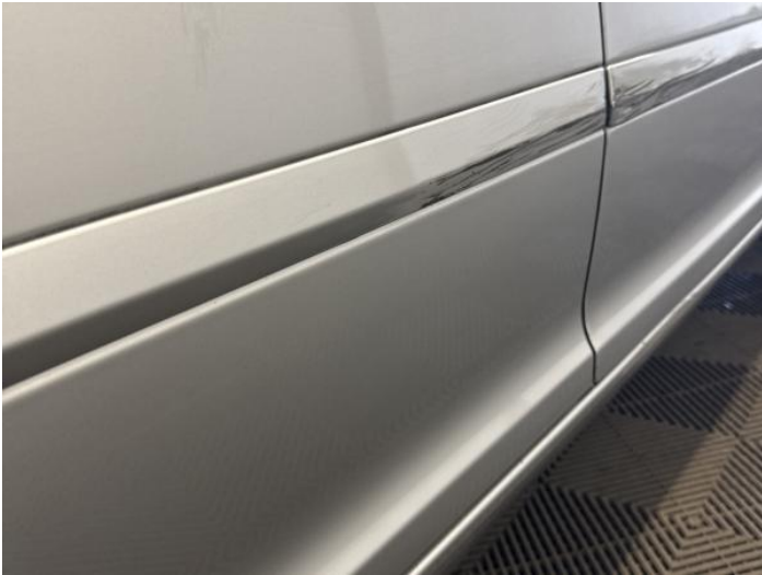
15: Door osr Scratched Over 25mm Thru Paint