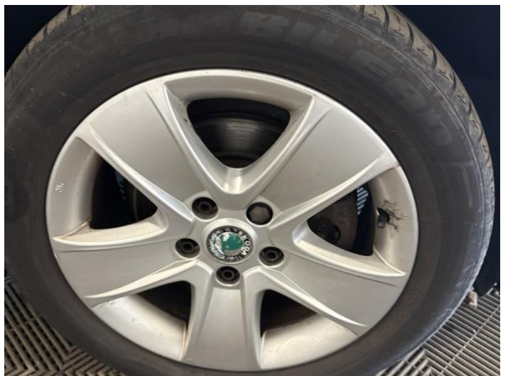
20: Wheel osf Scratched Over 50mm