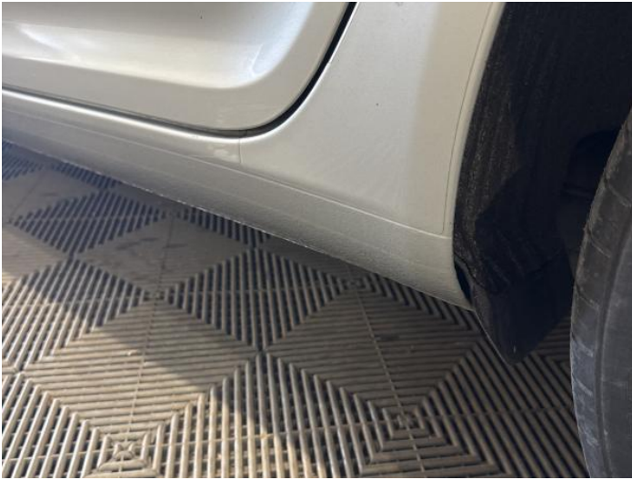
9: Sill ns Scratched Over 25mm Thru Paint