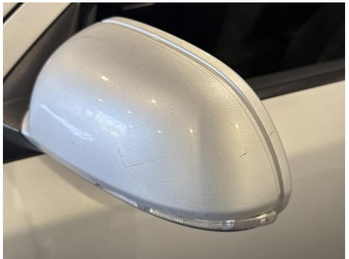
6: Door nsf Scratched Up To 25mm Thru Paint