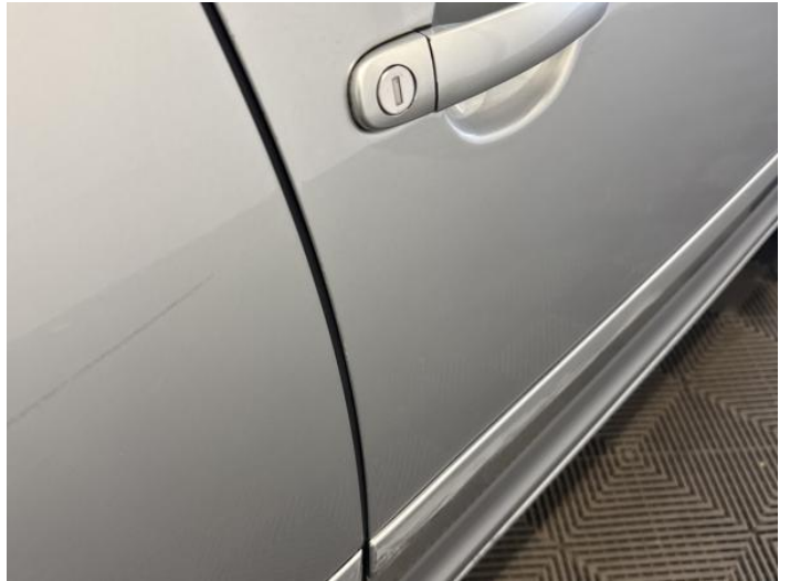
16: Door osf Chipped Edge Chip