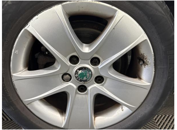
10: Wheel nsr Scratched Over 50mm