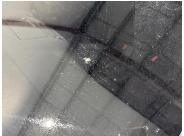
4: Screen Front Scratched Over 30mm