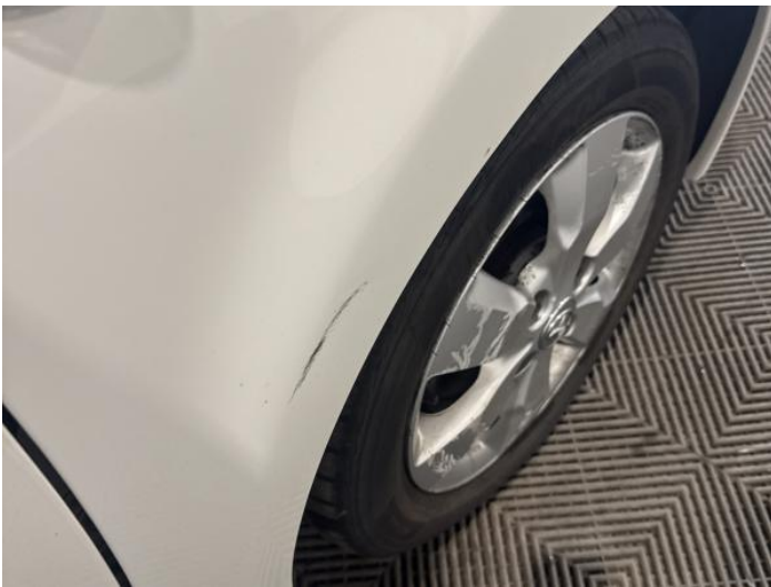
17: Wing osf Scratched Over 25mm Thru Paint