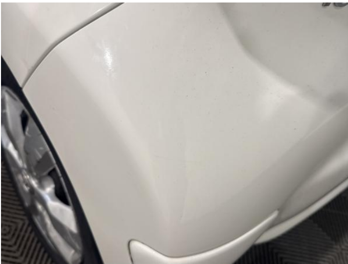
11: Bumper Rear Scratched 25 to 100mm Thru Paint