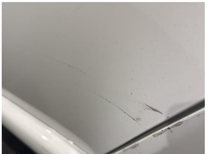
8: Door nsr Scratched Over 25mm Thru Paint