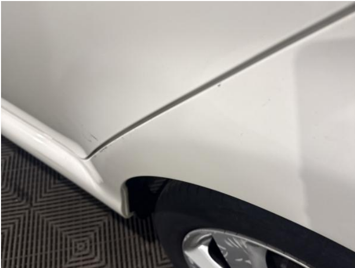
9: Qtr Panel nsr Scratched Over 25mm Thru Paint