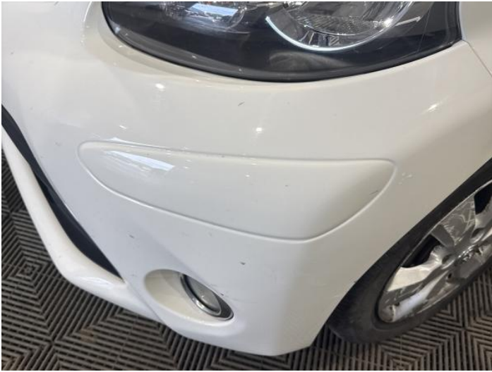
3: Bumper Front Scratched 25 to 100mm Thru Paint