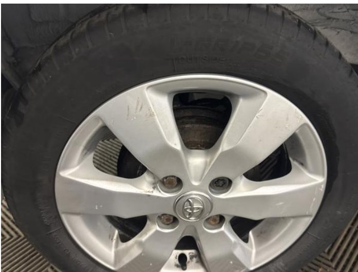
13: Wheel osr Scratched Over 50mm