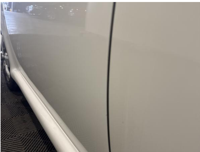
7: Door nsf Chipped Edge Chip