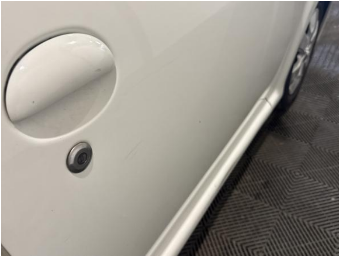
15: Door osf Scratched Over 25mm Thru Paint