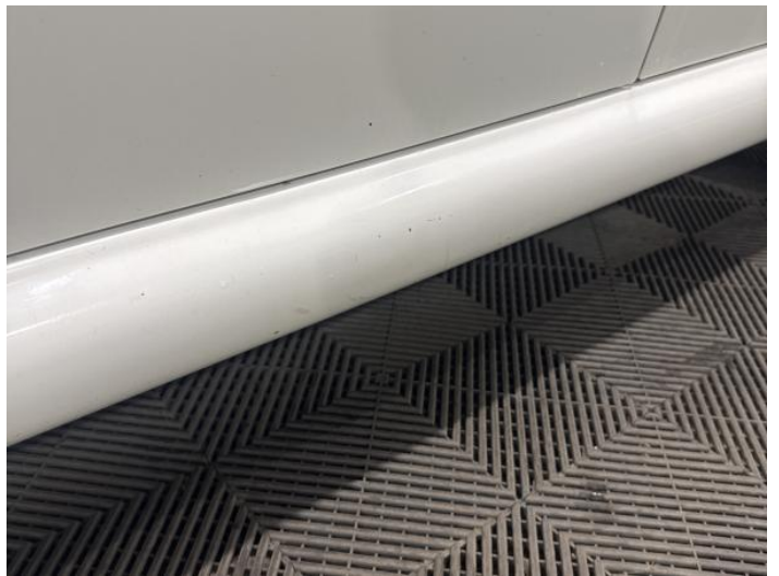
6: Wing nsf Scratched Over 25mm Thru Paint