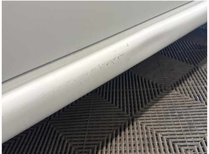
16: Sill os Dented Over 30mm