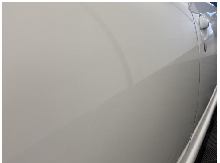
14: Door osr Scratched UpTo 25mm Thru Paint