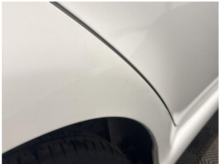
12: Qtr Panel osr Dented Over 30mm