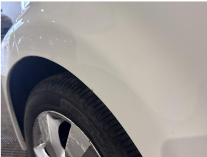
5: Wing nsf Chipped 1 To 5