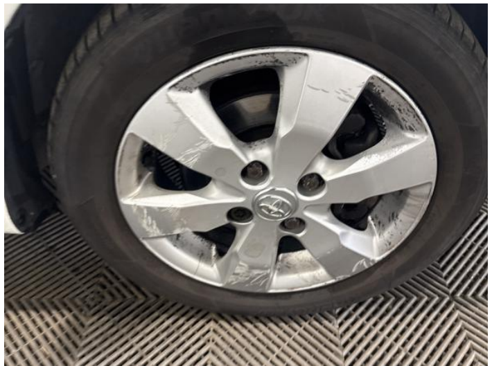
18: Wheel osf Scratched Over 50mm